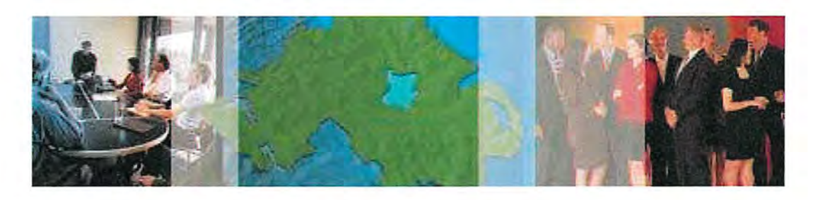
The Local Government Staff Commission for Northern Ireland