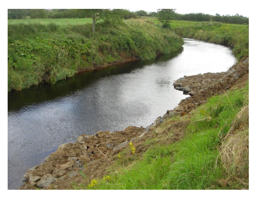
Habitat enhancement work on the River Bush.