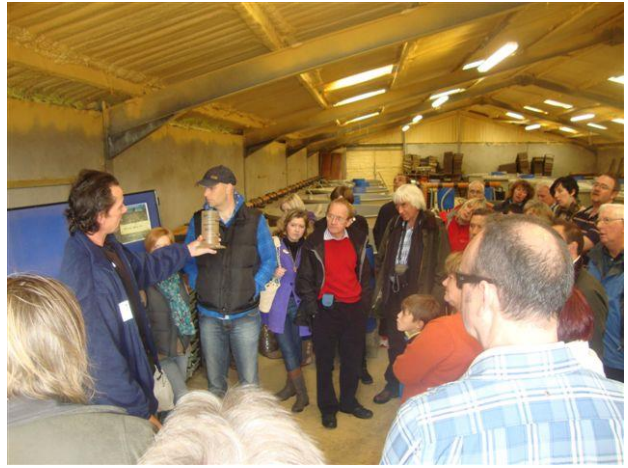
River Bush Salmon Research Station open day

In 2012 the Department held the annual open day at the River Bush Salmon Research Station as part of the Bushmills Salmon and Whiskey Festival. An estimated 1200 people, over twice the number recorded in 2011, visited the Research Station to learn about the important scientific work that goes on there. The work of the Salmon Research Station is regarded across the world as an exemplar in salmon conservation and is unique in that it can be tracked back to the 1970's.