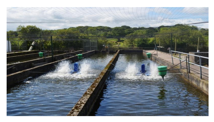
Ponds at Movanagher fish farm

Movanagher Fish Farm adjacent to the Lower River Bann, near Kilrea, produced around 140,000 brown and rainbow trout in 2010/11 and 2011/12 to supply the Department's Public Angling Estate. Redevelopment of the fish hatchery commenced in 2011 and was completed in 2012, providing a modern juvenile fish rearing unit and staff and visitors with enhanced facilities.