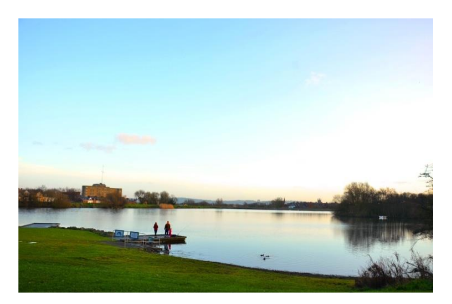
Anglers at the Waterworks Belfast

The Families at the Waterworks Fishing Club was founded in 2001 and is a cross community club, committed to participating in the ongoing regeneration of the Waterworks site and surrounding neighbourhoods in North Belfast. DCAL has supported the club by providing free stockings of rainbow trout for events organised by the club to encourage young people in the area to participate in angling.