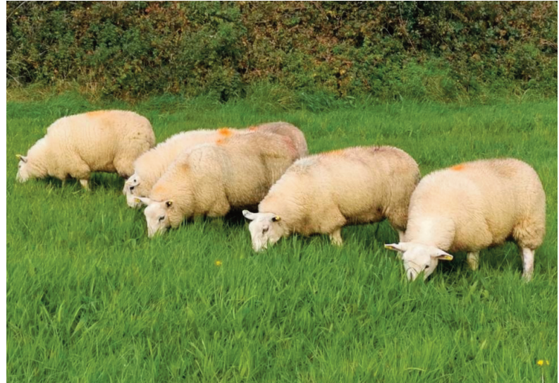
Image 1: If a FQAS participant is currently only approved for beef and would like to gain approval for sheep please call the FQAS Helpline on 028 9263 3024.

Should you wish to apply for FQAS, increase your scope to cover sheep, or require any FQAS documentation please call the FQAS Helpline on 028 9263 3024 .