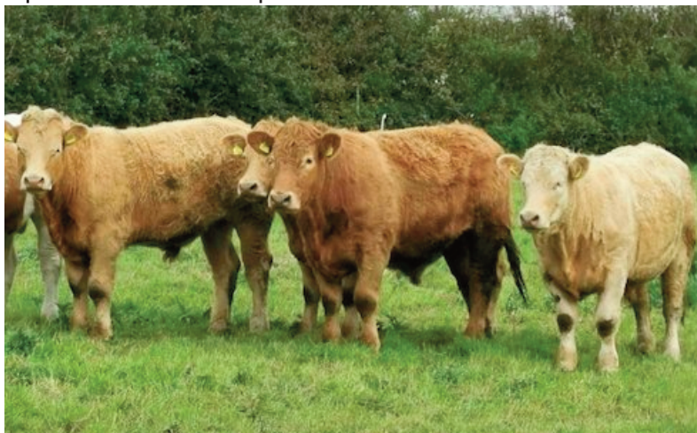
Image 1: There has been a strong increase in the number of beef sired cattle being imported from ROI for further production on local farms.

female cattle being imported from Ireland for further production have been recorded in recent months however the data available from APHIS does not allow us to differentiate between those intended for beef production and those entering the Northern Ireland dairy herd for milk production.