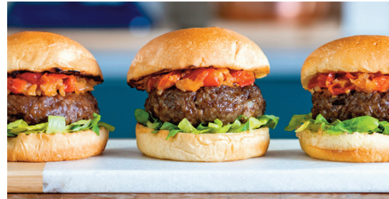
Image 2: LMC launched its new 'Truth About Beef' advertising campaign this week. For more information: www.beefandlambni.com/love-ni-beef/

a second period from January to March 2021.