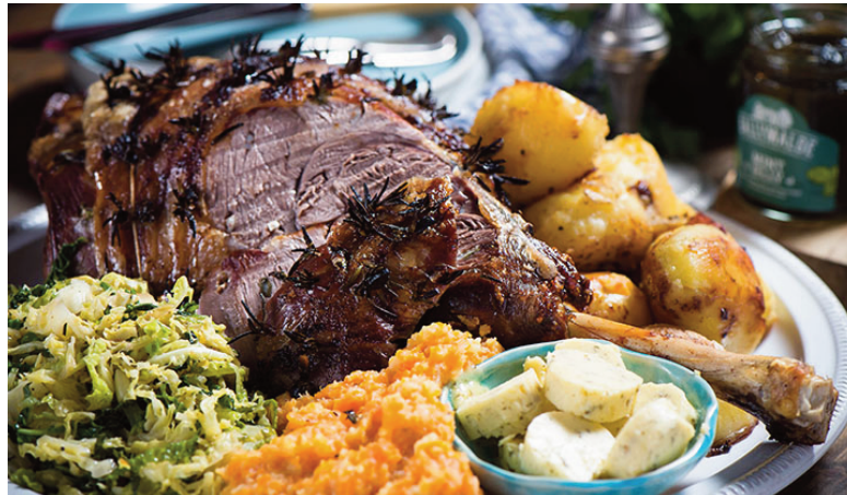
Image 1: The majority of lamb cuts have recorded increases in the value and volume of retail sales in GB during the 12 weeks ending 06 September 2020

Retail spend on lamb chops totalled £26.3 million during the 12 week period ending 06 September 2020 which amounted to a 27.9 per cent increase from the same period in 2019. In terms of volume sales, chops increased by 23.9 per cent from 2019 levels to total 2,400 tonnes. This increase in volume sales was despite an increase in the average retail price by 3.2 per cent to £10.74/kg.