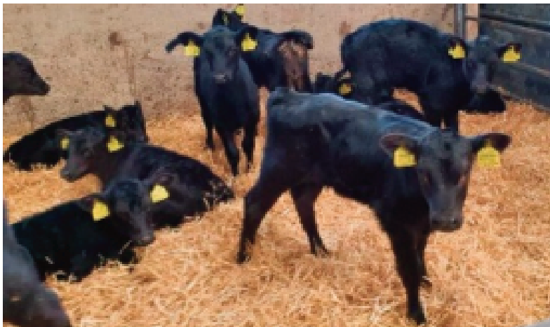
Image 1: There have been 40,252 Aberdeen Angus calves registered to dairy cows during the first eight months of 2020, up from 35,743 head in the 2019 period.

calves registered to suckler cows during 2020 to date. This is an increase of more than 3,000 head from the same period in 2019. Calf registrations to suckler cows accounted for 68 per cent of all beef calf registrations during the first eight months of 2020.