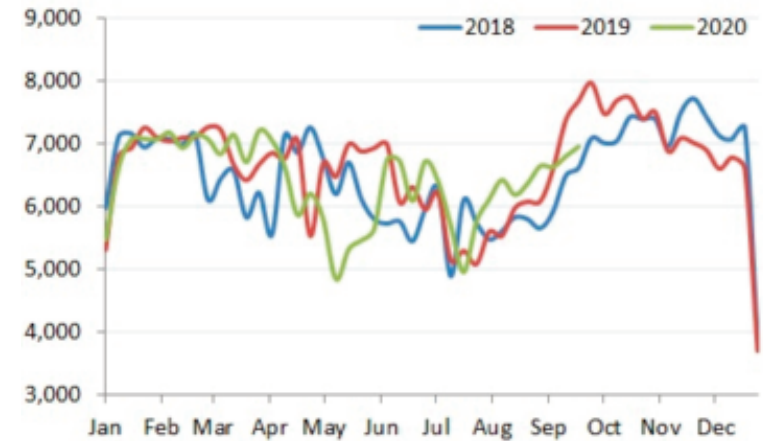
Figure 2: Weekly prime cattle slaughterings in Northern Ireland from 2018-2020 YTD. Source: DAERA

data available from APHIS. At the start of September 2020 there were 241,528 cattle for beef production on local farms, back 9,136 head or 3.6 per cent from the same time last year.