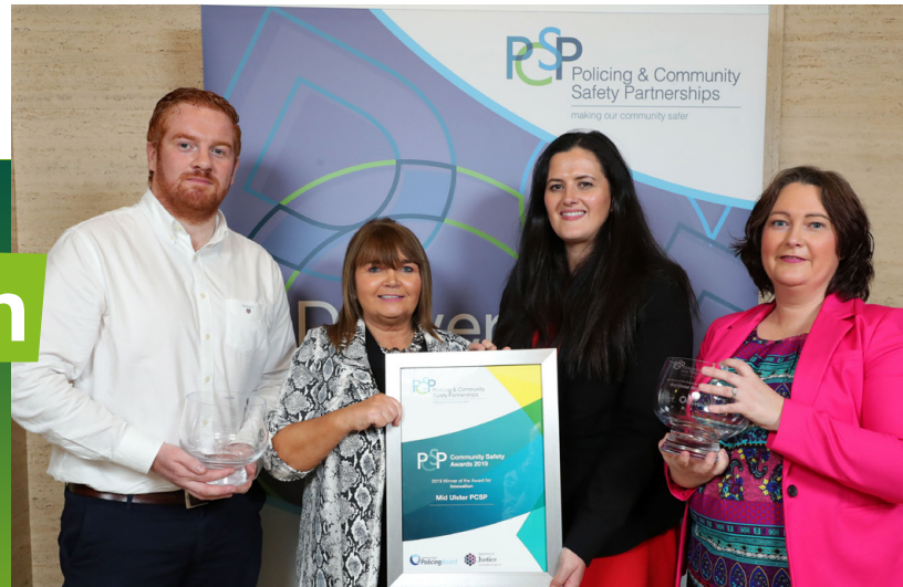
Members of Mid Ulster PCSP with Claire Sugden MLA.

This award recognises outstanding innovation that has improved upon, or extended beyond, current expectations of best practice.