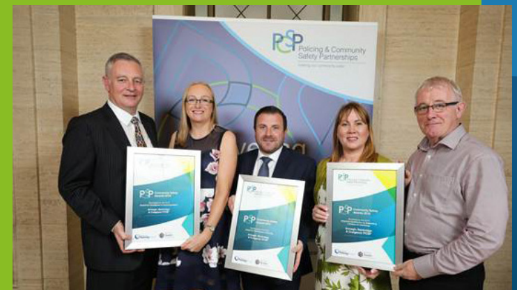
Members and staff of Armagh, Banbridge & Craigavon PCSP receiving their certificate.

This is down to the hard work of staff, who engage the public with their work and that of partner agencies by switching up traditional corporate approaches to posting and embracing a more conversational, friendly tone along with an increase in video content.