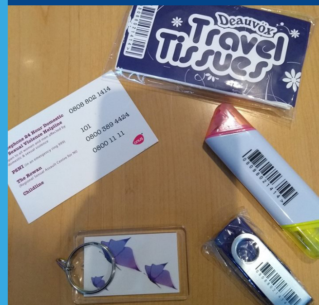
An example of the available resources.

click here to find out more about the Northern Domestic and Sexual Violence Partnership.