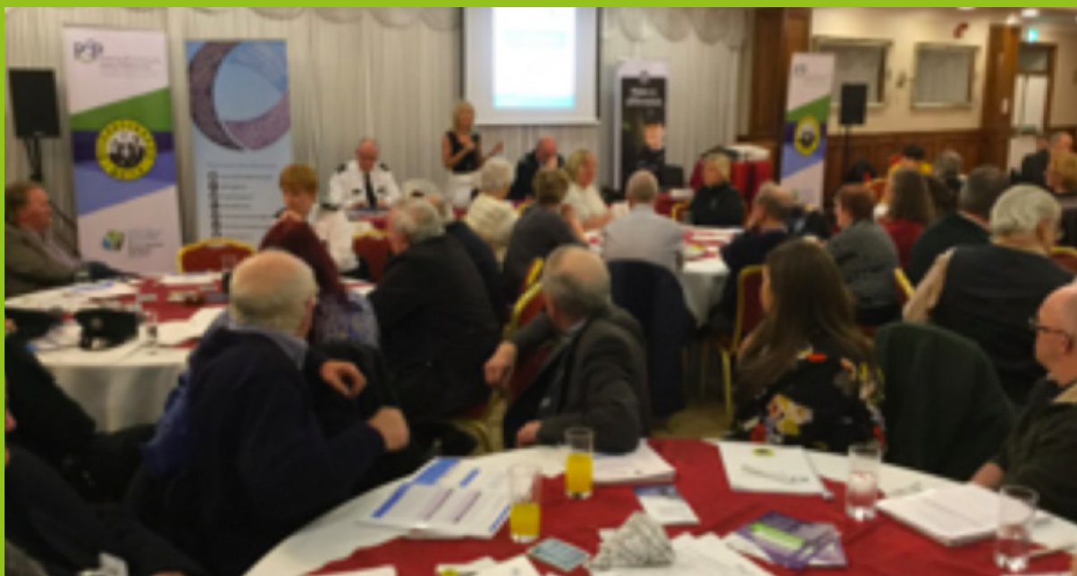
A great turn out for the Local Policing Consultation meeting hosted by Newry, Mourne & Down PCSP

We also prioritise working with partners on programmes that assist young people and their parents in making smarter decisions online and via social media, educating them on the dangers that exist.