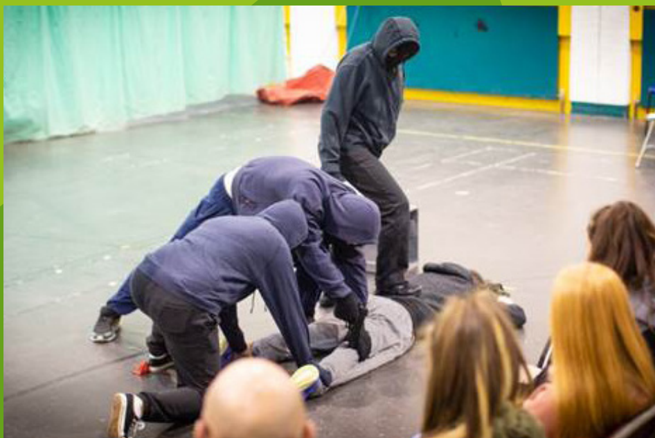
A performance of the play in the Ards Arena

click here to find out more about #EndingtheHarm.