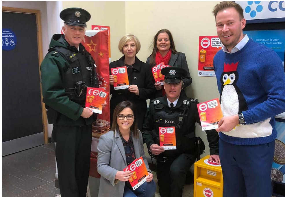
Representatives from PCSP, RAPID and PSNI launching the bin in Tesco Lurgan