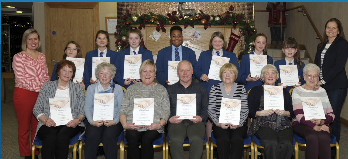
Participants in the project with their congratulatory certificates