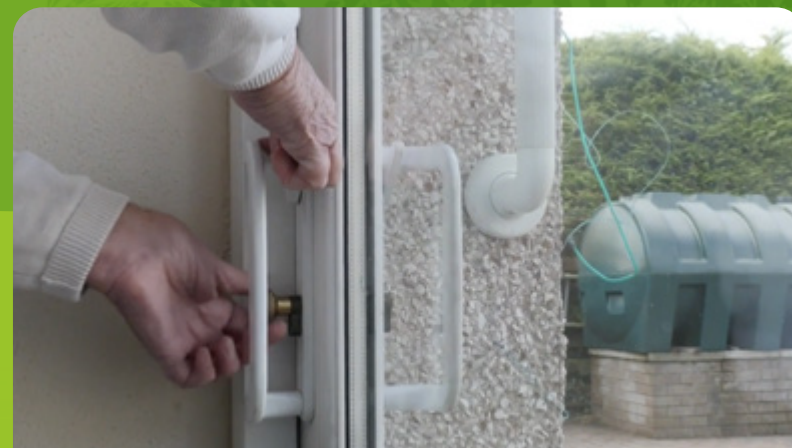
Watch the Home and Property Safety video