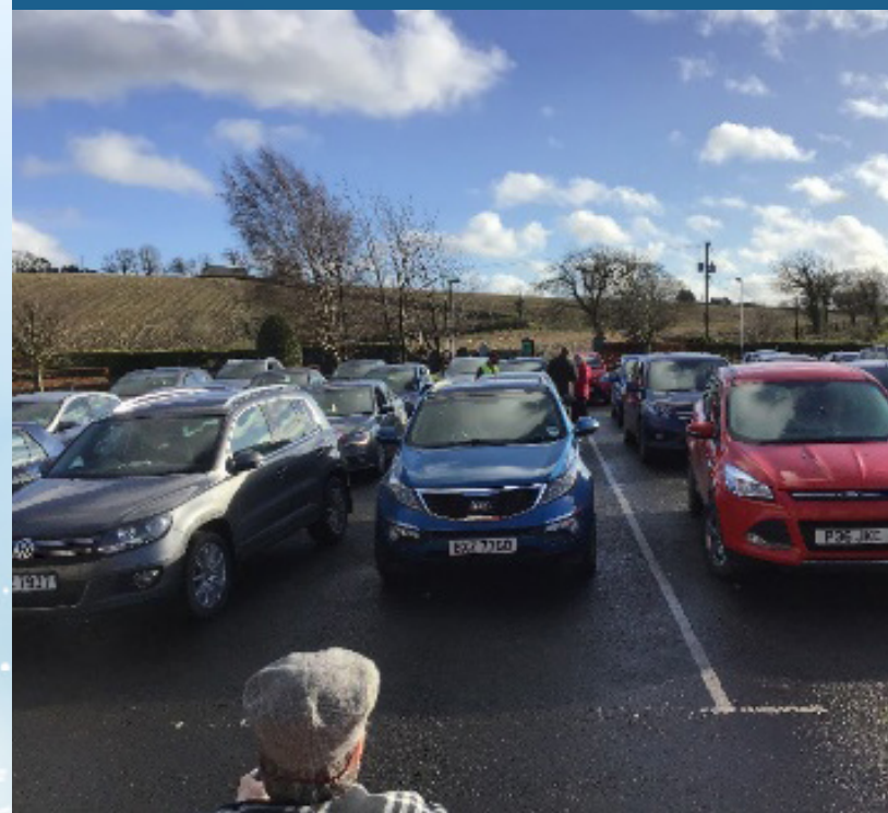
The audience listen to safety advice from the safety of their cars

The event was held in partnership with The 60+ Luncheon Club and replaced usual in-person talks. Feedback from the event was positive with reports of all enjoying and feeling much benefited by the information received.