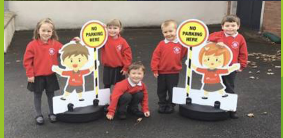
Pictures shows presentations to St Patrick PS in Eskra, Omagh County Primary, Florencecourt Primary School and St Mary's Primary School Mullymesker.