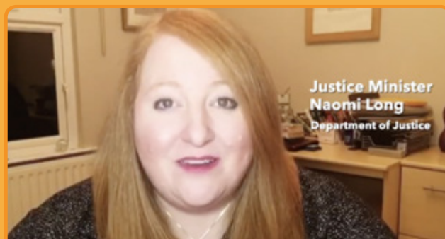
Naomi Long, Justice Minister