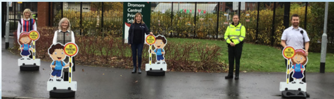
Anita Stop and Luke Listen make their appearance at Dromore Central Primary School