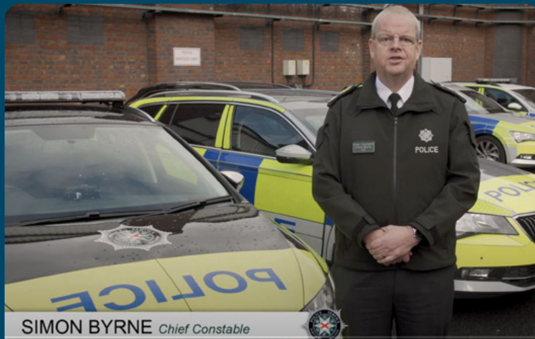
SIMON BYRNE Chief Constable

Watch what Chief Constable Simon Byrne had to say about the uniform trial