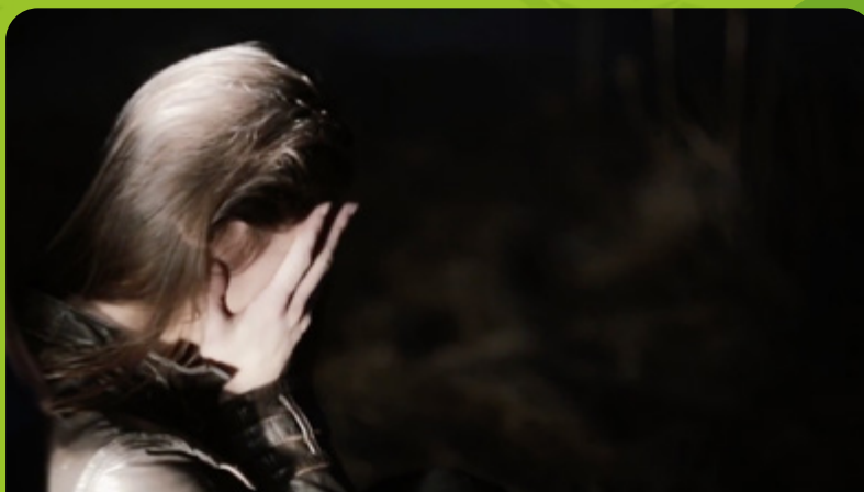
Watch the Domestic Abuse advice video

After engaging with local Neighbourhood Watch Coordinators, Causeway Coast & Glens PCSP have acted on requests for further general crime prevention advice. In liaison with partner organisations, including Women's Aid, COAST and the PSNI, four videos were created. Each video focuses on a different crime and advice on prevention. The videos were released on a weekly basis throughout November.