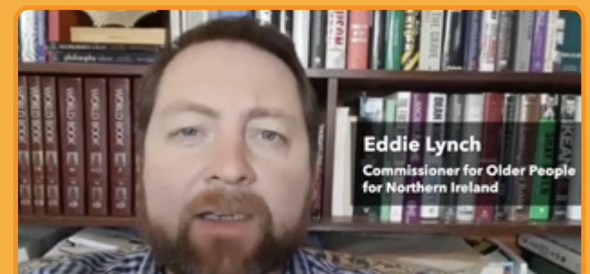
The Commissioner for Older People for Northern Ireland, Eddie Lynch