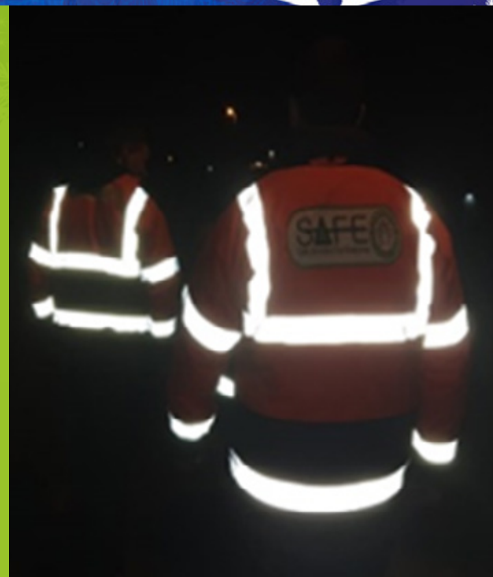
Volunteer Safety Wardens on patrol in Strabane, engaging and supporting the community

The Volunteer Safety Warden Scheme will carry out weekend patrols over a 12-month period in areas identified as high problem hotspots.