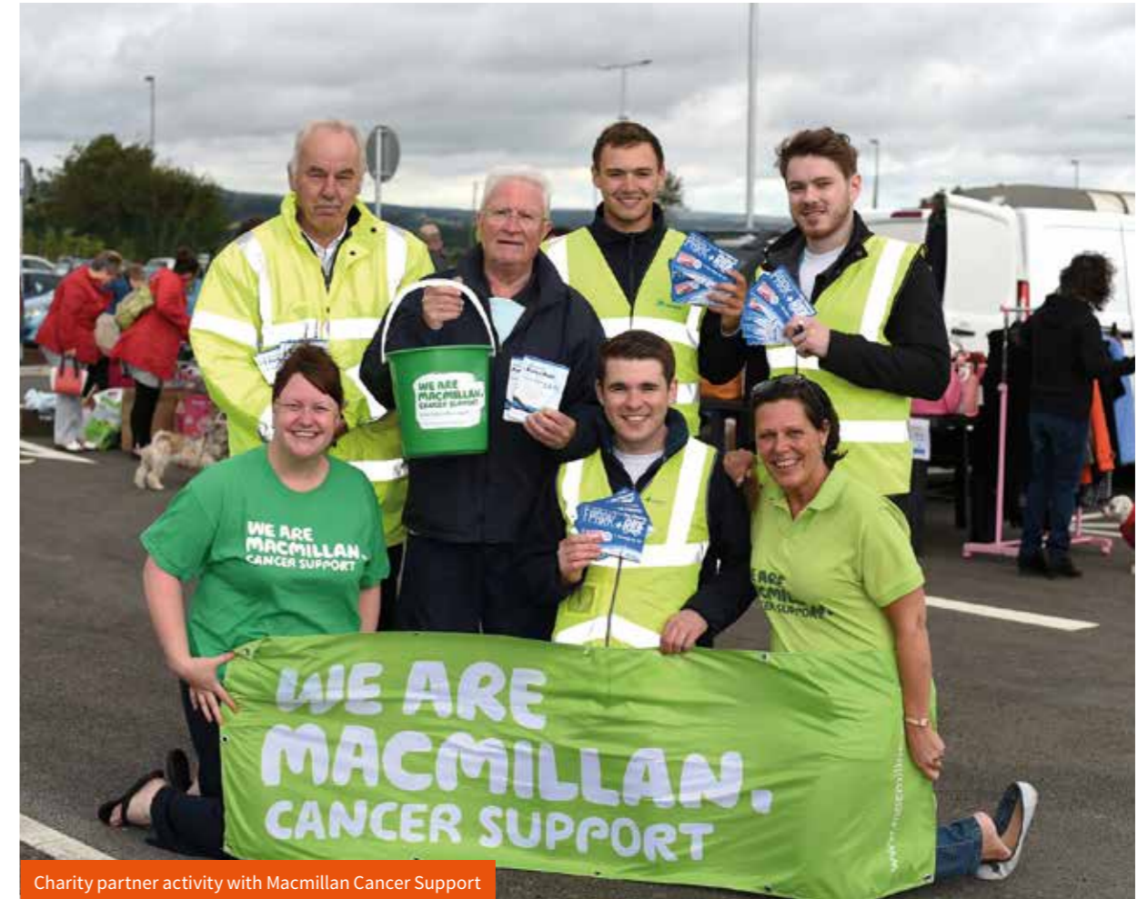
Charity partner activity with Macmillan Cancer Support

At the same time we have been active in the community, making sure we inform local residents and businesses on a range of service changes and local projects being carried out in their area, and wherever possible taking account of their views.