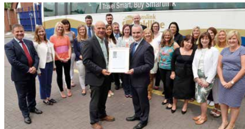
We are proud to be recognised as an Investor in People having attained a number of awards throughout the organisation

Nineteen bus and coach operators from all over the UK were put through their paces in a series of theoretical and practical engineering challenges including