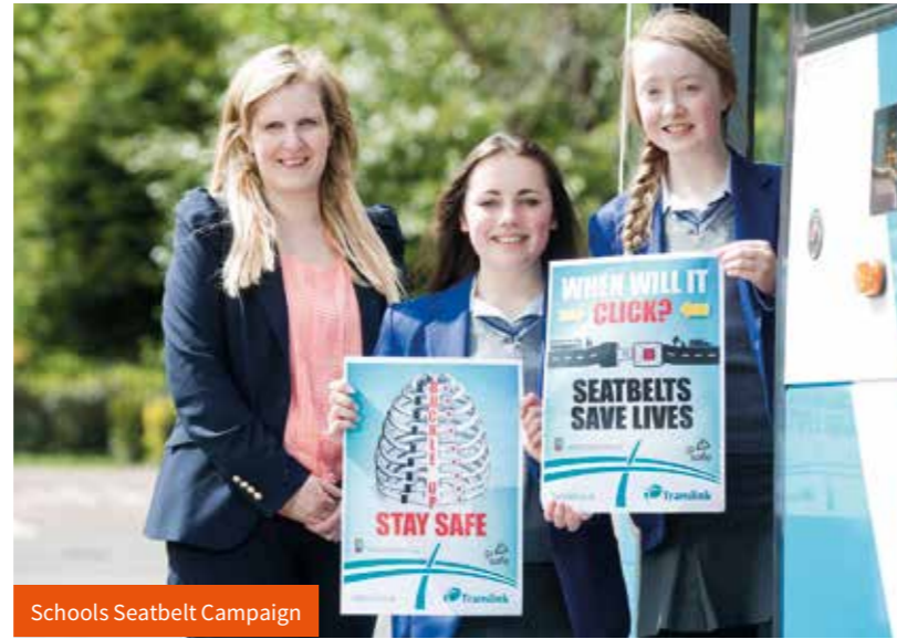
Schools Seatbelt Campaign