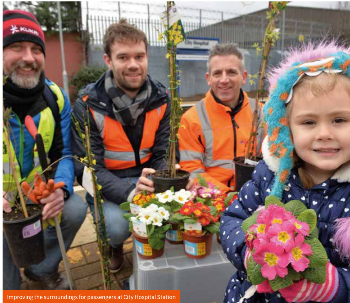
Improving the surroundings for passengers at City Hospital Station