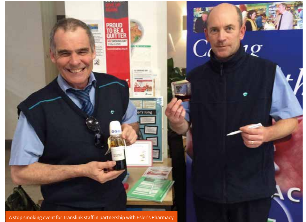
A stop smoking event for Translink staff in partnership with Esler's Pharmacy

Local health and wellbeing champions have been appointed to provide information to colleagues about the programme and encourage them to participate in health and wellbeing initiatives.