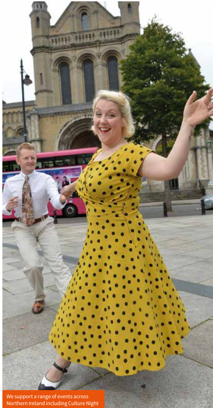
We support a range of events across Northern Ireland including Culture Night