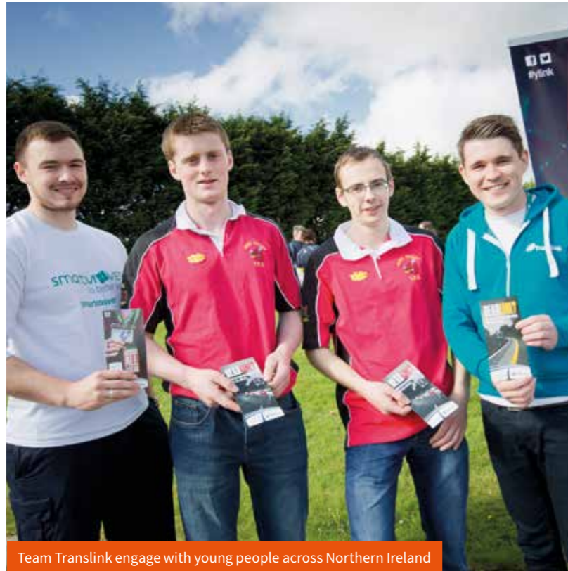
Team Translink engage with young people across Northern Ireland

Over 10 charities have benefited from the Translink Staff Charity Scheme in the last year donating over £9k.