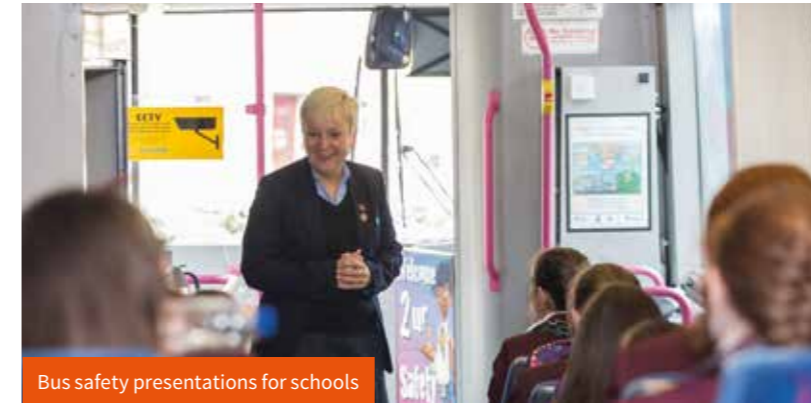
Bus safety presentations for schools

As much of the NI Railways track runs through rural farming communities, as a good neighbour it is vital that we work alongside farmers, other rural residents and local businesses to build relations and educate them on their obligations around the rail network.