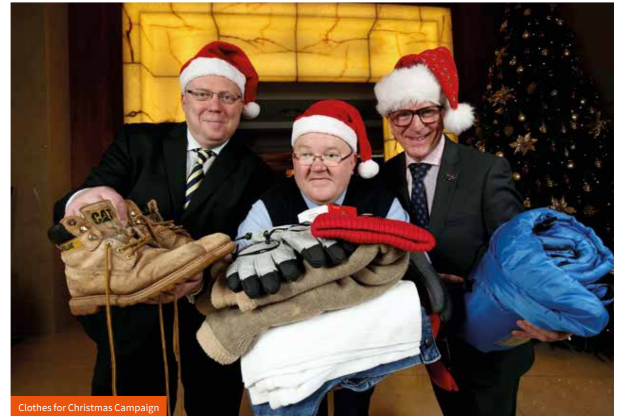
Clothes for Christmas Campaign