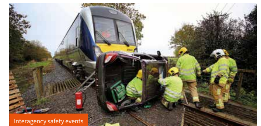
Interagency safety events

The incident simulated a car being struck at a crossing by a train. The car was overturned with passengers trapped inside and needing to be safely cut out of the vehicle.