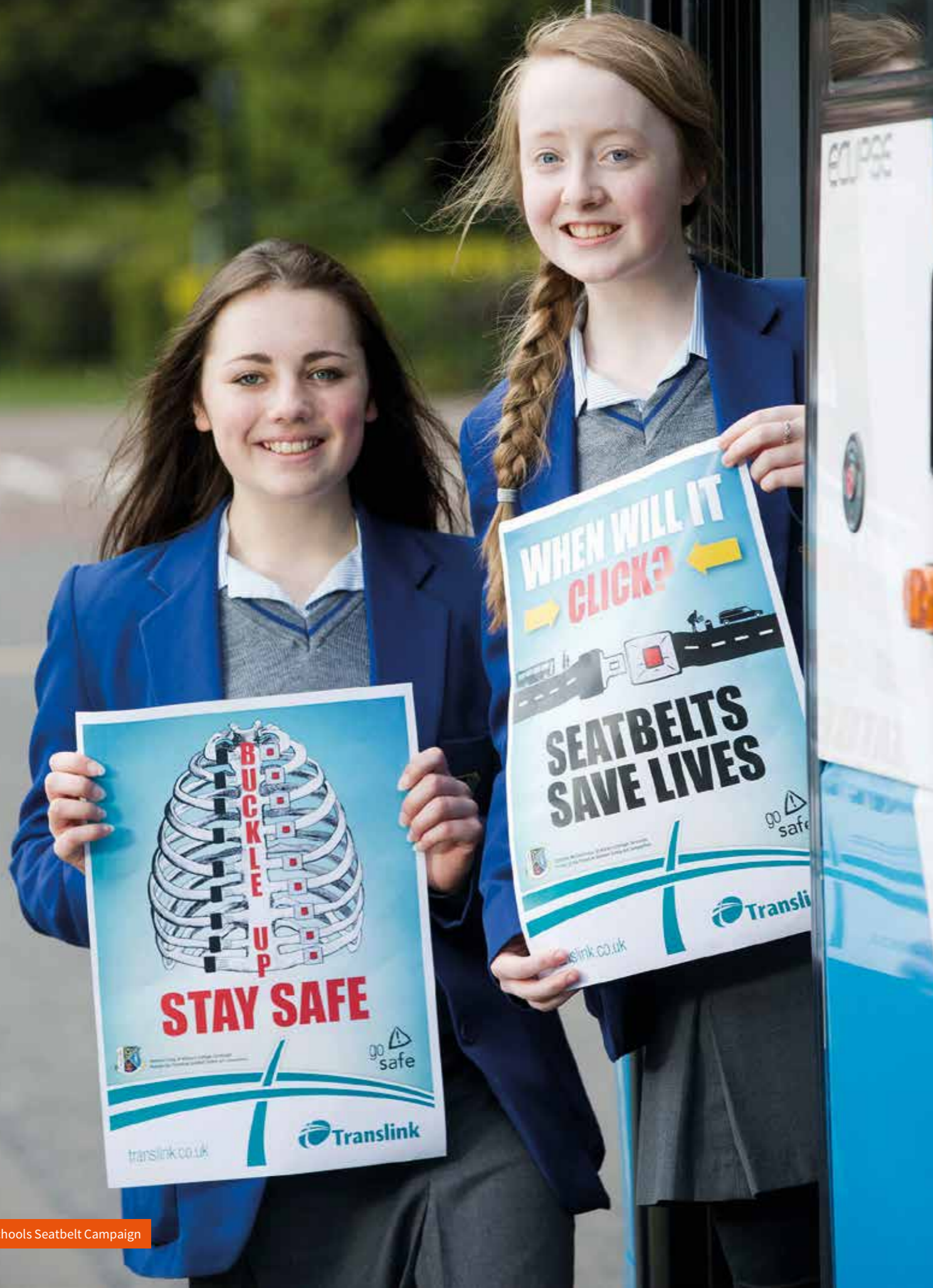
Schools Seatbelt Campaign