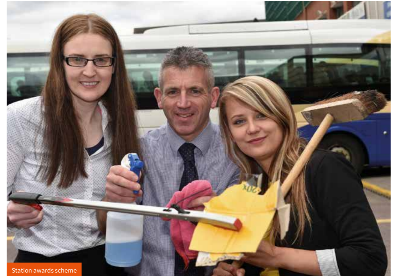
Station awards scheme

Over a two-week period, 36 local schools participated in the Translink Eco Schools Travel Challenge with more than 1,100 pupils monitoring their travel patterns and making an effort to walk, cycle and use the bus or train for the school run. During the challenge, there was a massive shift away from car use to sustainable travel. Active forms of travel increased by 45% over the baseline in participating schools.