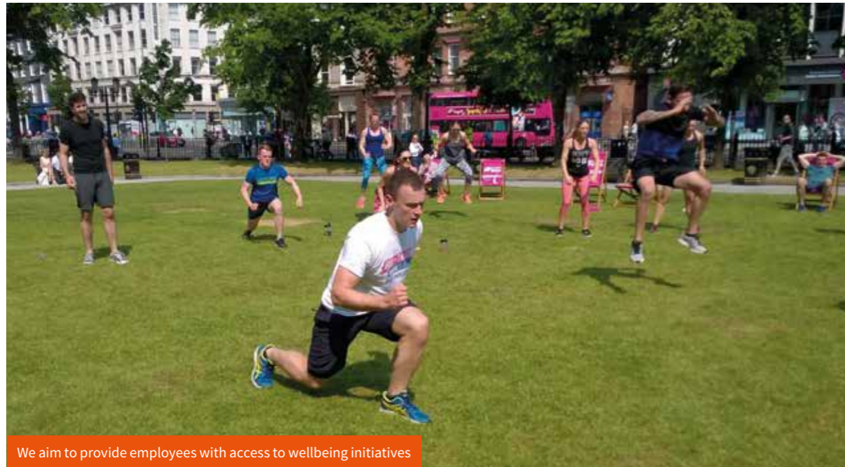
We aim to provide employees with access to wellbeing initiatives