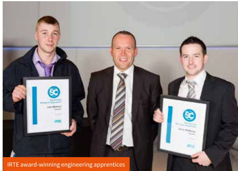
IRTE award-winning engineering apprentices

This year we have further increased our emphasis on training, involving our employees in the business and creating an inclusive workforce.