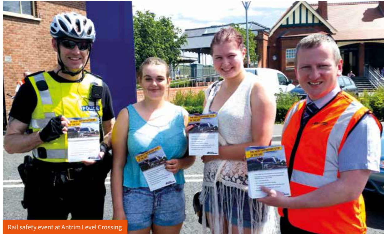
Rail safety event at Antrim Level Crossing

The safety and wellbeing of our customers, employees and general public remains central to Translink's operations.