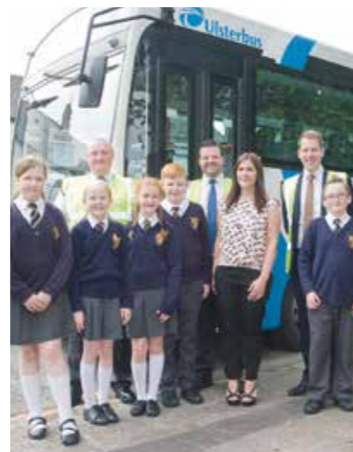
Bus Safety with Model Primary School

We continue to be involved in this popular interagency event attracting over 600 primary schools over a three-day period. Local staff have the opportunity to talk directly to school children about how to use bus services safely and promote the benefits of active travel.