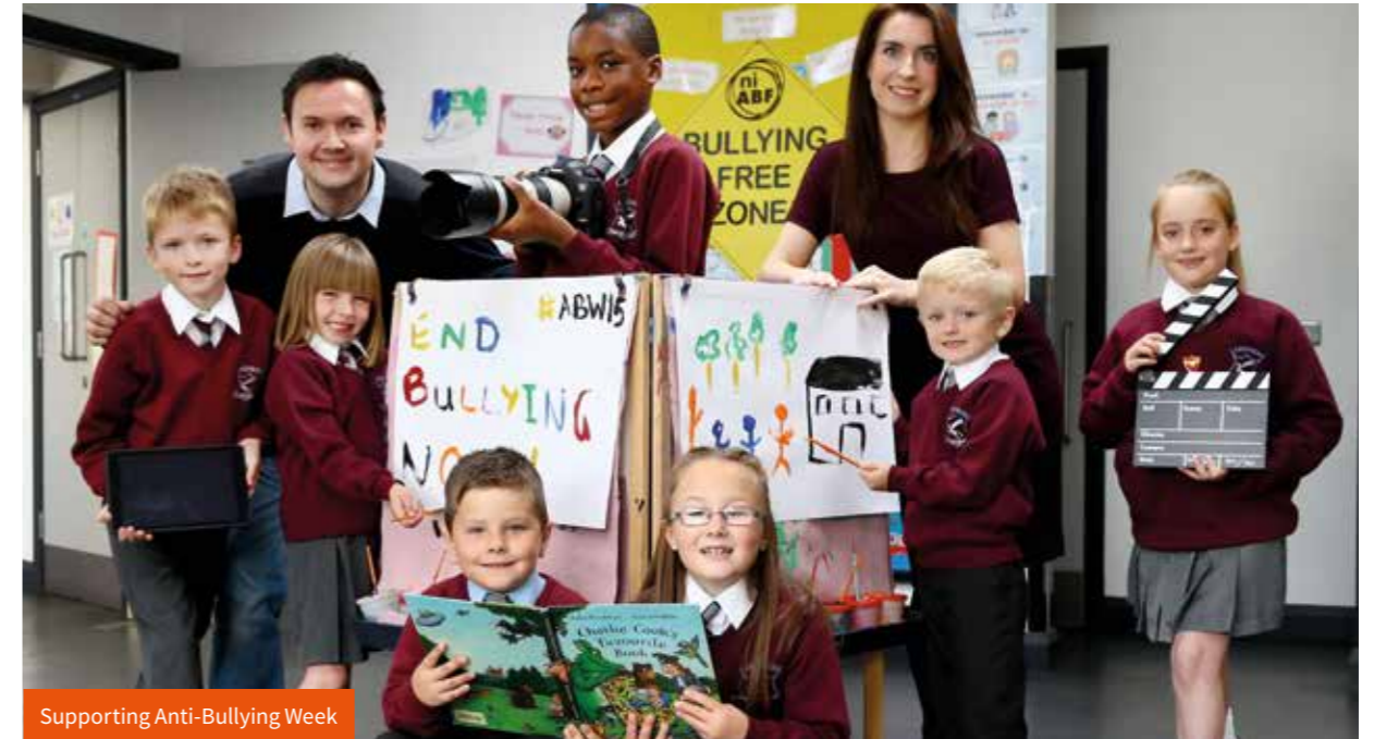
Supporting Anti-Bullying Week