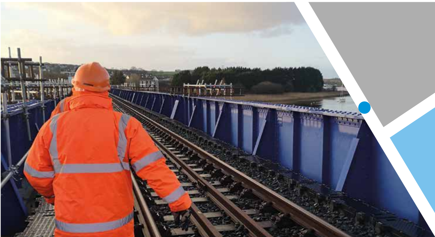
Bann Bridge Bearing Replacement Work in Coleraine

A Safety, Health and Environmental Leadership Team (SHELT) has been established on the Belfast Transport Hub project. The SHELT focus is on driving high standards of safety, health and environmental management on the project and through a series of workshops and mapping exercises it was determined that a behavioural based safety programme should be introduced on the project. As a result, culture and behaviour awareness training material has been developed and delivered to the project team and will be rolled out to all contractors and suppliers engaged on the project. The SHELT group has established a SH&E Vision for the project outlining key strategic focus areas for high performance targets on the project - the development of an ongoing behavioural improvement programme is just one of these key focus areas.