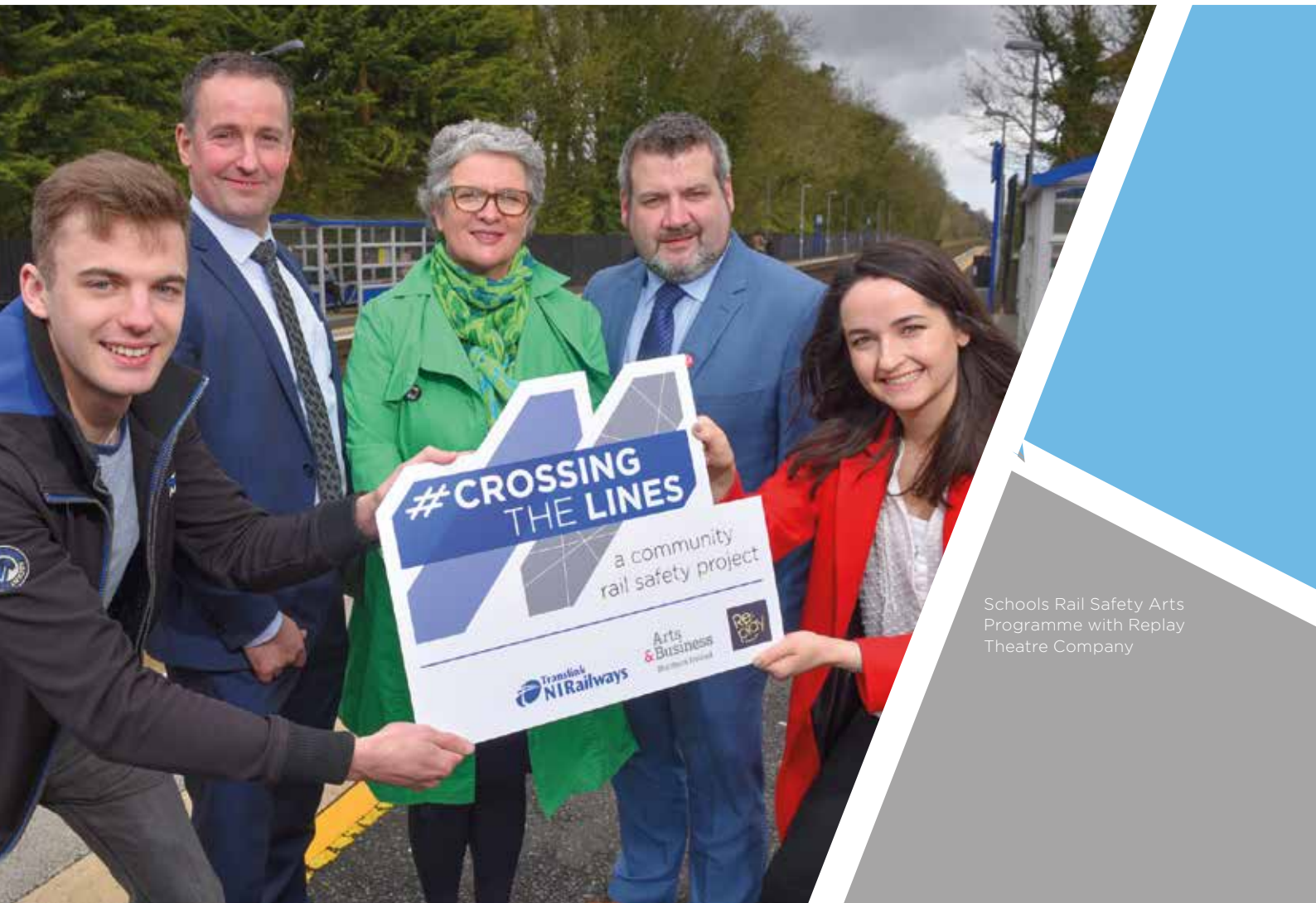
Schools Rail Safety Arts Programme with Replay Theatre Company