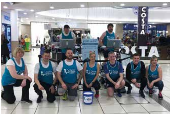
Magherafelt Bus Drivers Static Run for Cancer Focus

Organised by Magherafelt depot, the local Translink team ran 72.4 miles, the total distance of one of the most popular express routes, the 212, from Derry-Londonderry to Europa Bus Centre in Belfast. The team recognised the health and wellbeing benefits of physical activity, working together and giving to others.