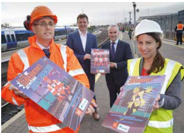
Invisible Superheroes campaign launch

This was a really fun way to raise the profile of those engineers behind some of our exciting construction and engineering projects that are helping to transform public transport to enable Northern Ireland to prosper and grow. Engineers got on board adopting a playful, creative comic book character to help inspire the next generation to consider engineering within the public transport sector as a rewarding career.