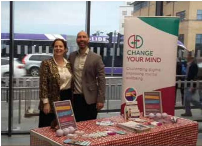
Inspire Mental Health Awareness Information Session