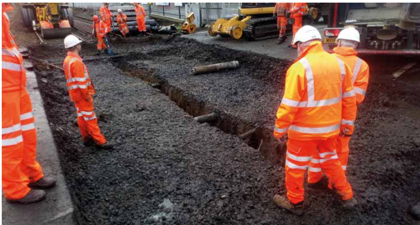
Lurgan Area Track Renewal Project Safety Work

Our commitment to 'Don't Walk By' continues to reinforce a safety culture that encourages staff to look out for each other, 'Don't Walk By' and to speak up if something appears unsafe or damaging to health or the environment.