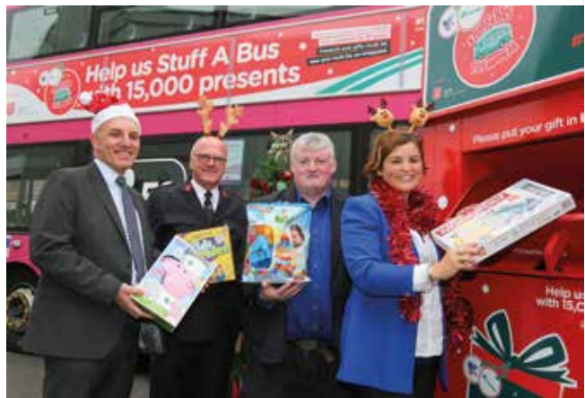
Above (l-r): Making the Roadshare video/ Launching the Connections Project/ “Stuff a Bus” campaign launch