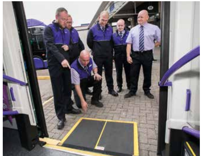
Safety Briefing for new Glider Staff

The Hazard Register shows the identified hazards across the business alongside how we are managing each risk. We are continually developing and refining the system to capture information as events happen to ensure the top risks are identified at a given point in time to help in the preparation of action plans for the relevant Divisions.