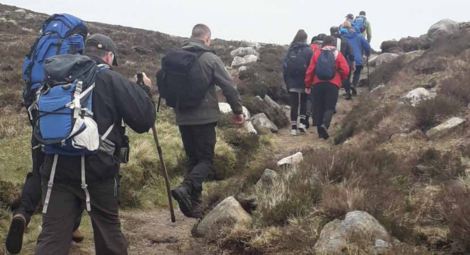
Translink Hiking Club organised by Milewater Service Centre Glider Drivers