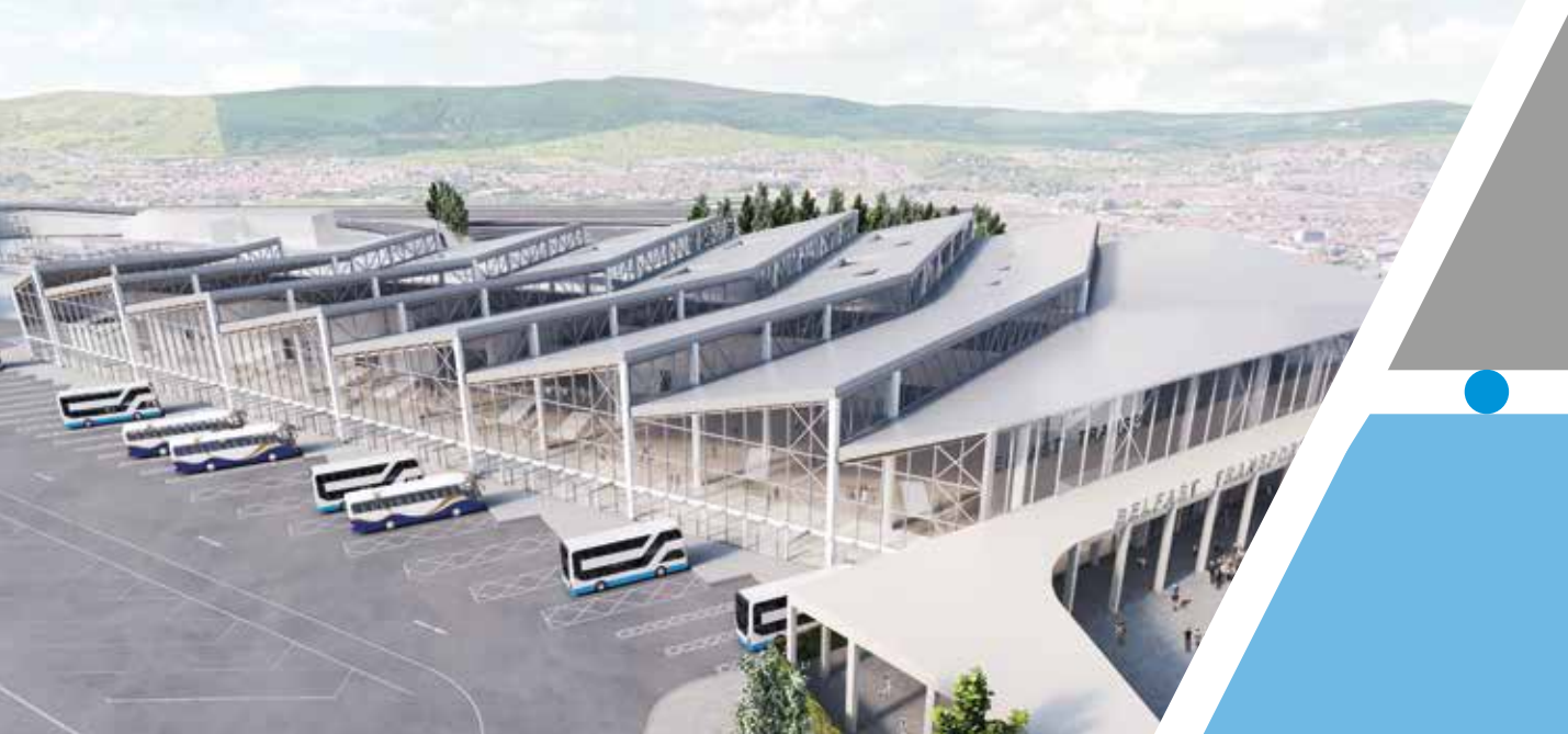
Belfast Transport Hub- Artist's Impression

It is expected that the Hub will take approximately five years to complete, with over 400 jobs being created. This sits alongside commitments to Buy Social and a Construction Academy, which will provide job readiness by targeting local communities to provide information, training and ongoing support to new entrants and apprentices, maximising social and economic benefits for communities across Belfast.