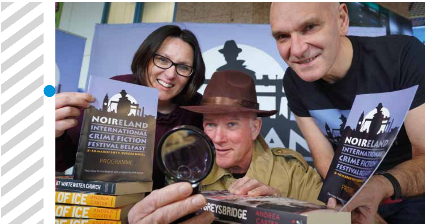
Launch of NOIReland