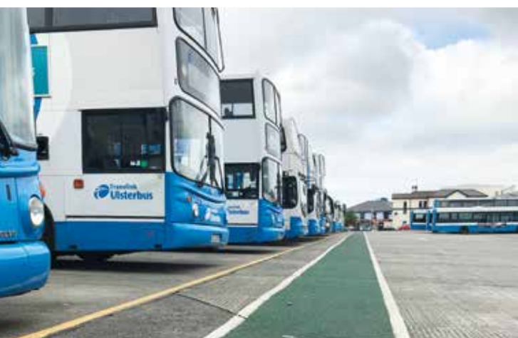
Safety Upgrade Project completed at Coleraine Bus and Train Station

5th Annual Bus Health and Safety Presentation was delivered by Service Delivery Managers to all bus operational staff approx 1800. The presentation is mainly aimed at bus drivers and acts as a reminder of important safety messages. This year's presentations main message was on distraction but also included