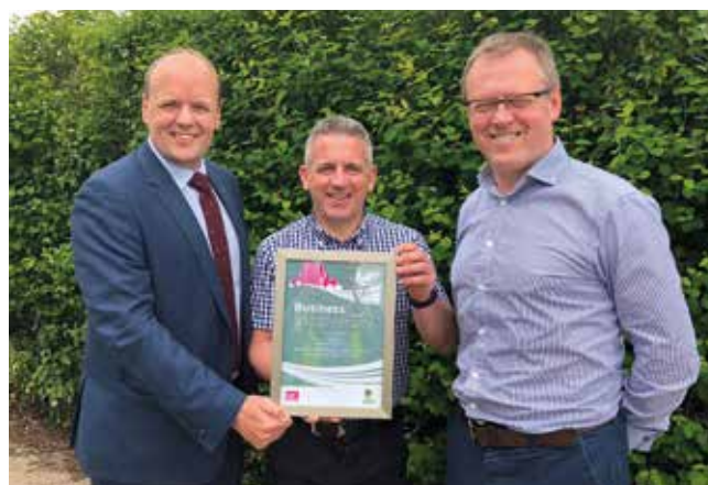
Translink receiving their Platinum level Business & Biodiversity Charter from Business in the Community Northern Ireland

Translink has again been awarded Platinum Level in the Business & Biodiversity Charter by Business in the Community, in partnership with Ulster Wildlife, for its outstanding commitment to protecting and enhancing biodiversity. We have a significant property portfolio across Northern Ireland, including over 200 miles of railway track, which provides a unique green corridor for local, national and internationally important biodiversity.