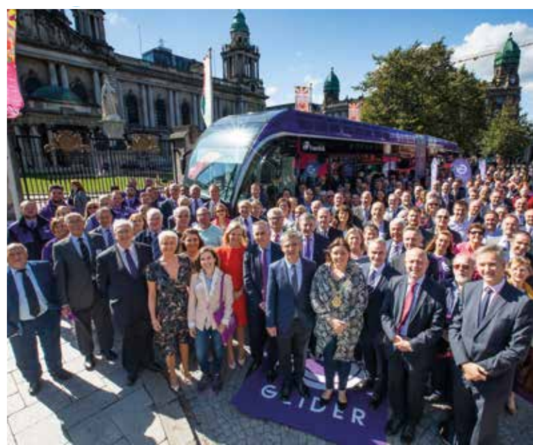
Above (l-r): Employees celebrate at Belfast Pride Festival / Smartmovers Dance / Glider launch