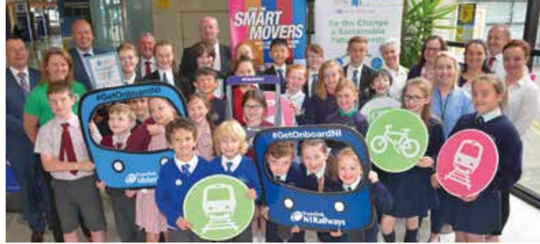
(L-r): Newry Bus Station became Platinum Awards Winners of the Spirit of Translink Facility Awards / Eco Schools Awards Event

Some examples of initiatives across the organisation include bug hotels and bird boxes at Foyle Street Bus Station; staff garden areas at Antrim Bus and Train Station, Newry Bus Centre, Newry Rail Station and Strabane Bus Station which not only created environmentally friendly spaces (Go Eco) but also created outdoor space for employees (Go Healthy). Staff at Botanic Station focussed on Go Healthy with walking routes displayed. SPIRIT noticeboards are also prominent at many locations e.g. showing planting at Great Victoria Street to local history at Ballymena Rail Station and railway history at Lisburn Rail Station.