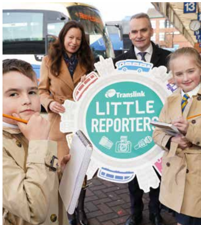
Launch of Little Reporters Competition in partnership

Key events in 2018 included our Roadshare stunt, Business Stakeholder event, Ulster in Bloom launch, Connections photography exhibition, Little Reporters competition and Cancer Focus NI in-station activity.