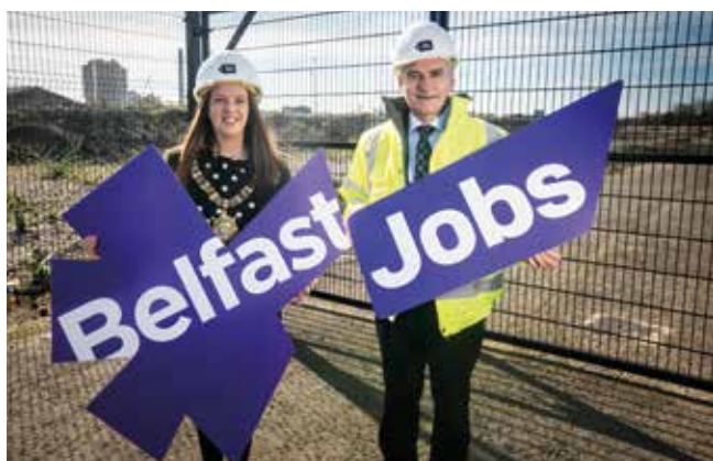
Jobs announcement for Belfast Transport Hub

It is expected that the Hub will take approximately five years to complete, with over 400 jobs being created. This sits alongside commitments to Buy Social and a Construction Academy, which will provide job readiness by targeting local communities to provide information, training and ongoing support to new entrants and apprentices, maximising social and economic benefits for communities across Belfast.