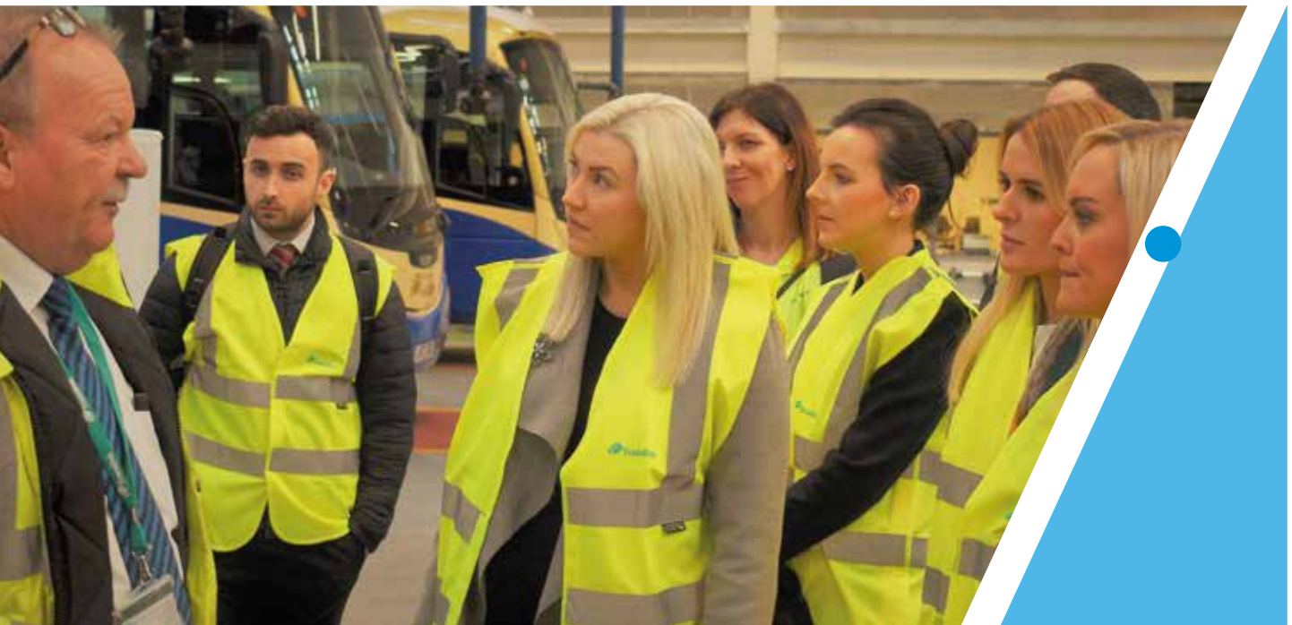
Safety Improvement Programme Briefing with Bus Engineering Division