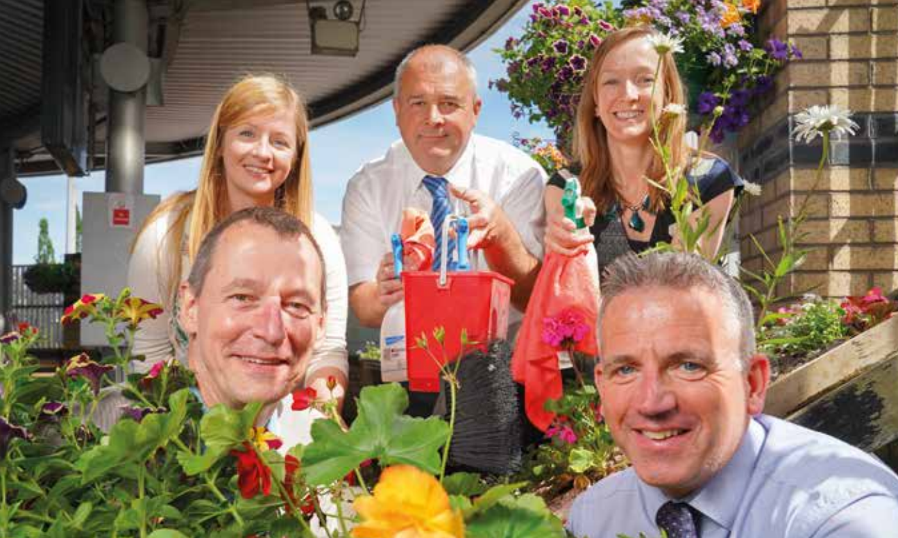
Launch of The Spirit of Translink Facility Awards