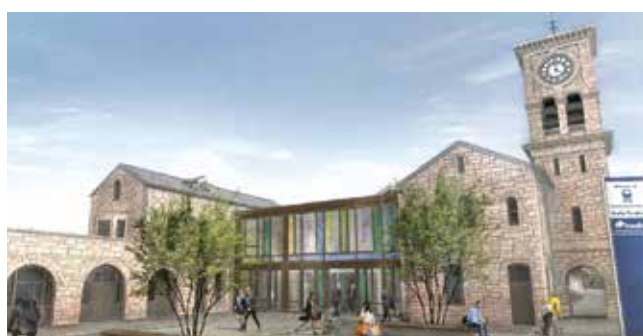
North-West Multi Modal Transport Hub Development

Phase 1 works, including the opening of the station building, will complete in late 2019, with Phase 2 works, including carpark and bus turning circle works, completing during 2020. We undertook a significant campaign of stakeholder engagement prior to the granting of planning approval, and have worked closely with local schools, training groups and other stakeholders throughout this project