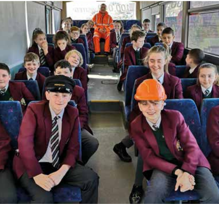
School pupils visiting the Safety Bus