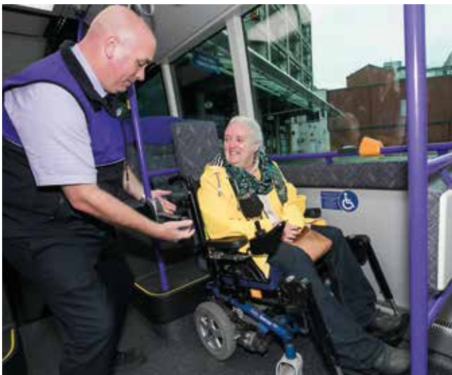
Accessibility briefing for Glider staff

We continue to actively work with the Inclusive Mobility and Transport Advisory Committee (IMTAC) to 'design in' accessibility at the outset for all we do, making our services welcoming, integrated and accessible to all. A new 'Access to Glide' guide was developed in partnership with IMTAC setting out advice for disabled and older people to help them access the new Glider service in Belfast.