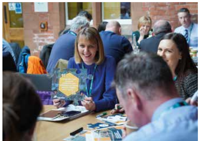
Annual Safety, Health and Environmental Conference