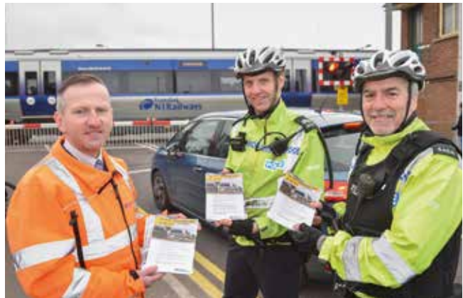
Rail Safety Engagement with PSNI

supported International Level Crossings Awareness Day. This approach has led to a 35% reduction in people trespassing onto Translink property.