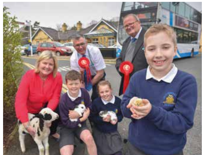
Translink supports the Balmoral Show

Events are a key economic driver and as such we have worked closely with event organisers to provide bus and train options which have ensured their successful delivery and helped build NI's reputation as a stand out location for great events. Highlights have included Belfast Vital, Culture Night, key football, rugby and GAA matches and Balmoral Show.