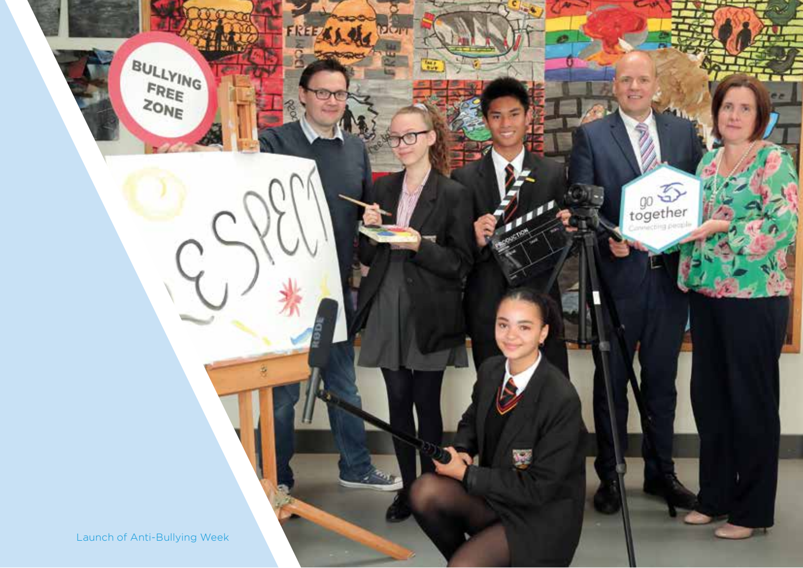
Launch of Anti-Bullying Week