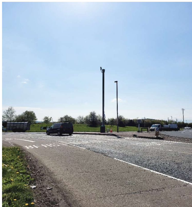
Nutt's Corner Roundabout - Traffic Camera

The traffic camera at Nutt's Corner Roundabout was commissioned in January 2022. This provides live traffic information to the Traffic Information and Control Centre and will also be viewable by the public on the departmental website. This will enable closer monitoring of traffic using the junction to assist in the consideration of other measures to improve safety and reduce congestion.