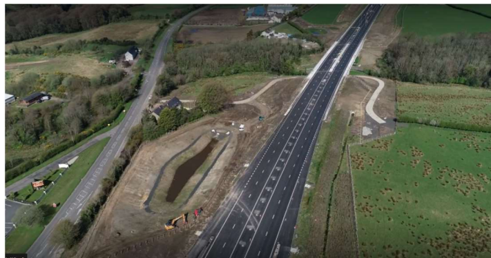
A6 Dual Carriageway at Liberty Glen

Further information on the works and traffic management is available on the scheme website at: https://a6d2d.com/