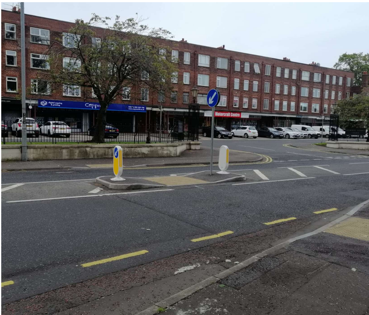
A2 Shore Road, Merville Garden Village.

A pedestrian Island has been provided on the A2 Shore Road at Merville Garden Village, Whitehouse. This measure will assist pedestrians crossing from Whitehouse to the bus stop at the Southern side of the A2, while also providing some protection to right turning vehicles into the development.