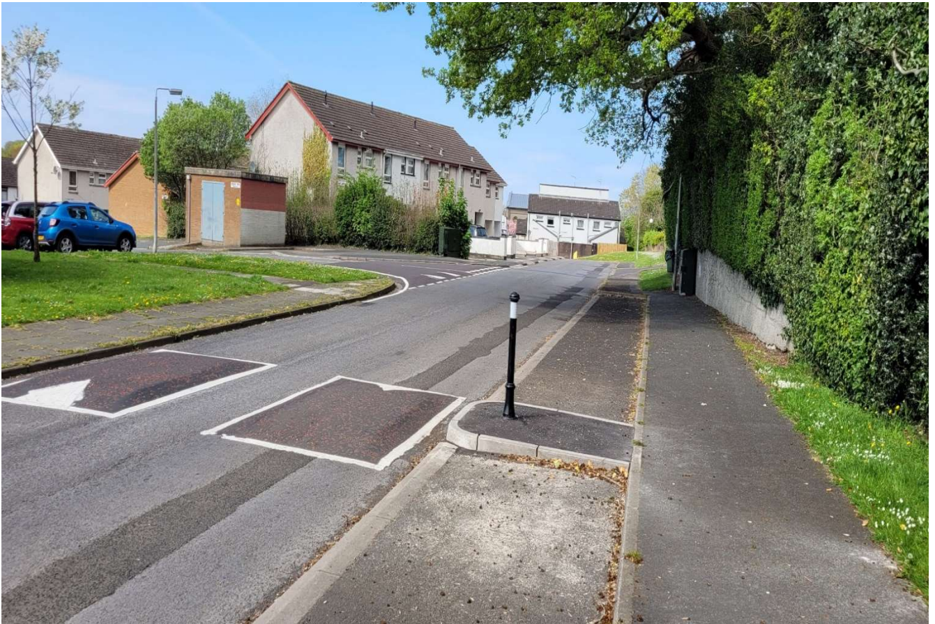
Fennel Road, Antrim

A Traffic Calming scheme on Fennel Road in Antrim is now complete. These measures will reduce vehicle speeds and improve the road safety, particularly for vulnerable road users, in the vicinity of the Riverside School and Clanmill care home.