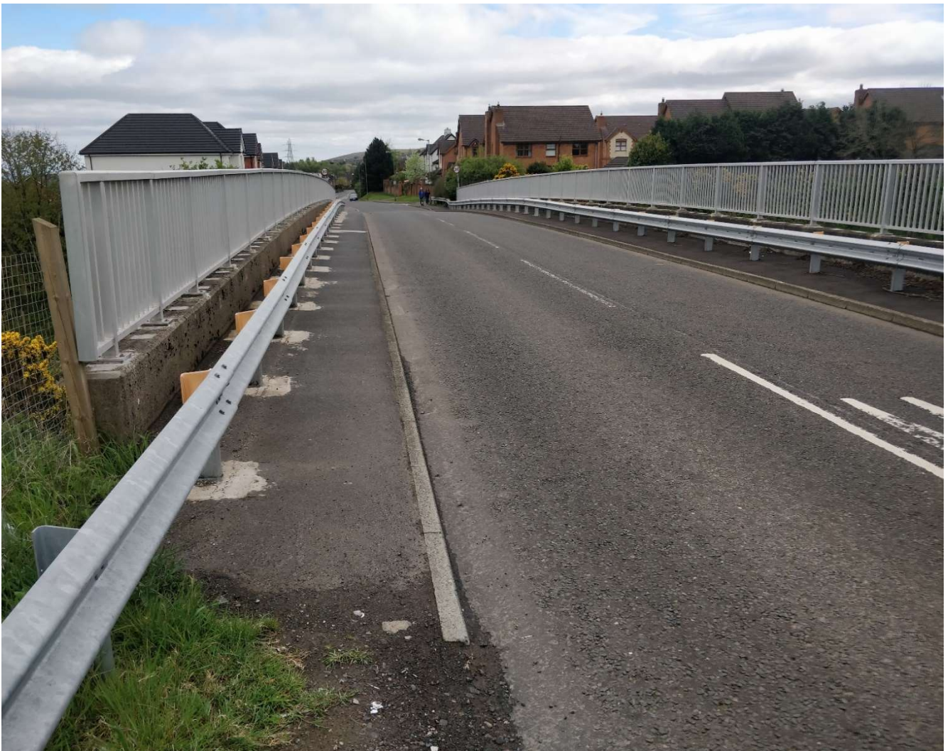
Ballycraigy Bridge, Ballycraigy Road, Newtownabbey

Total Completed Maintenance of Structures at a cost of: £180,958