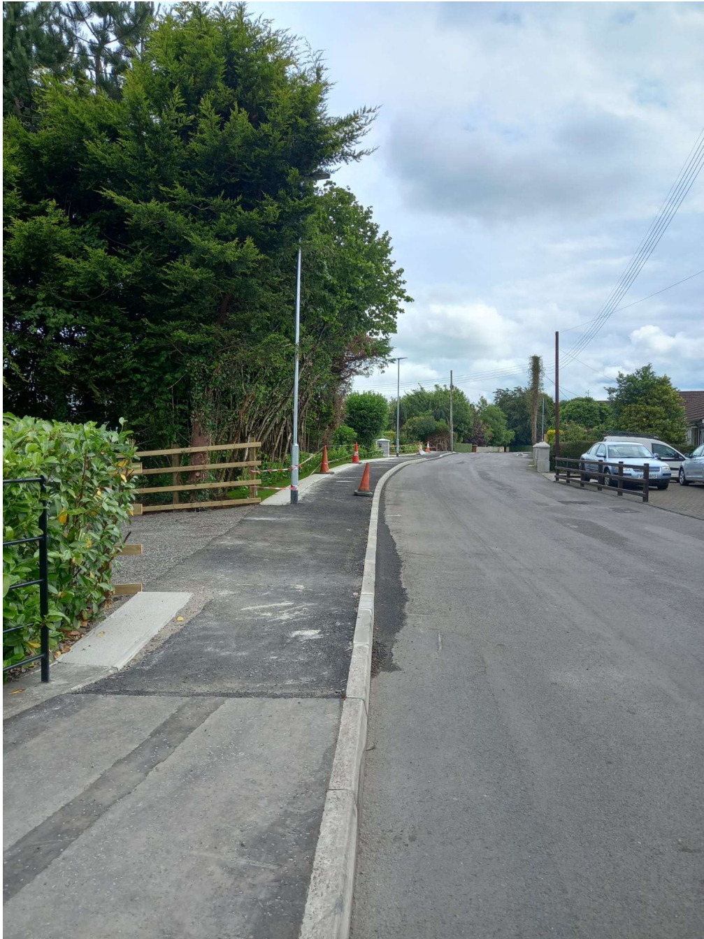
Gloverstown Road, Toome

The scheme provides 65 metres of footway between the existing footways at Toalstown Meadows and the newly constructed Glover's Lane. These works extend the existing footway provision and facilitate active travel in this area. A small footway link from the Gloverstown Road to the footway at the Toome bypass has also been provided.