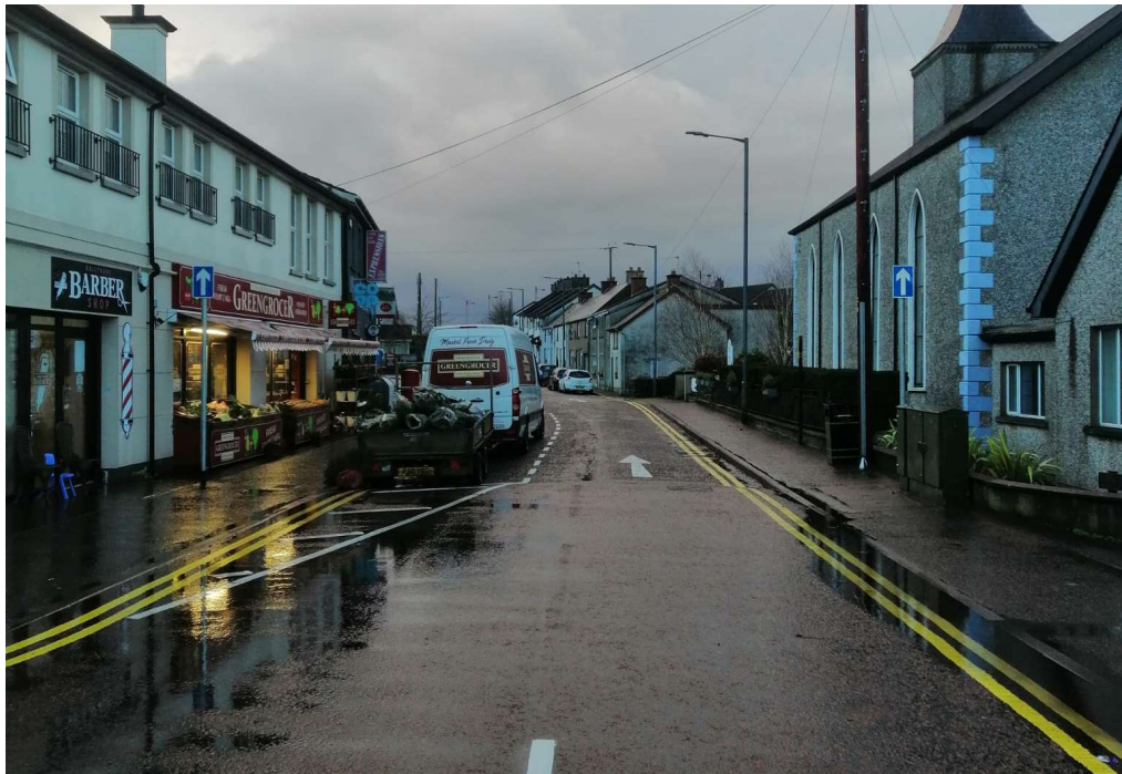
Main Street, Ballynure.

Following requests from local elected representatives, traders and residents a one-way system has been implemented on Main Street in Ballynure village from the Carrickfergus Road to the B58 Belfast Road. This scheme will improve traffic progression through the village, as well as formalising some of the on-street parking arrangements.