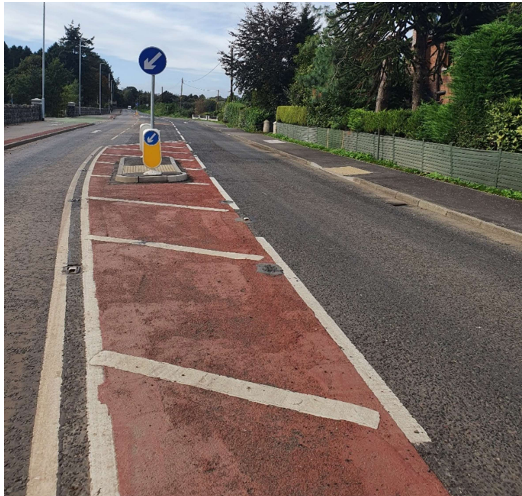
A6 Randalstown Road, Antrim.

A Traffic Management Scheme has been implemented on the A6 Randalstown Road as part of the road widening scheme at the entrance to the new caravan park at Clanaboy Lane and Umyr Park. This scheme consists of two new traffic islands, to improve lane discipline on the A6, and a short length of footway to improve pedestrian access into the town.