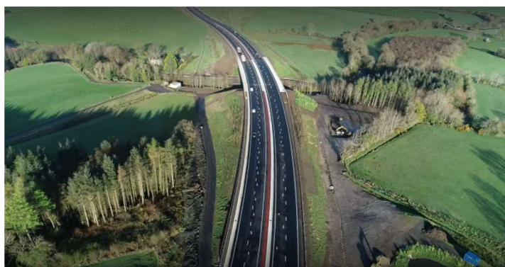
A6 Dual Carriageway over the River Roe.