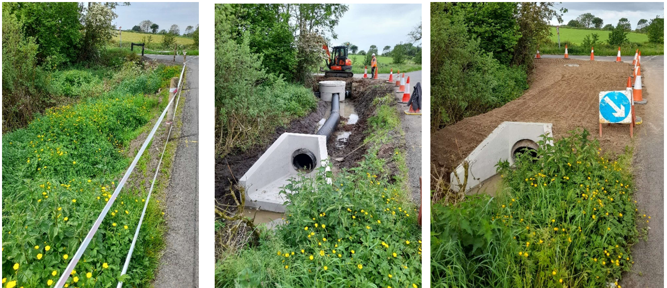
Verge and drain collapse before, during and after reconstruction