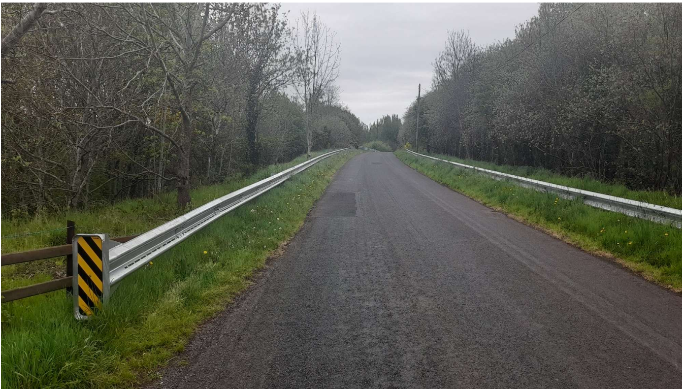
Carnanee Road, Templepatrick

Total Completed Road Restraint Systems Upgrade at a cost of: £31,190