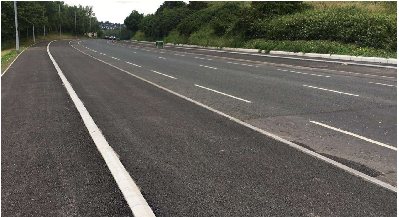
O'Neill Road, Dunanney, Newtownabbey

The scheme provides a footway/cycleway either side of the carriageway from O'Neill Road Roundabout to connect with the footway/cycleway completed during the previous financial year. These works have upgraded the provision between Doagh Road and Church Road.