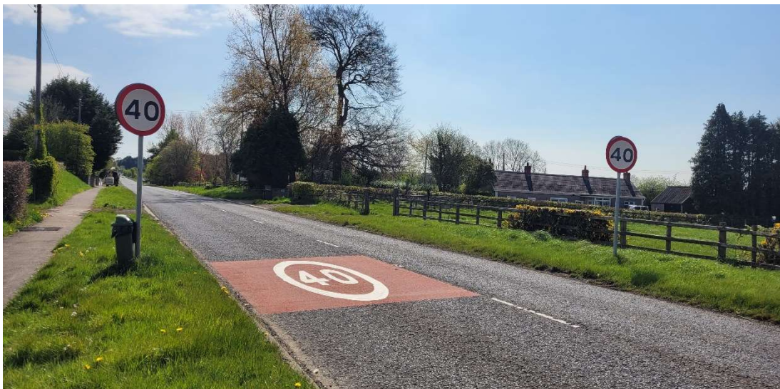
Seven Mile Straight, Loanends

Church Road, Moneyrod Road and Ballydumaul Road, Randalstown - Refreshing of warning line and 'SLOW' markings on High Friction Surface patch and 'STOP' road markings;