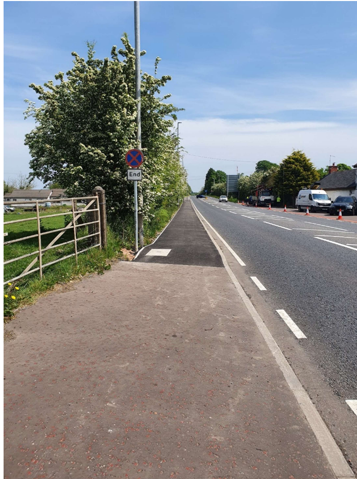
Completed Scheme - A57 Ballyclare Road, Templepatrick.

A short length of footway (95m) has been provided on the A57 Ballyclare Road in Templepatrick, West of the Old Ballyclare Road.