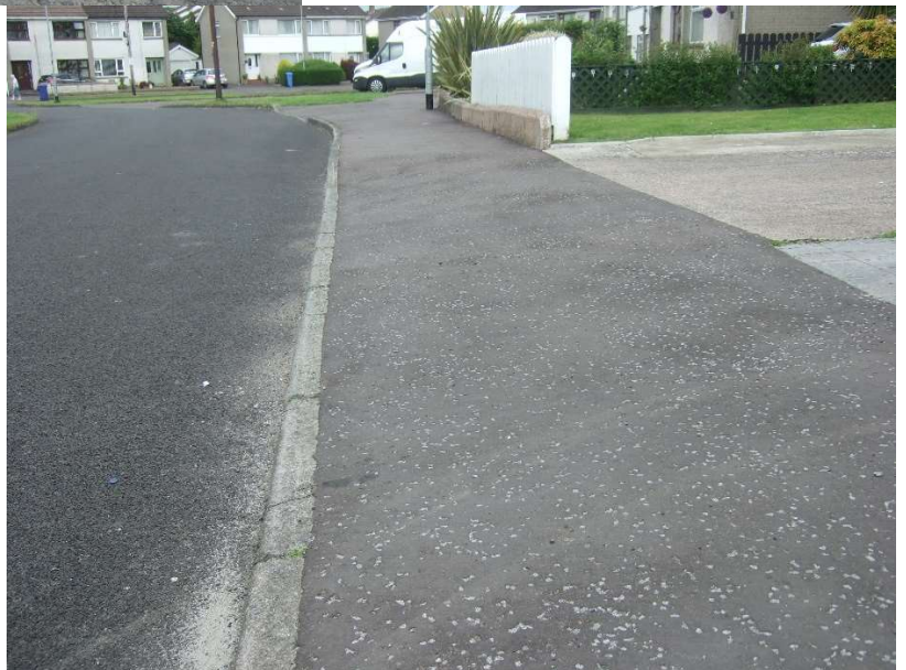
Completed Scheme - Beechmount Park