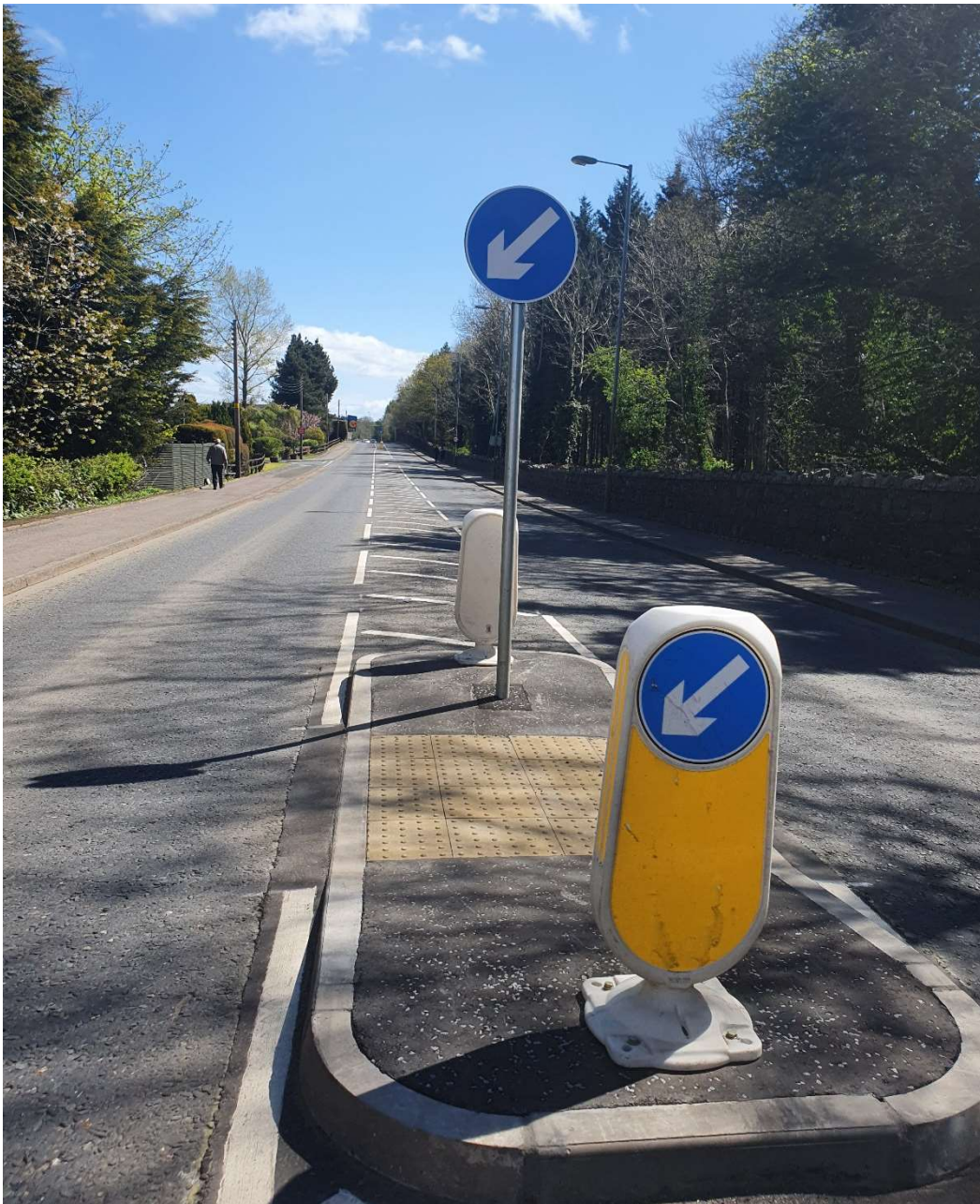
Traffic Islands, Castle Road. Randalstown.

A scheme to improve pedestrian connectivity and road safety has been provided on the Castle Road in Randalstown. The scheme involved the provision of 4 pedestrian islands between Castle Lodge and Station Road as well as a series of right turning pockets and hatching. This scheme will assist pedestrians crossing Castle Road, and also act as a traffic calming feature.