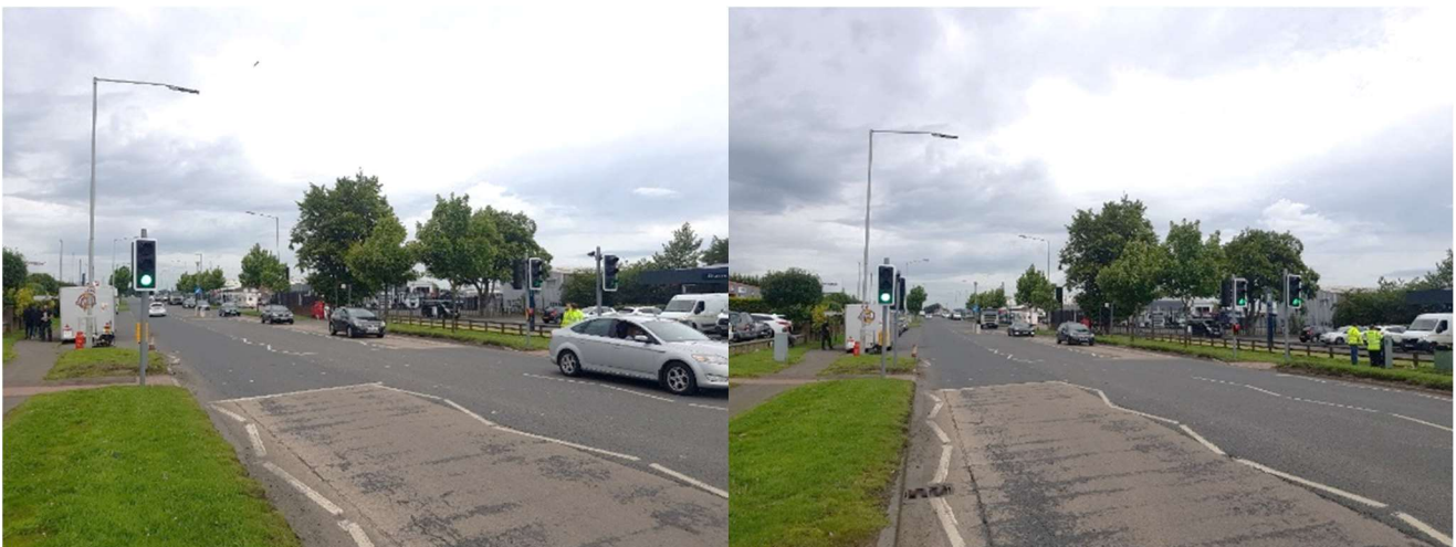
Mallusk Road - Completed scheme

The pedestrian crossing on the Mallusk Road at the Danske Bank has been upgraded to a Puffin crossing. The existing Pelican crossing was one of the older sites on the network and was due for replacement. The new Puffin crossing incorporates the latest traffic signal technology with sensors on the pole tops. If it detects that pedestrians are crossing slowly the controller can extend the 'green man' for a longer period to allow the crossing movement to be completed safely. The technology also detects if a pedestrian demand is no longer required as the user has either already crossed or walked away, and cancels the request, making the operation of the crossing more efficient for all road users.