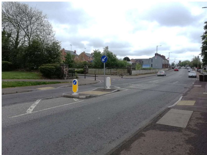
Traffic Islands, Doagh Road, Ballyclare.