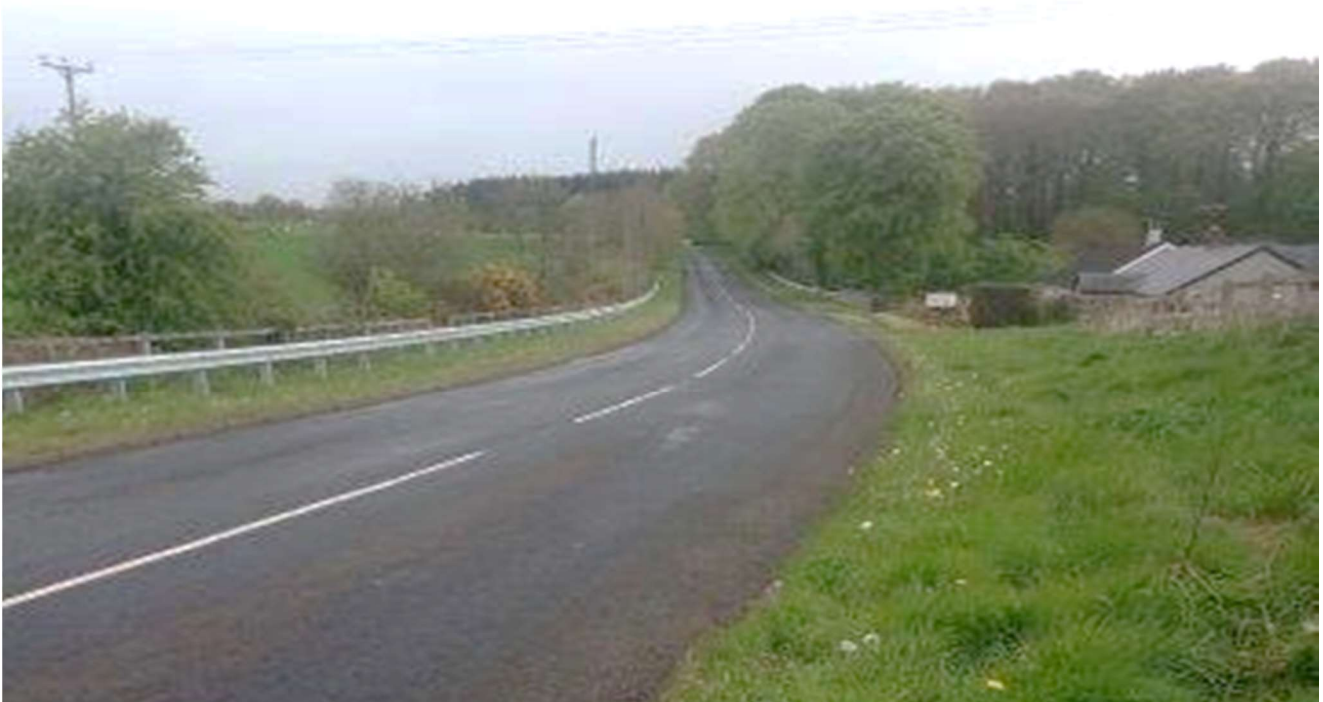
Completed Scheme – Steeple Road VRS Upgrade

Total cost of completed Road Restraint Systems upgrade work - £203,295