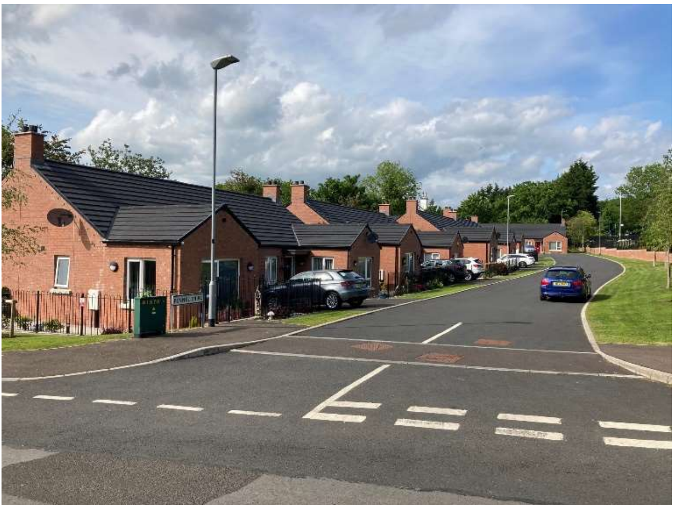
Fennel Road, Antrim.