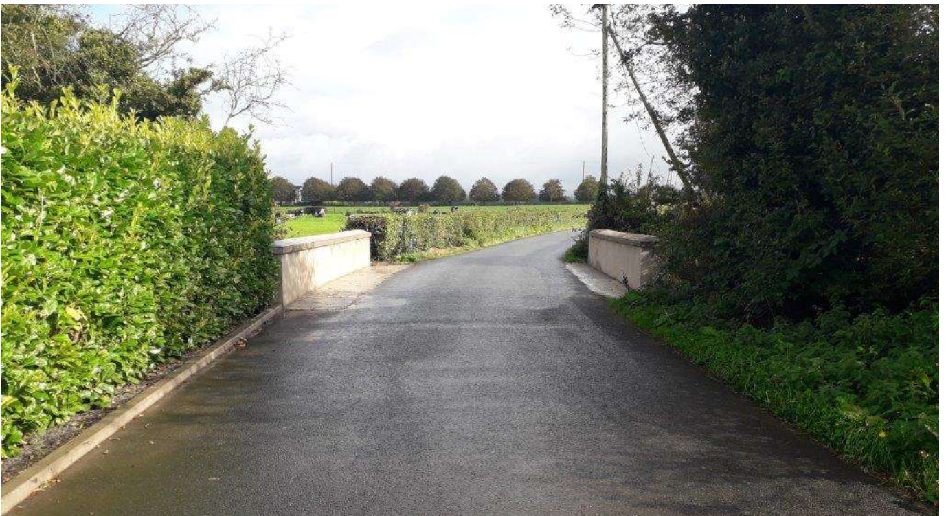
Completed Scheme - Ballynamullan Bridge parapet repairs.

Total cost of completed Maintenance of Structures - £104,849