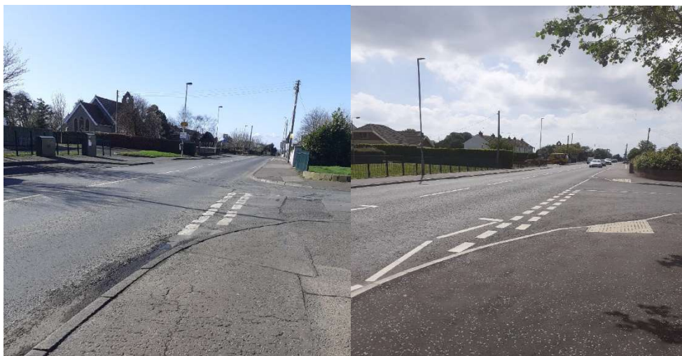
Main Street, Crumlin (Before resurfacing)