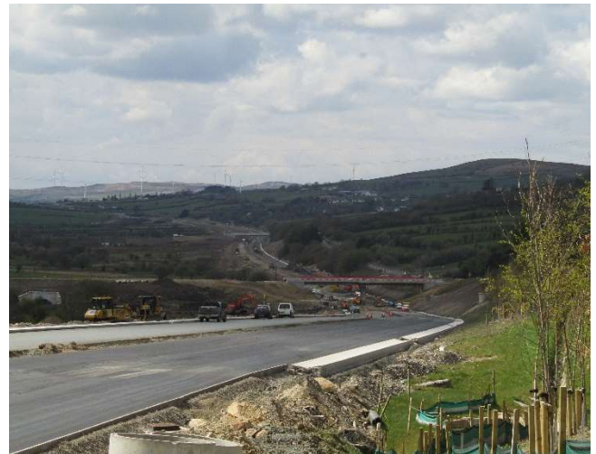
Construction of dual carriageway at Ballyhanedin.