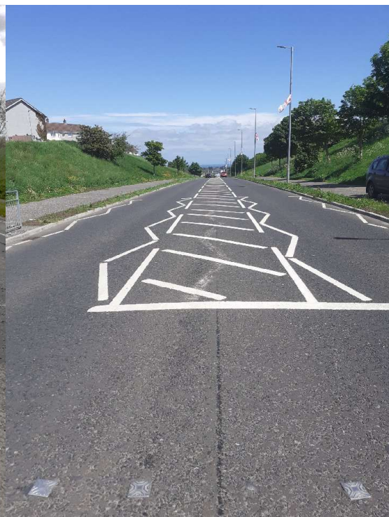
O'Neill Road, Newtownabbey (After Resurfacing)