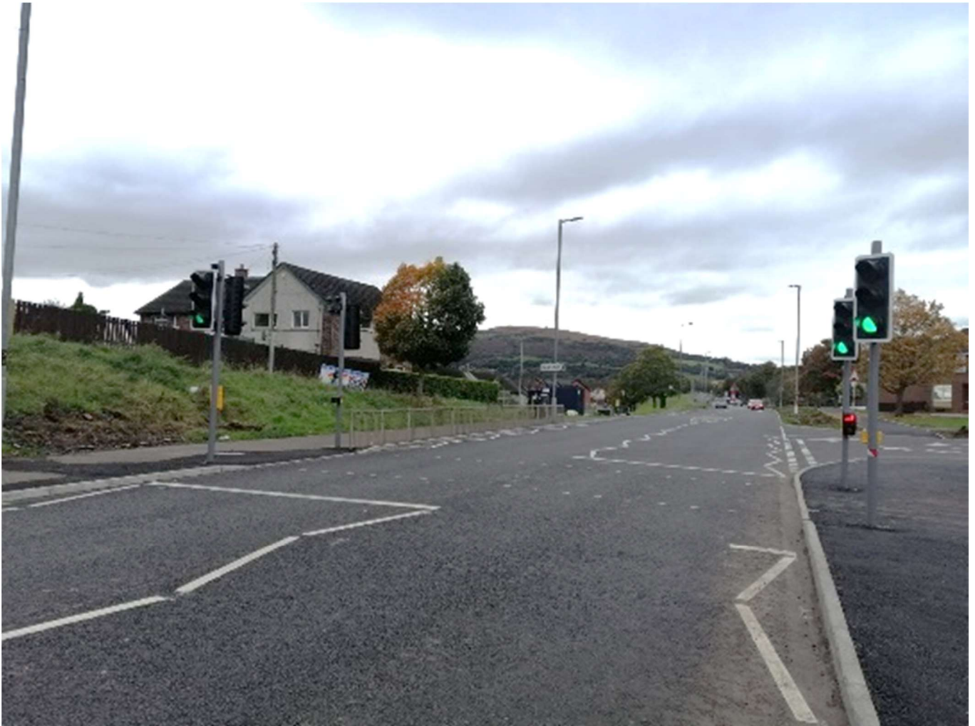
Completed scheme - O'Neill Road

Work is now complete to upgrade the O'Neill Road pedestrian crossing to a Toucan Crossing. This work is being completed as part of the resurfacing scheme on O'Neill Road and provides a controlled crossing for both pedestrians and cyclists.