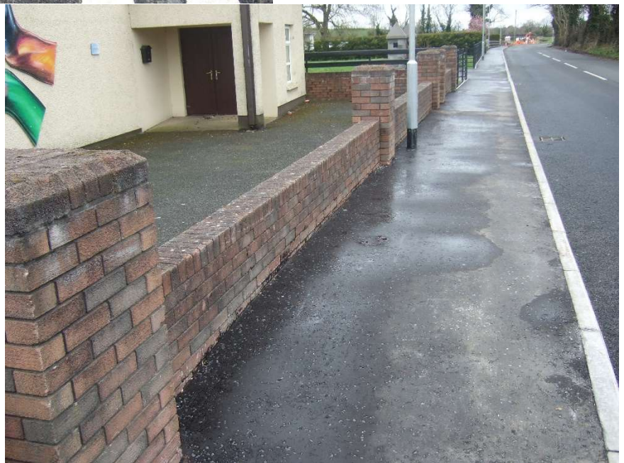
Completed Scheme – Loughbeg Road