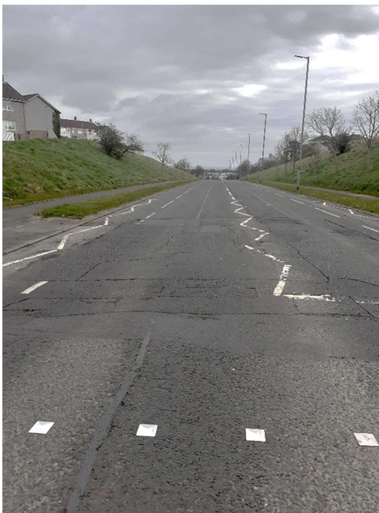
O'Neill Road, Newtownabbey (Before Resurfacing)