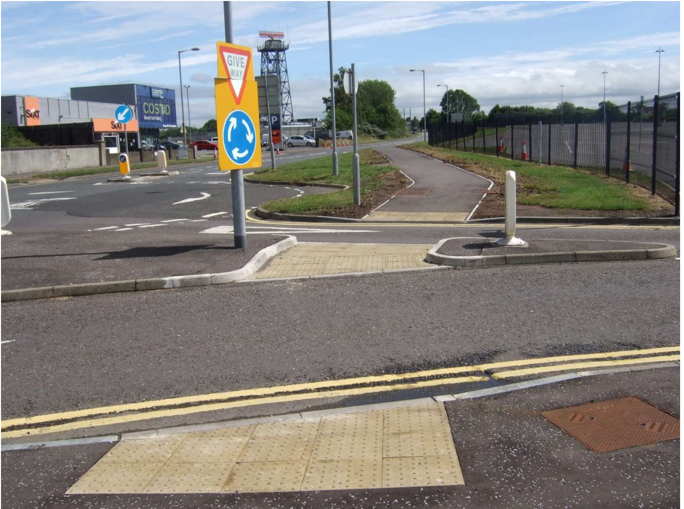
Airport Road - Completed Scheme

This scheme addresses a missing link on Airport Road, from the existing footway on the exit road from the Airport 'drop off' area to the footway at the Filling Station.