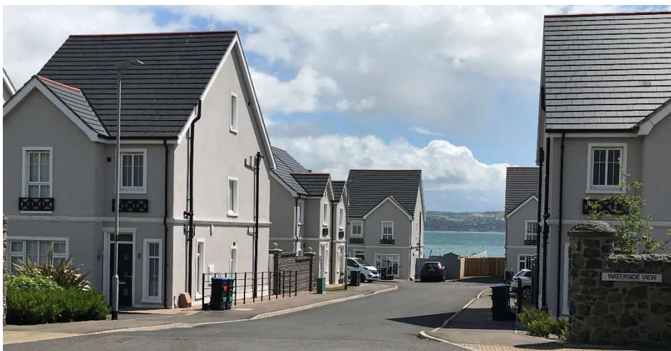
Waterside View, Jordanstown