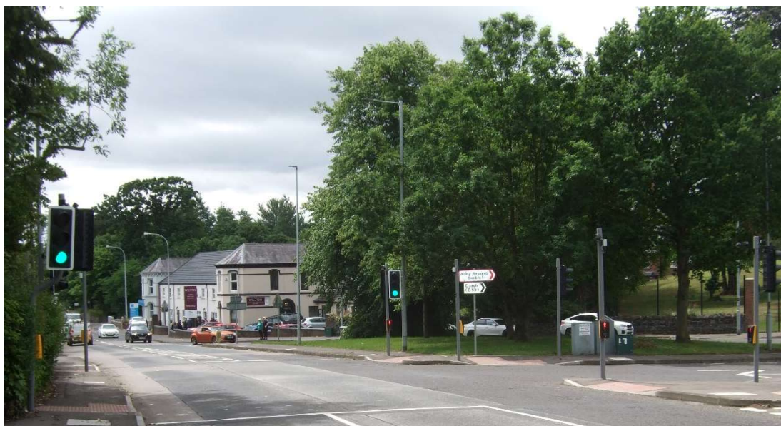
Shore Road / Doagh Road - Completed Scheme