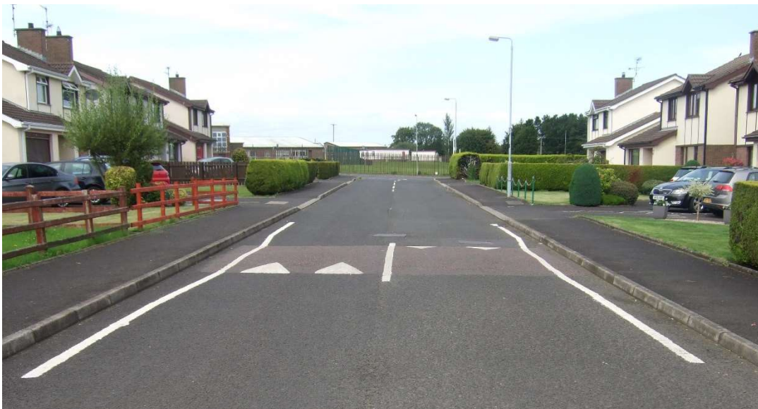
Castle Avenue - Completed scheme