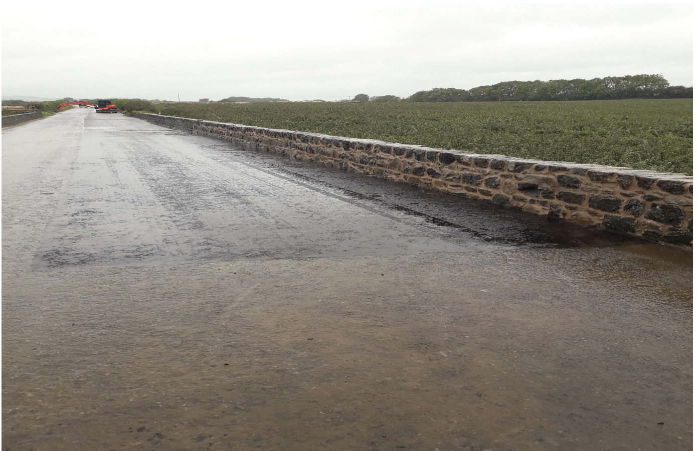
Completed Scheme - Bessy Gras Bridge, Doagh