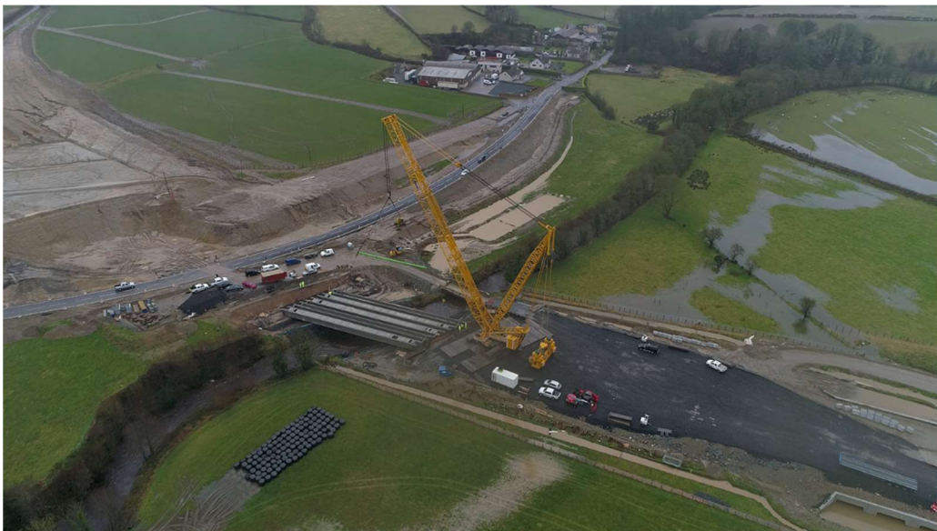
Beams being installed on the Owenrigh River Bridge

For further information on the works and Traffic Management is on the scheme website at: https://a6d2d.com/