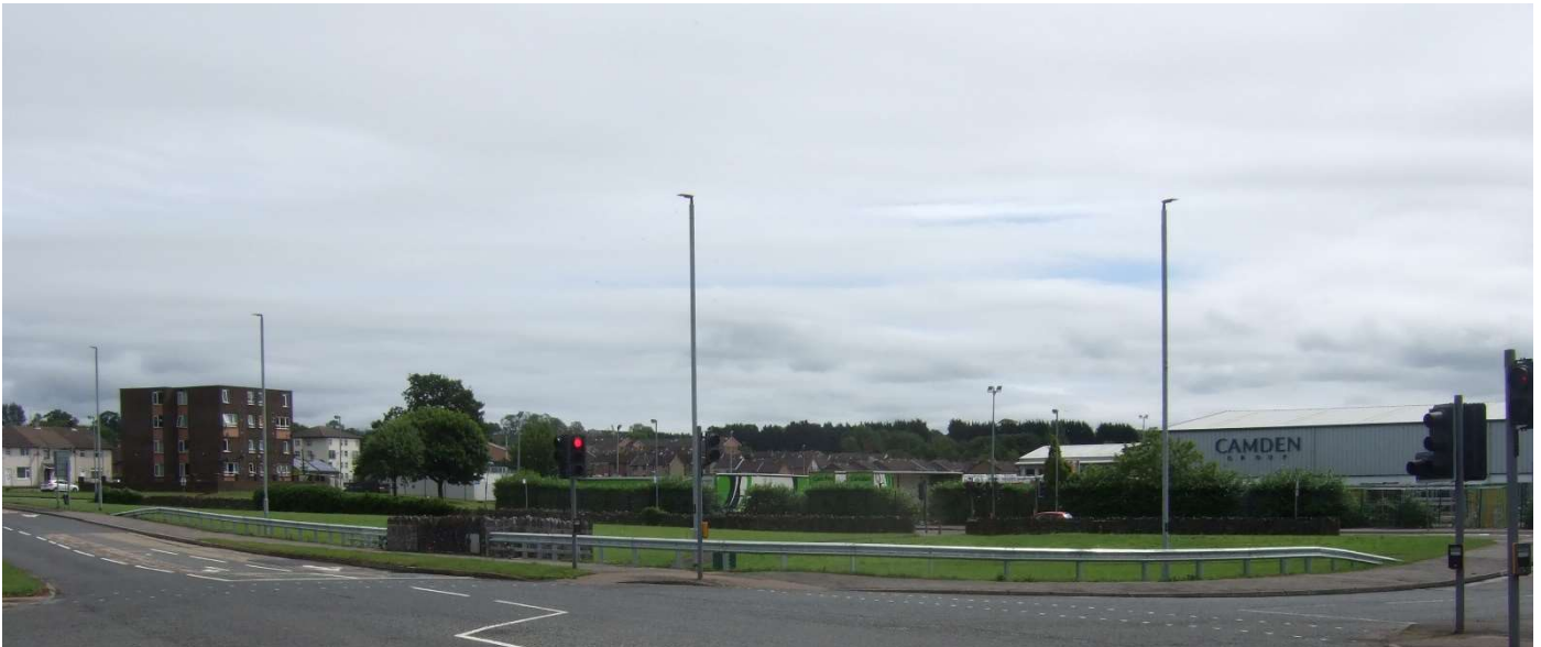
Steeple Road - Completed Scheme

Completed Road Restraint Systems Upgraded at a total cost of £28,451