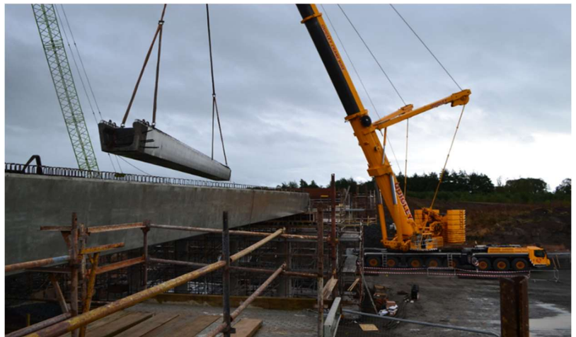
Final beam lift at Hillhead junction overbridge

Works continue on the Hillhead and Deerpark compact grade-separated junctions and it is planned that traffic will be using these later this year. The laying of bituminous roadbase and binder along these stretches has also commenced. Construction works recommenced on the 18 March 2020 within the sensitive swan area between the Toome Bypass and Deerpark Road.