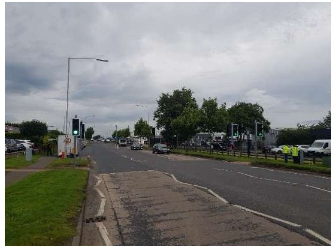
Mallusk Road - Completed scheme