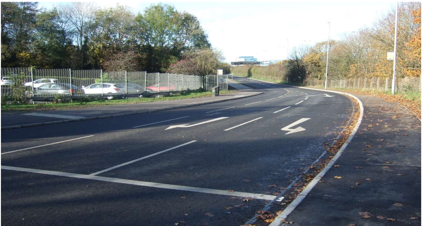
Mallusk Road - Completed scheme