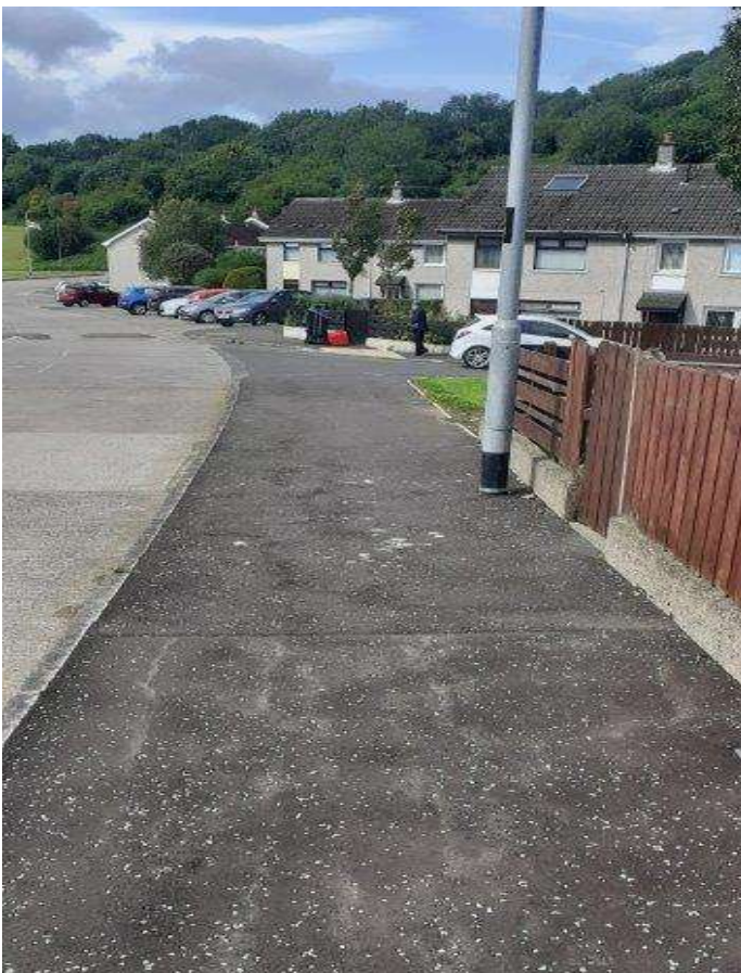
Tulleevin Estate - Completed scheme