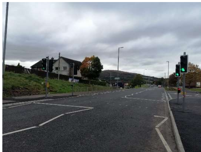
O'Neill Road – On-going scheme

Work is almost complete to upgrade the O'Neill Road pedestrian crossing to a Toucan Crossing. This work is being completed as part of the ongoing resurfacing scheme on O'Neill Road and will provide a controlled crossing for pedestrians and cyclists.