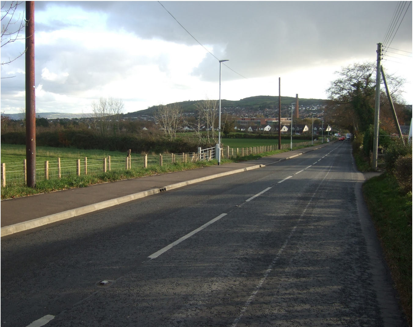
Carntall Road - Completed Scheme

This scheme provides a footway link on Carntall Road from existing housing to the Doagh Road junction. No existing verge width was available for the provision of the footway, so land was acquired for the proposed footway with a new hedge planted to the rear. The existing street lighting was also upgraded as part of the scheme.