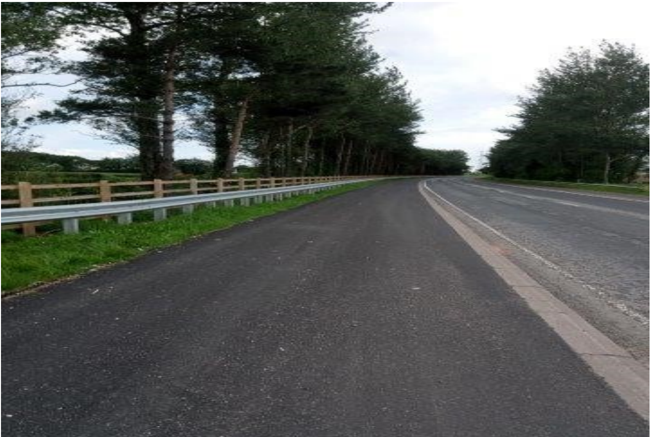
Ballyutoag Road, Crumlin

Completed Road Restraint Systems Upgraded at a total cost of £167,419