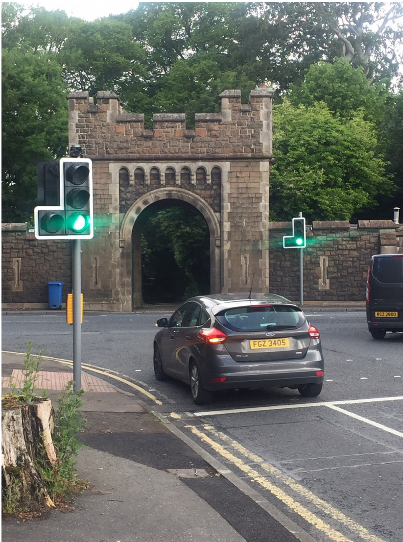
Traffic Signal Upgrade, Templepatrick village.

Works to upgrade the existing traffic signal installation at Antrim Road/The Village junction in Templepatrick are now complete. The scheme included an upgrade of the existing controller and utilises MOVA (Microprocessor Optimised Vehicle Actuation) the latest traffic signal technology, which is designed to optimise traffic flow to help improve traffic progression and reduce delays through the junction. The scheme also included replacement of the signal heads and poles, as well as providing a left turn filter from the village towards Antrim to help traffic flow. An audible device will assist with pedestrian movement for the visually impaired.