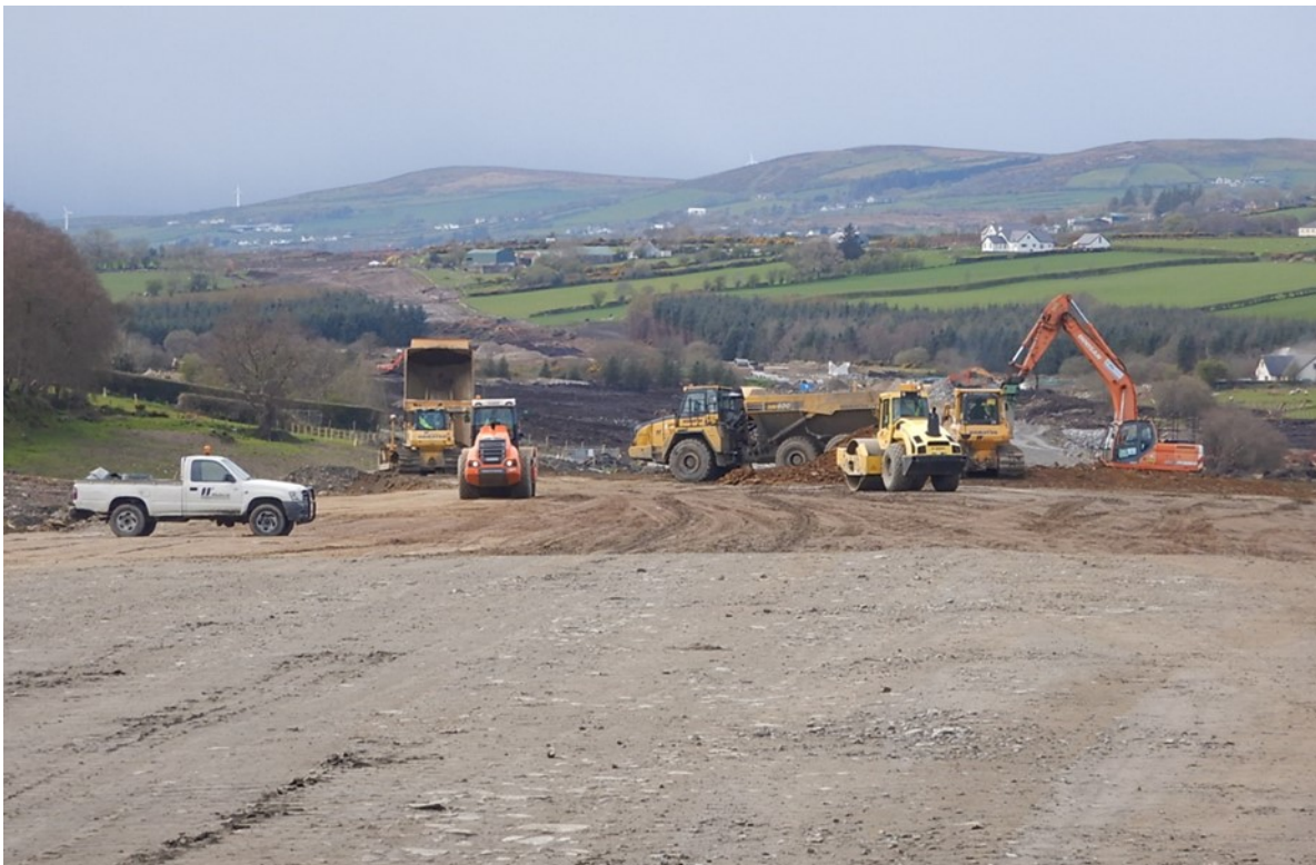
Construction works at Foreglen

It is anticipated over the next few months, the earthworks operations will continue with the benefit of the longer working days and the construction of further mainline structures will get underway. Construction is expected to be completed by spring 2022.