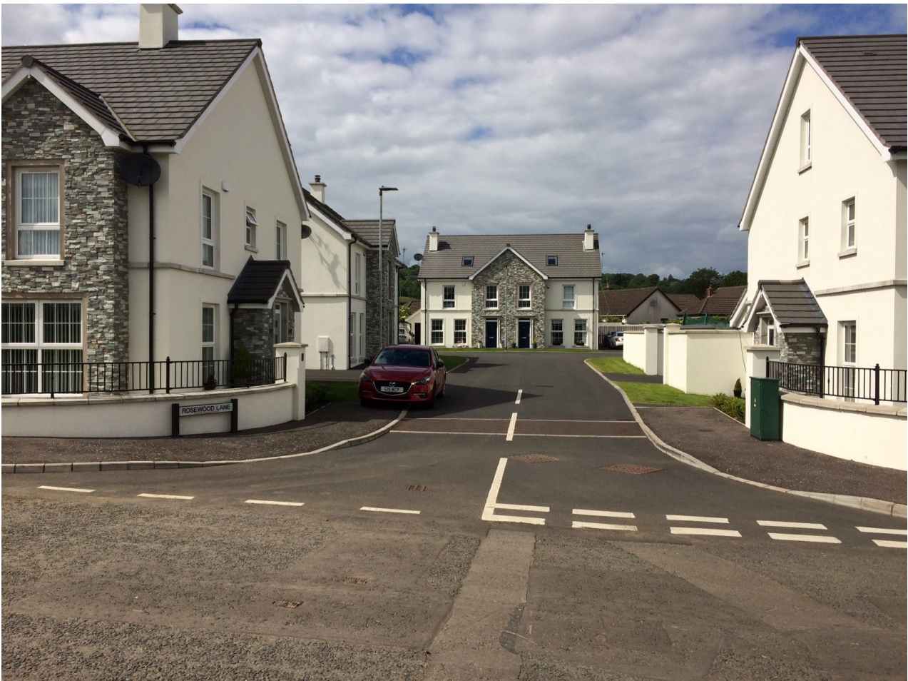
Rosewood Lane, Parkgate