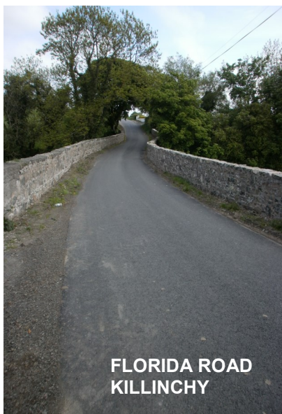
FLORIDA ROAD KILLINCHY