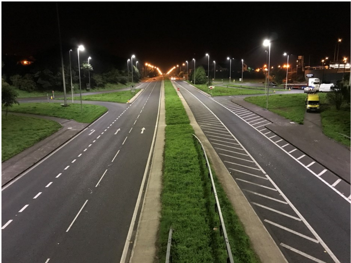
A2 Bangor– Belfast Road Relighting Scheme