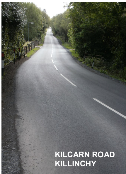
KILCARN ROAD KILLINCHY