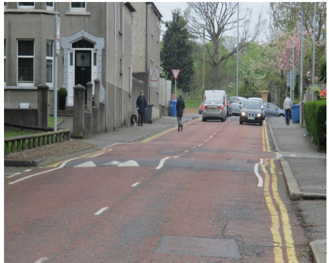
Provision of vertical deflection measures (road humps)