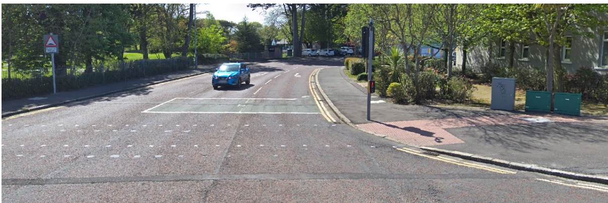
Upgrade of traffic signal junction