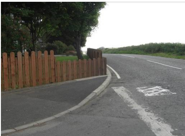
Existing view from Bailie Terrace

The provision of a footway / sightline improvement at the junction of A48 Newtownards Road at Bailie Terrace will require the acquisition of land . Negotiations with the landowner failed to reach agreement and the scheme will be reviewed with the option for vesting to be considered.