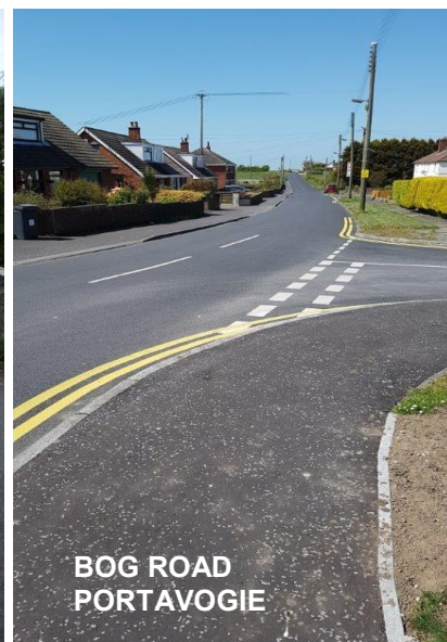
BOG ROAD PORTAVOGIE