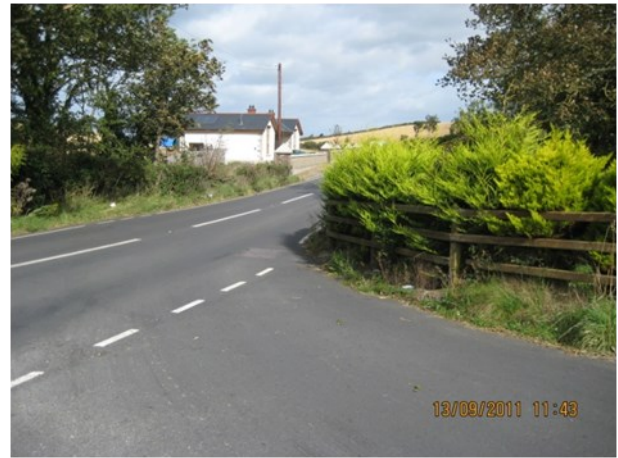
Photographs showing existing junction