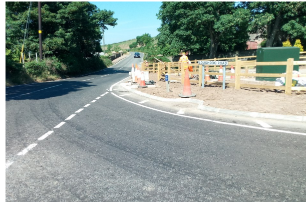
Photographs showing completed scheme