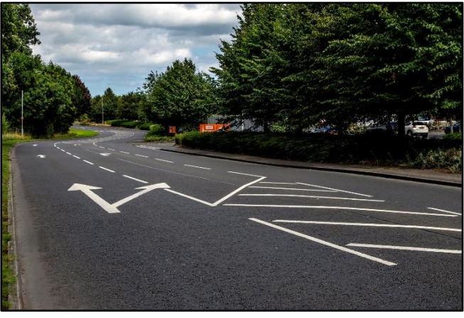
Airport Road West, Holywood