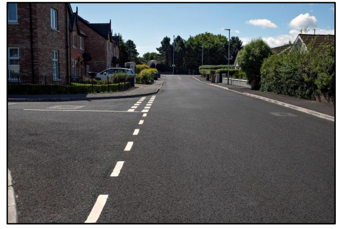
Cotswold Drive, Bangor