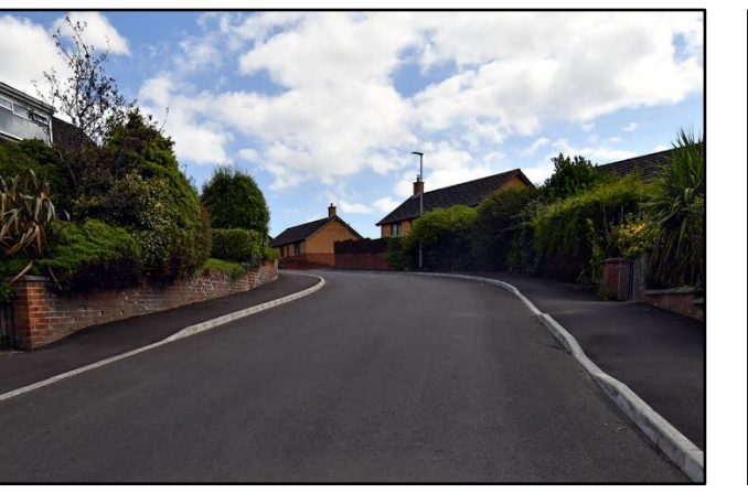
Culmore Avenue, Newtownards