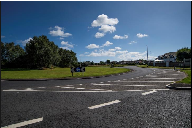
Groomsport Road Roundabout, Groomsport