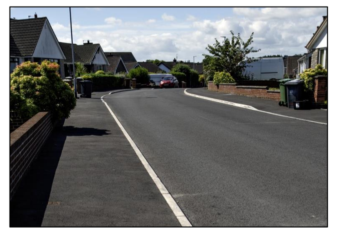
Cotswold Gardens, Bangor