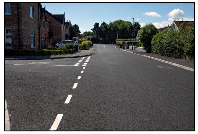
Cotswold Drive, Bangor