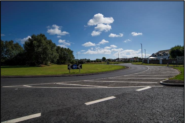
Groomsport Road Roundabout, Groomsport