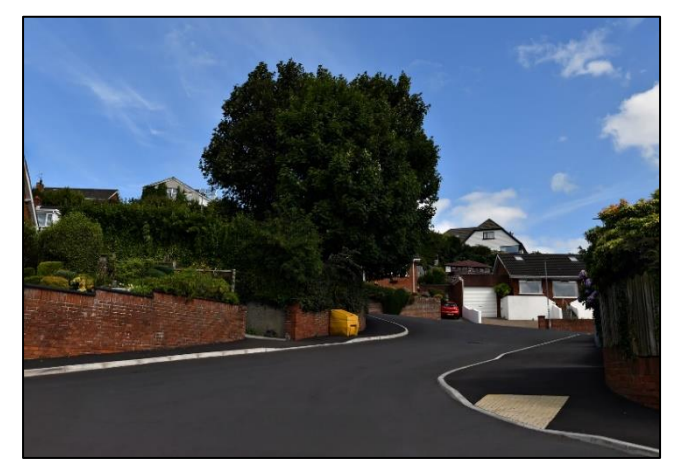
Slieve Croob, Newtownards