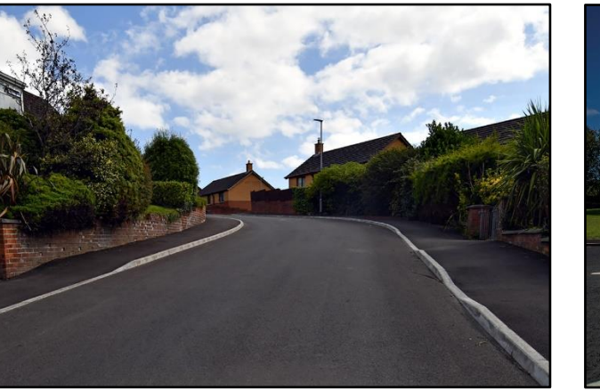
Culmore Avenue, Newtownards