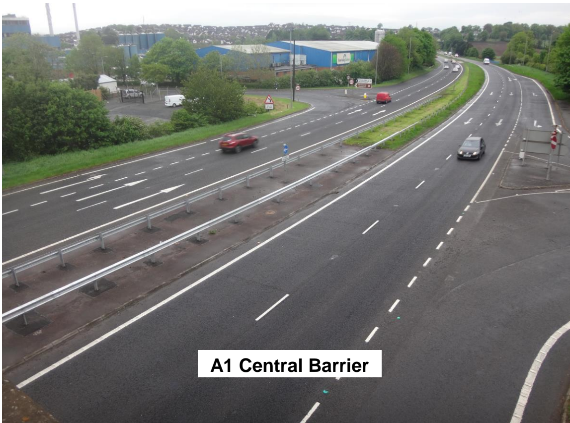
A1 Central Barrier