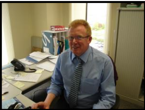
Neville Dynes Strategic Road Improvements Marlborough House Central Way Craigavon BT641AD

Tel: 0300 200 7892 Southern.SRI@infrastructure-ni.gov.uk