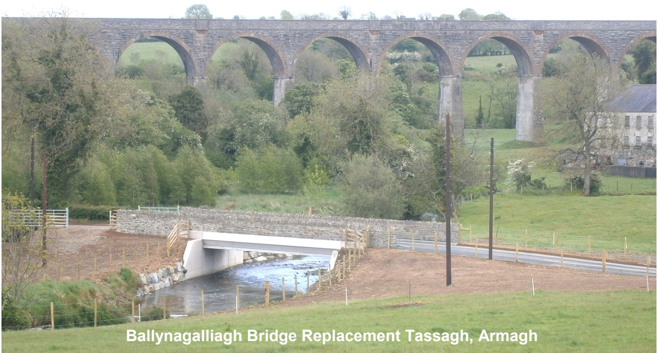
Ballynagalliagh Bridge Replacement Tassagh, Armagh