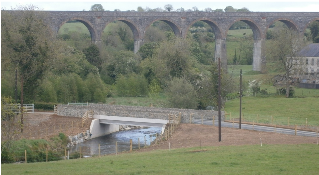
New Bridge following construction

Other structures strengthened during the period -