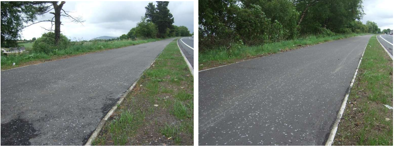
Foreglen Road, Ovil, Dungiven – Completed scheme.

The scheme provides a further 640 metres of shared footway and cycleway on the existing hard shoulder along this section of Foreglen Road. These works extend the existing provision of shared footways and cycleways along Foreglen Road and facilitate active travel in this area.