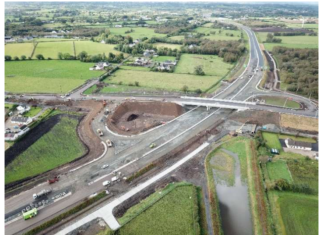
Aerial view looking west – Deerpark Road Junction

The Infrastructure Minister Nichola Mallon visited the site on Friday 28 May 2021 to speak to those involved in the delivery of the scheme. This was just in advance of the removal of Temporary Traffic Management and 40mph speed restriction, allowing the entire dual carriageway to open on Monday 31 May 2021. A great achievement for everyone involved in the delivery of such a major infrastructure project.