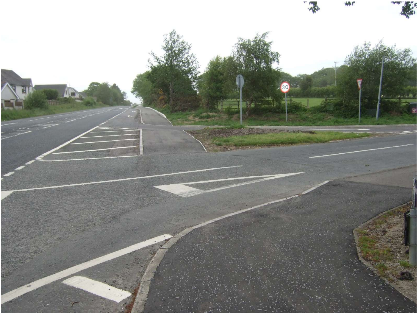
Foreglen Road, Dernaflaw - Completed scheme May 2020

The scheme provided 980 metres of shared footway and cycleway on the existing hard shoulder along this section of Foreglen Road. These works have extended the existing provision of footways and cycleways at Dernaflaw and will facilitate active travel in this area.