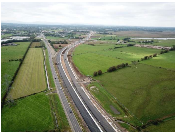
Aerial view looking west – Toome Bypass tie-in

Over the winter months works continued on the mainline with the main construction activities concentrated on the west bound carriageway tie-in to the existing Toome Bypass, other local network connections at Hillhead junction and B18 Creagh and subsequent removal of the contraflow arrangement on the Toome Bypass.