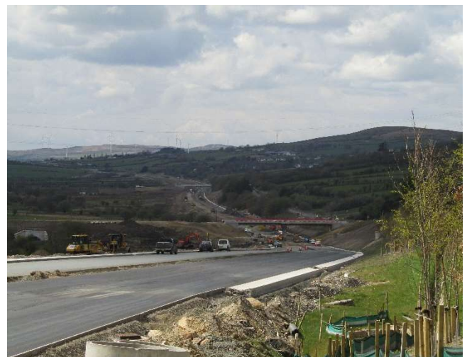
Construction of dual carriageway at Ballyhanedin.