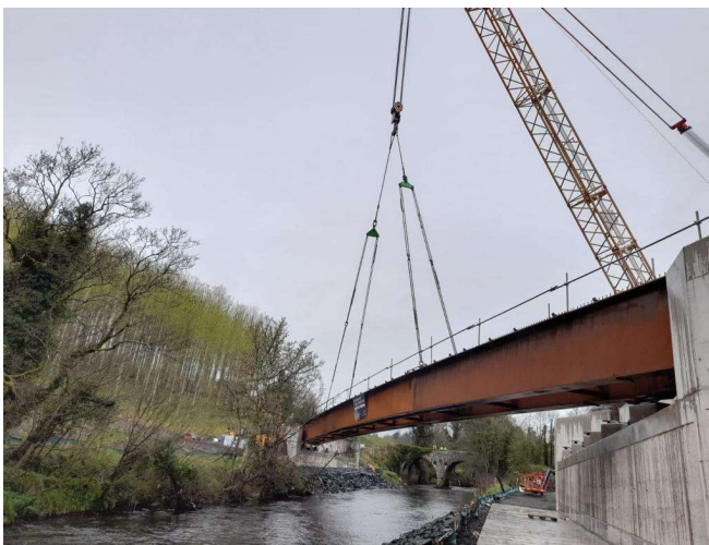
Beams being lifted in place for the Ardmore Road bridge.

Further information on the works and traffic management is available on the scheme website at: https://a6d2d.com/