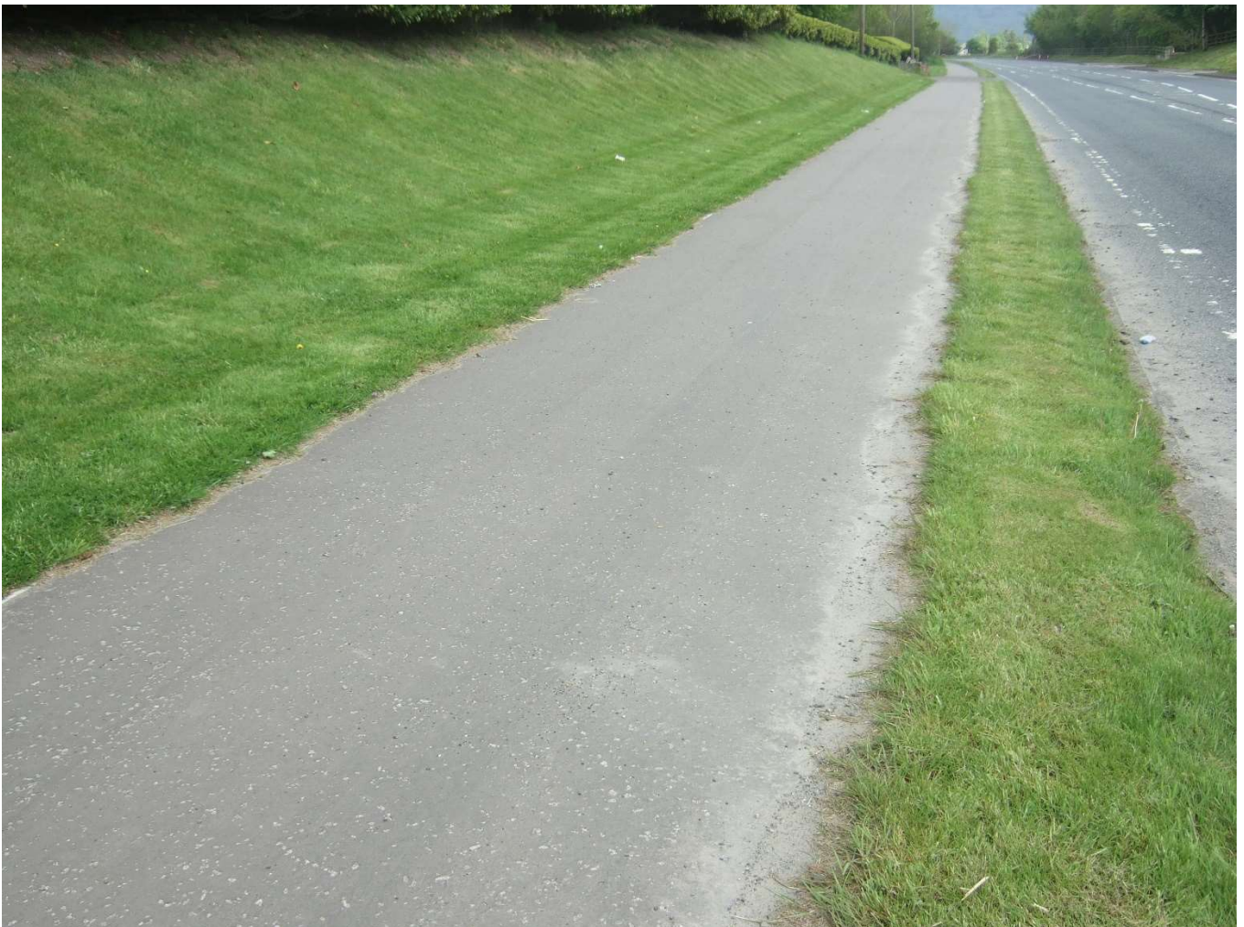
Foreglen Road, Owenbeg - Completed scheme May 2020

This scheme upgraded 300 metres of existing footway opposite the Owenbeg GAA facility to a shared footway and cycleway. It also provided an upgrade of a further 185 metres of existing footway adjacent to the Filling Station, opposite the junction of Feeny Road, to a shared footway cycleway. The completion of these sections provides active travel facilities on Foreglen Road from the junction with Feeny Road to the junction with Derrychrier Road, a distance of approximately 2.5km (1.5miles).