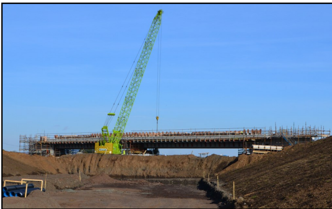
Construction of Derrygowan bridge

Drone footage of progress is available on https://www.youtube.com/channel/UC7qq4Hmth9zxz3gTxA4D2RQ . Visit https://www.infrastructure-ni.gov.uk/topics/road-improvements/a6-randalstown-castledawson-dualling-scheme to find out more about the scheme.