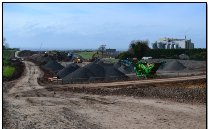
Local material processing site east of Ballynafey Road