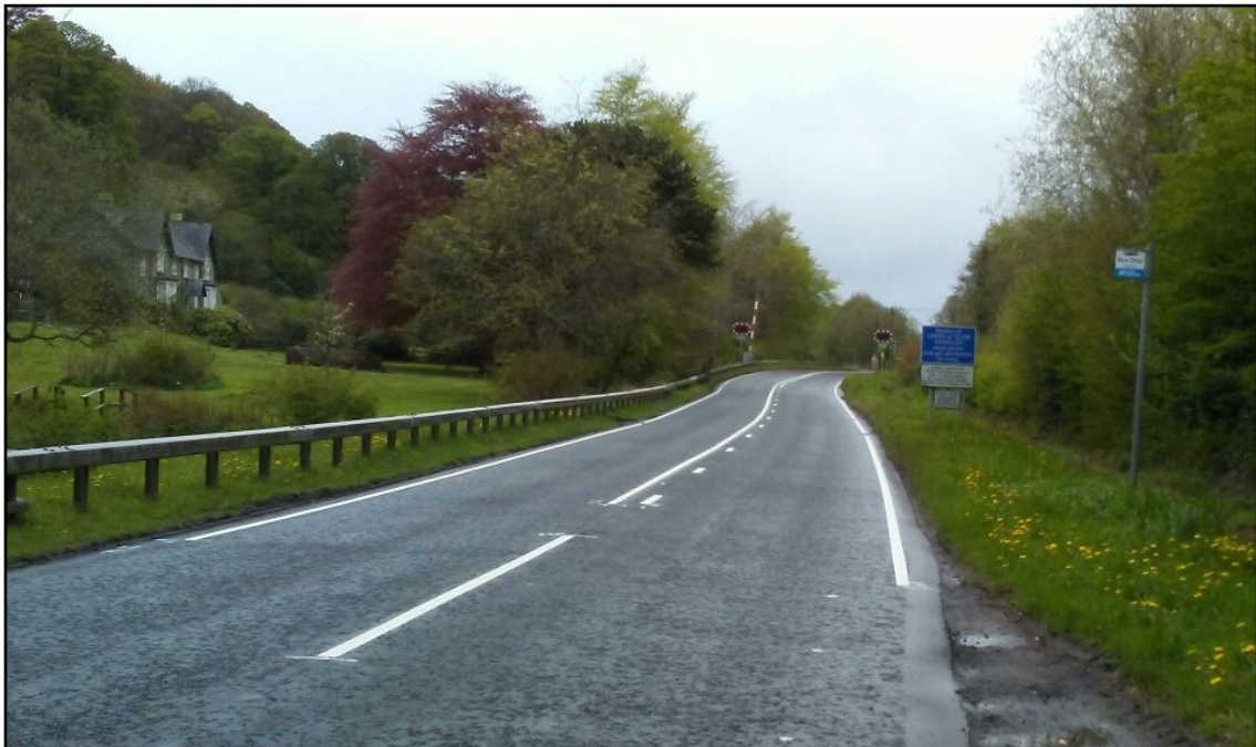
A2 Seacoast Road Downhill approaching Umbra Level Crossing