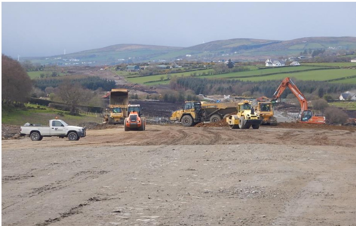
Photo: Construction works at Foreglen