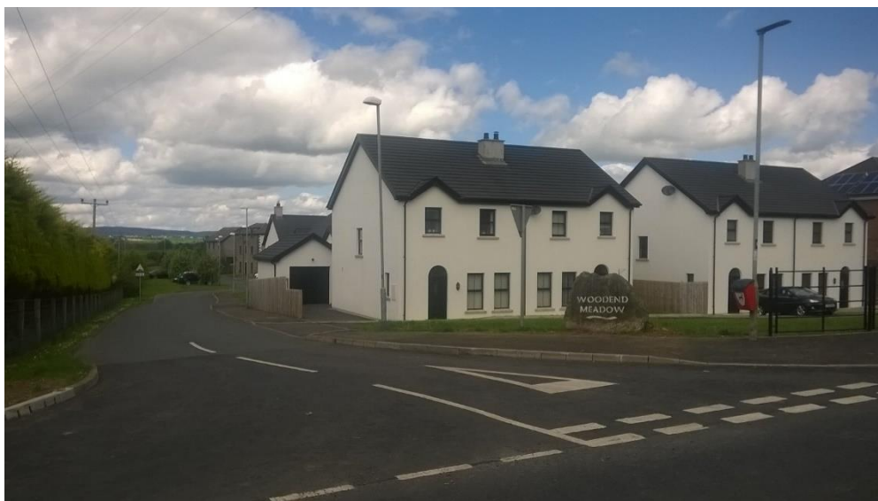
Recently Adopted, Woodend Meadow