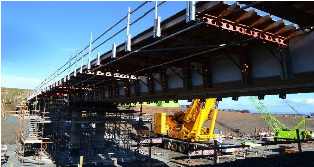
Construction of an accommodation bridge