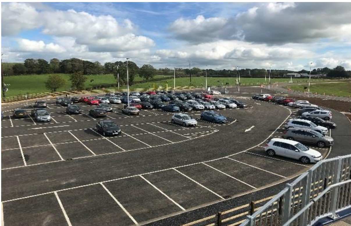
Drumderg Park & Ride complete