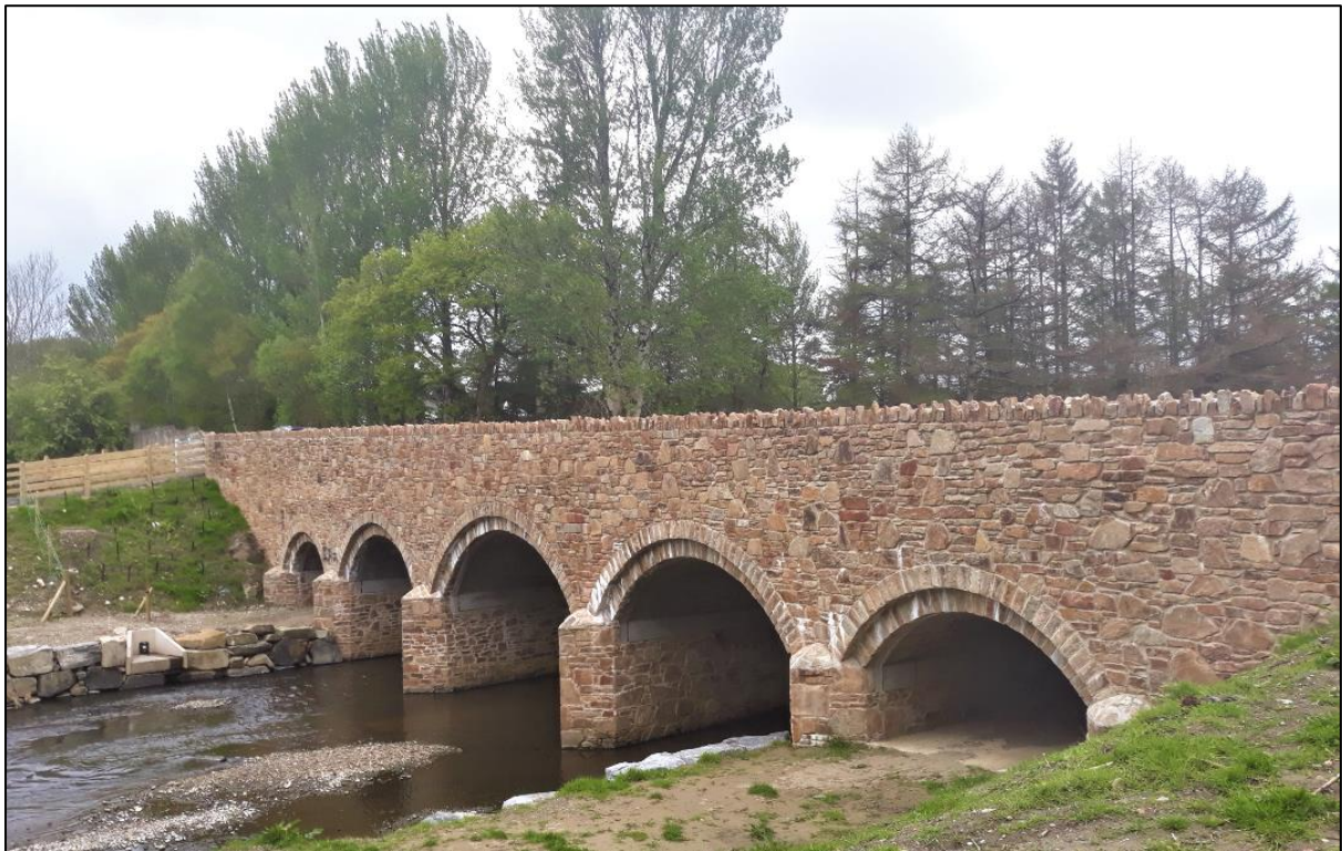
Ballynameen Bridge, Claudy, Reconstruction and widening.

The following bridge works were carried out within the Derry City and Strabane District Council area, representing an investment of £340k in the local infrastructure. The types of work carried out include flood damage repairs, general maintenance, repairs due to vehicle impact damage, bridge strengthening and bridge replacements.