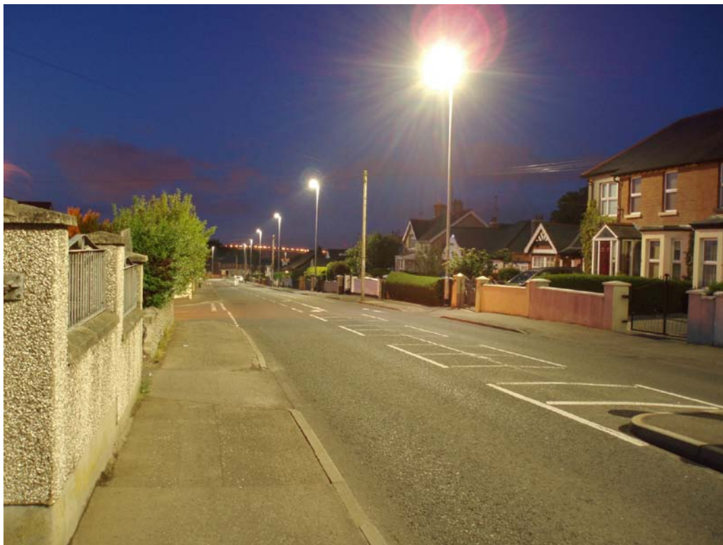
Glen Road, Londonderry