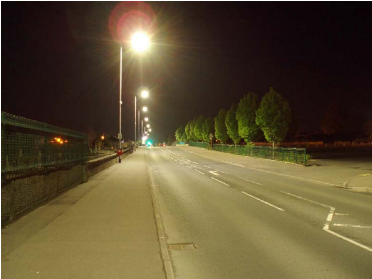
Melmount Road, Strabane

Particular mention should be made of the work carried out at Linsfort Drive, Ringford Road, Londonderry, Lisnaragh Road, Dunnamanagh and Fyfin Road, Victoria Bridge where an increase in funding near year end allowed commencement/completion of renewal schemes in these areas.