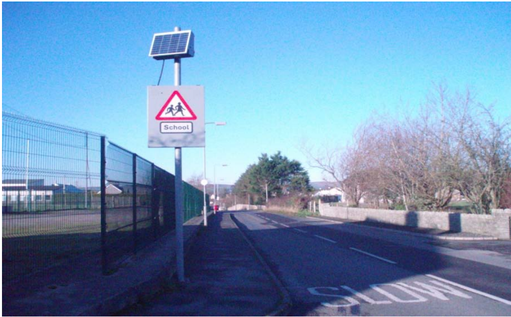
St Patrick's PS Donemana