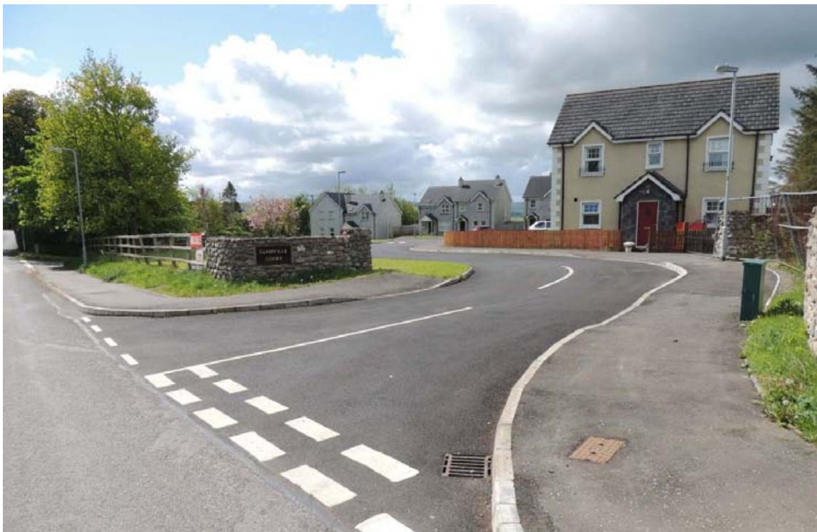
Sandville Court, Londonderry