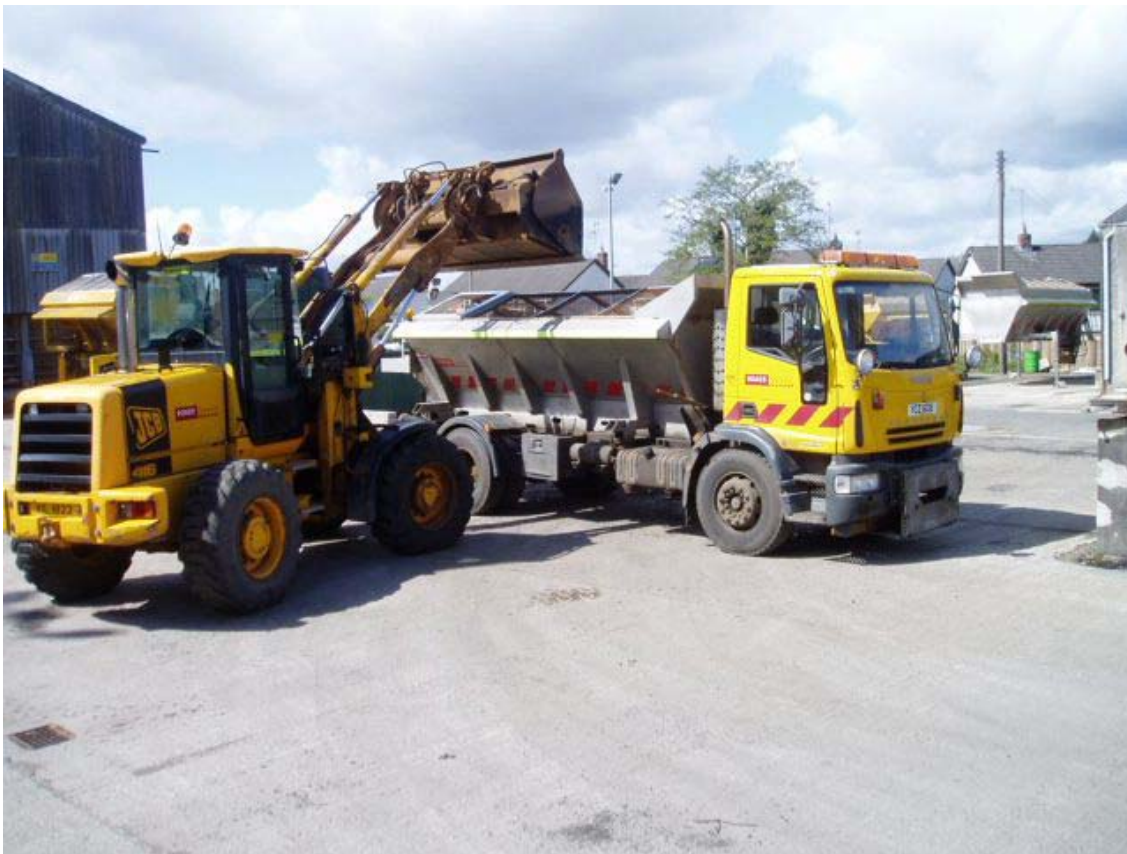
Loading one of the gritting lorries with salt

The winter was milder than previous years but with many marginal nights when treatment was still required. The season had also to be extended due to low temperatures being experienced on 8 – 9th April and on 25 – 26 th April 2016.