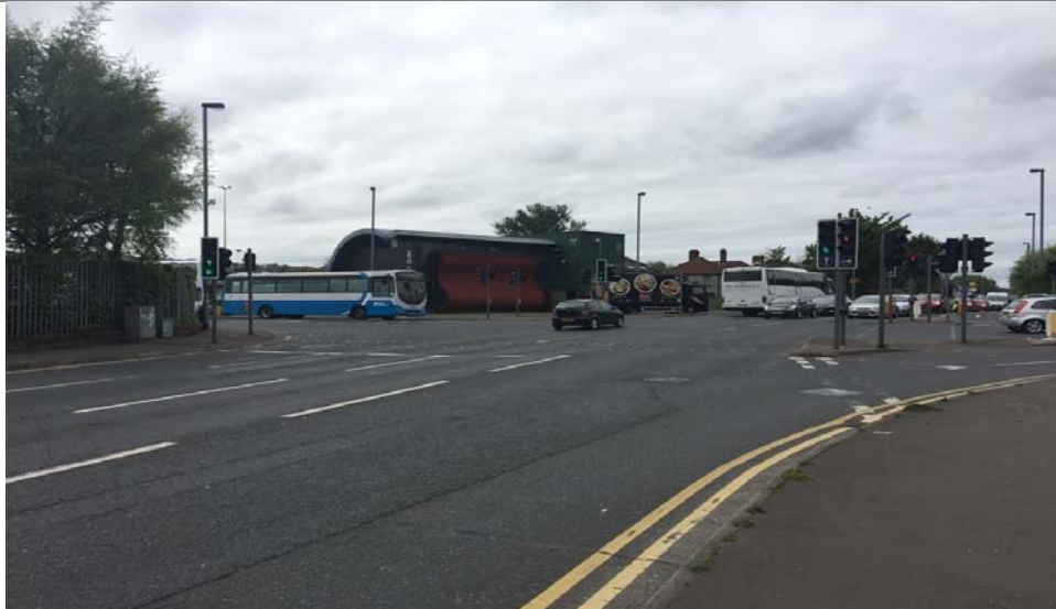
Buncrana Road/Racecourse Road