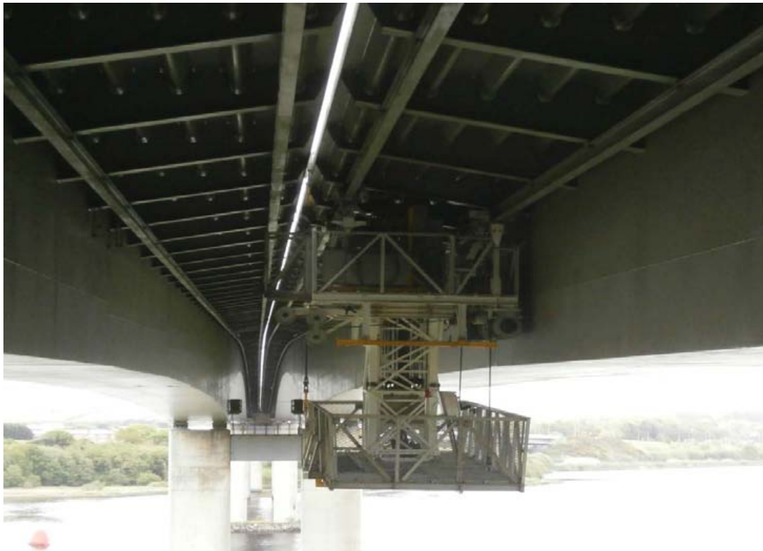
Foyle Bridge - Completion of Gantry Refurbishment

During 2016-2016 Bridge Management Section intends to carry out work to structures in the Derry City and Strabane District Council area representing an investment of approximately £215K in the local infrastructure.