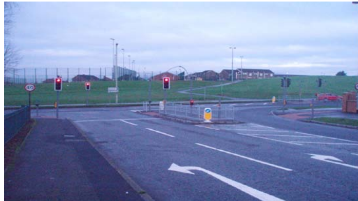
Glengalliagh Rd / Bradley's Pass Junction