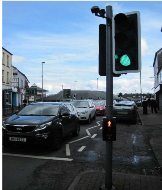
C709 Belmore Street, Enniskillen – New Puffin crossing facility