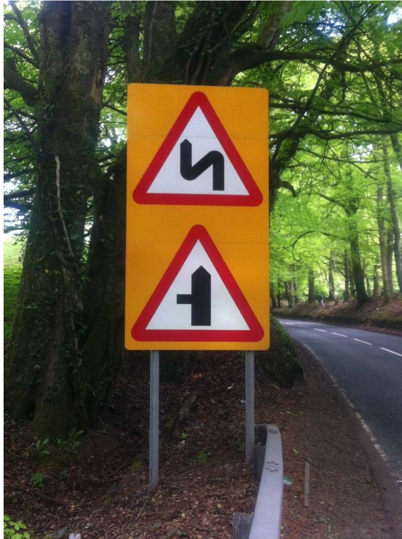
B80 Cullion Road, Tempo – New high visibility warning sign