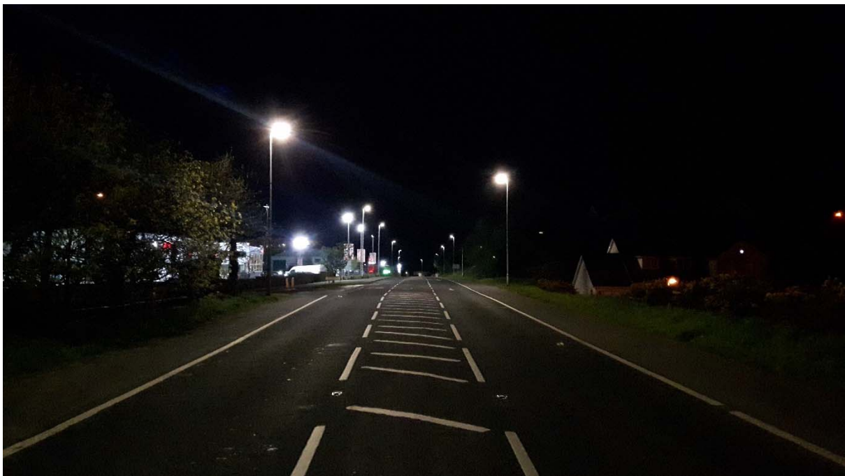
Dromore Road, Omagh

Expenditure on street lighting during 2017-2018, including extra funds received during the year, amounted to £ 895k for maintenance (including £720k on energy). Total capital expenditure amounted to £277k.