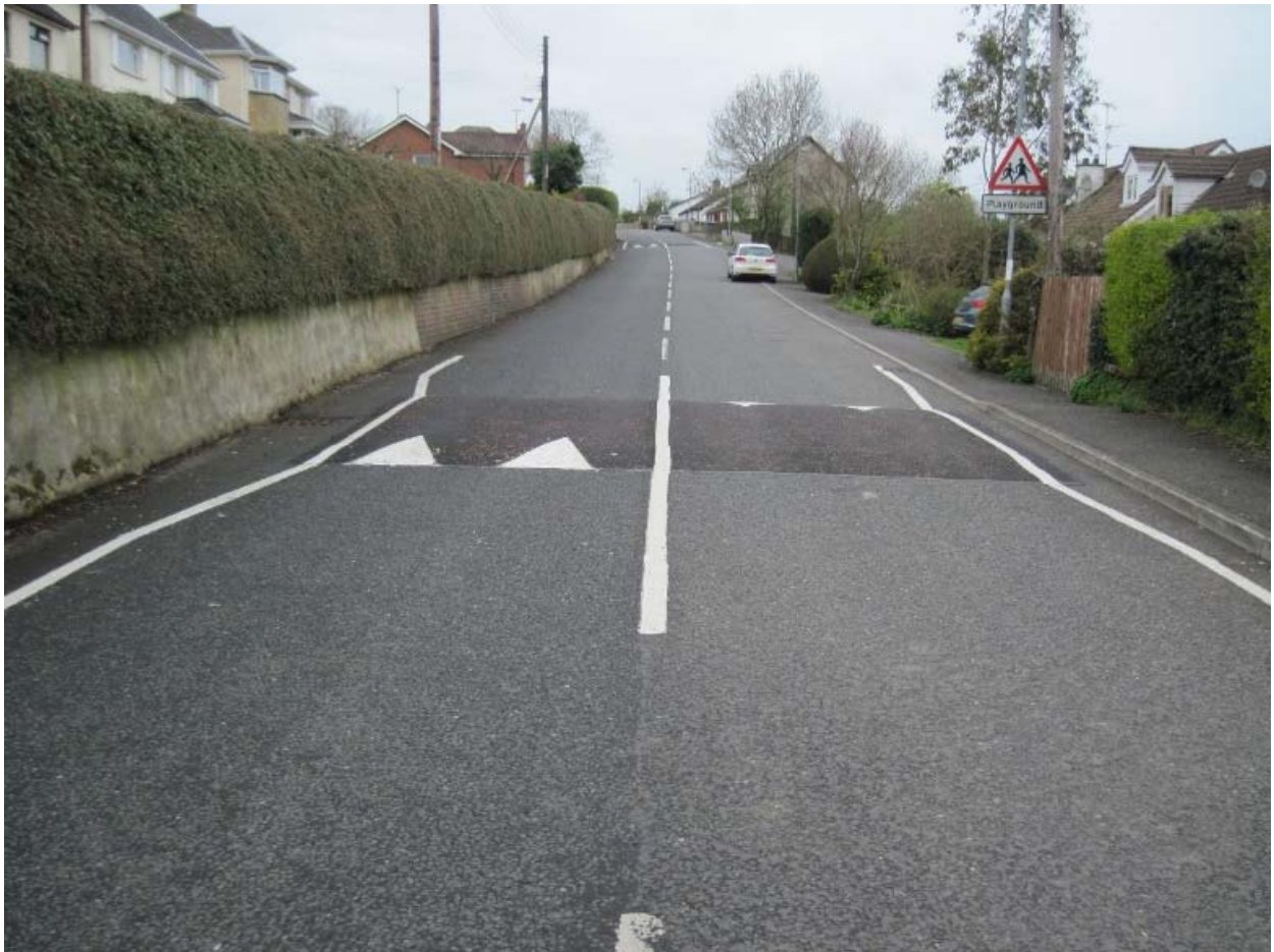
U6300 Old Rossorry Road, Enniskillen – Traffic Calming measures