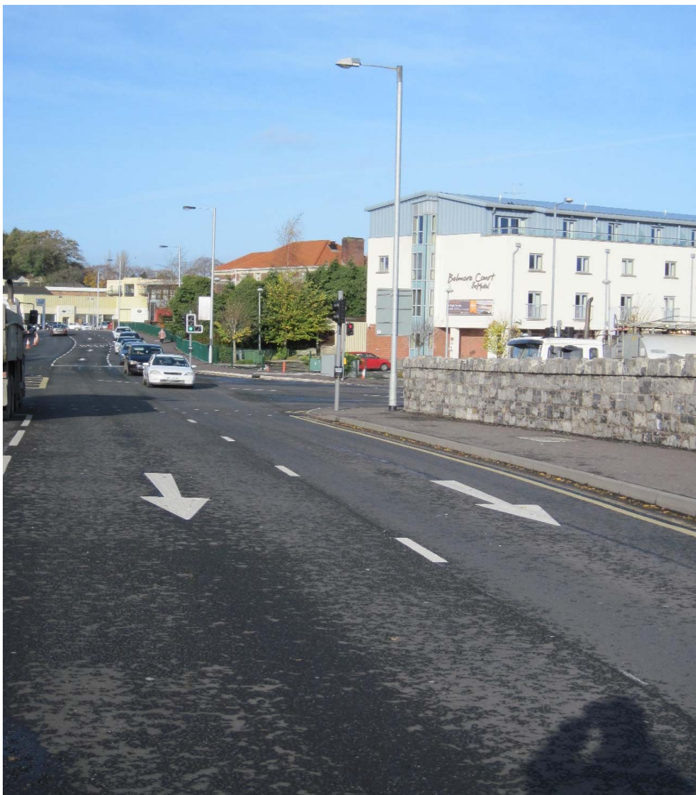
A4 Dublin Road at Wickham Place – Carriageway widening scheme