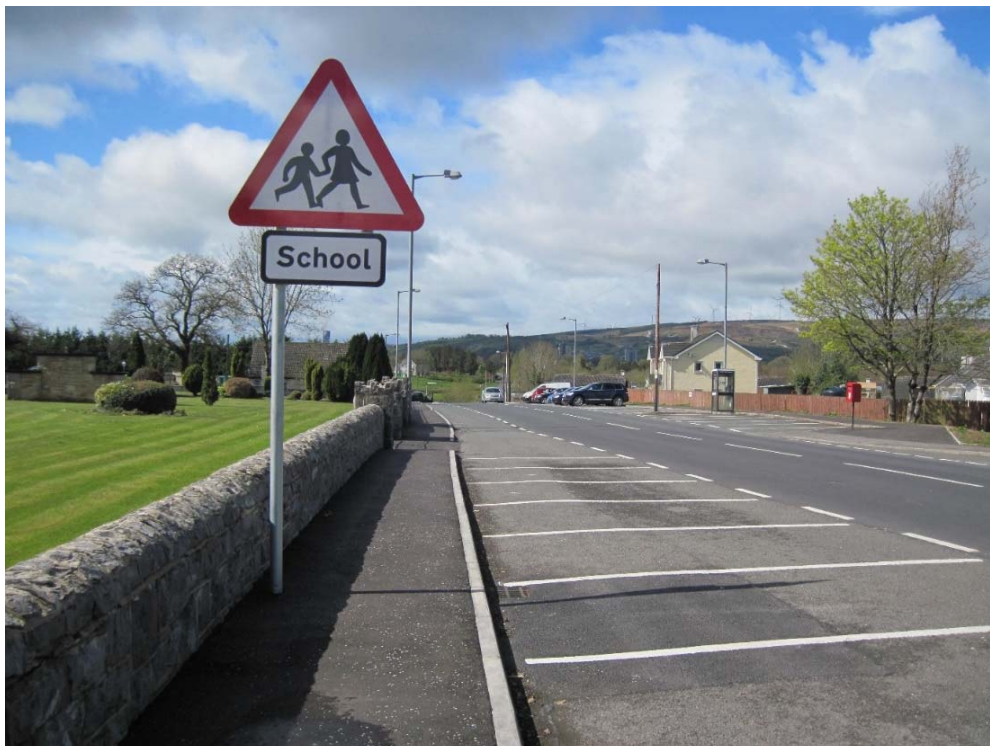
C431 Teemore Road, Teemore – provision of new footway link