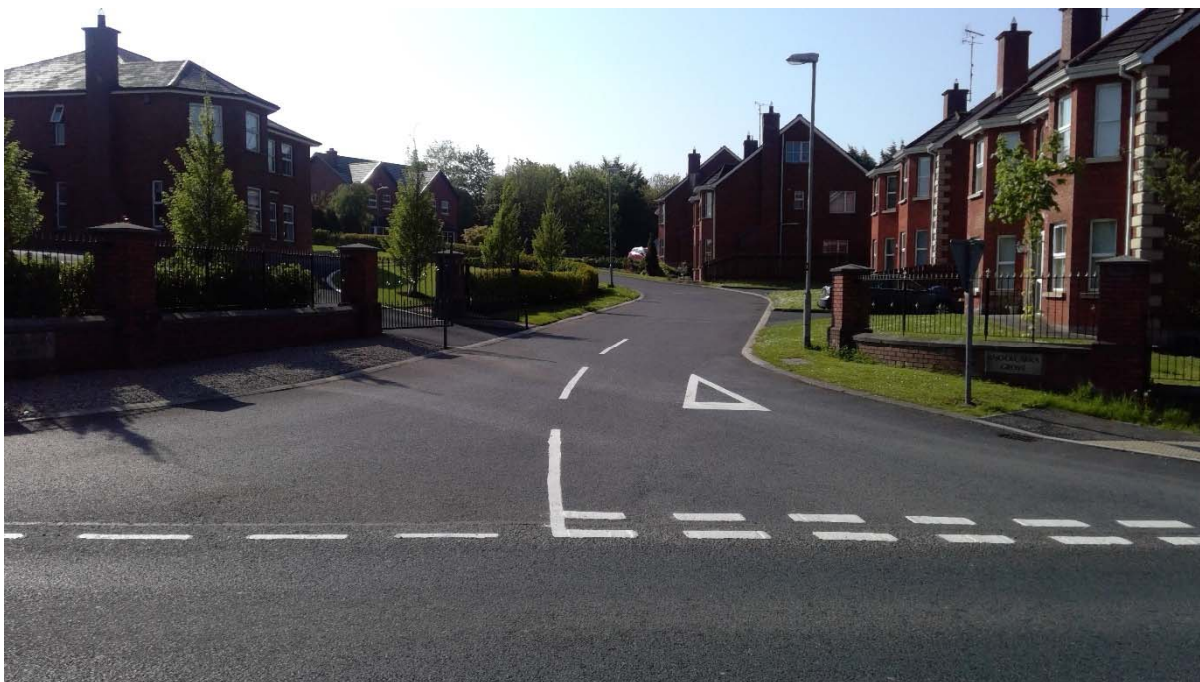
Recently adopted: Knockarra, Omagh