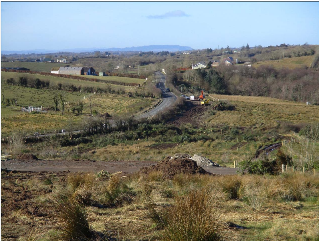
Site Clearance at A32 Cornamuck

The Department is currently developing road realignment schemes at Cornamuck and Kilgortnaleague which will complement the completed schemes at Shanarragh and Drumskinny. Whilst there is currently no budgetary provision for these projects, the Department published the draft Orders and Environmental Statement for the Cornamuck scheme (between Dromore and Irvinestown) in summer 2015. The Direction Order was made in Autumn 2015 and lands were vested in March 2017 in anticipation of funding becoming available to allow procurement and construction to proceed as quickly as possible. Archaeological investigations and works to remove vegetation have recently been completed.