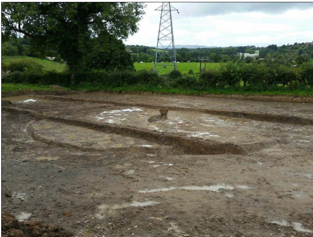
Remnants uncovered of a Bronze Age dwelling in Lisgoole Estate in September 2017

Comments received during the consultation period are currently under consideration and a decision regarding the need or otherwise for a Public Inquiry will be made in due course.