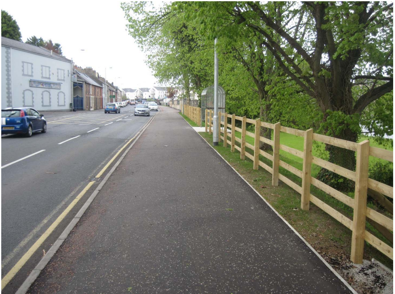
A4 Sligo Road, Enniskillen – Upgrade to provide new footway/cycleway