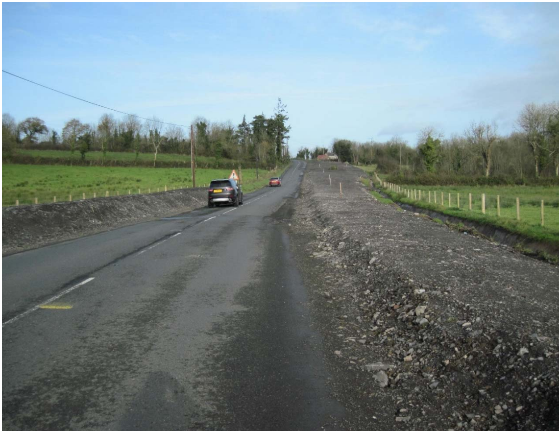
A509 Derrylin Road at Derryhowlaght – Phase 1: Ground Surcharge