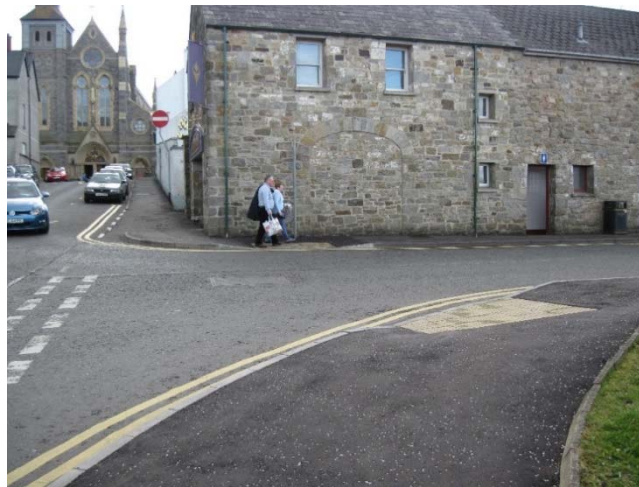
U6519 Head Street, Enniskillen – improved accessibility for pedestrians with disabilities.