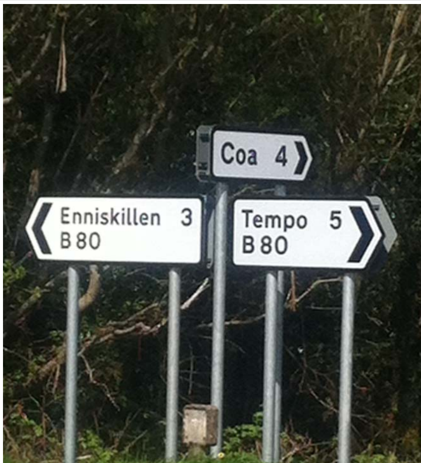
B80 Tempo Road, Enniskillen – New direction signs erected as part of a sign up-grade