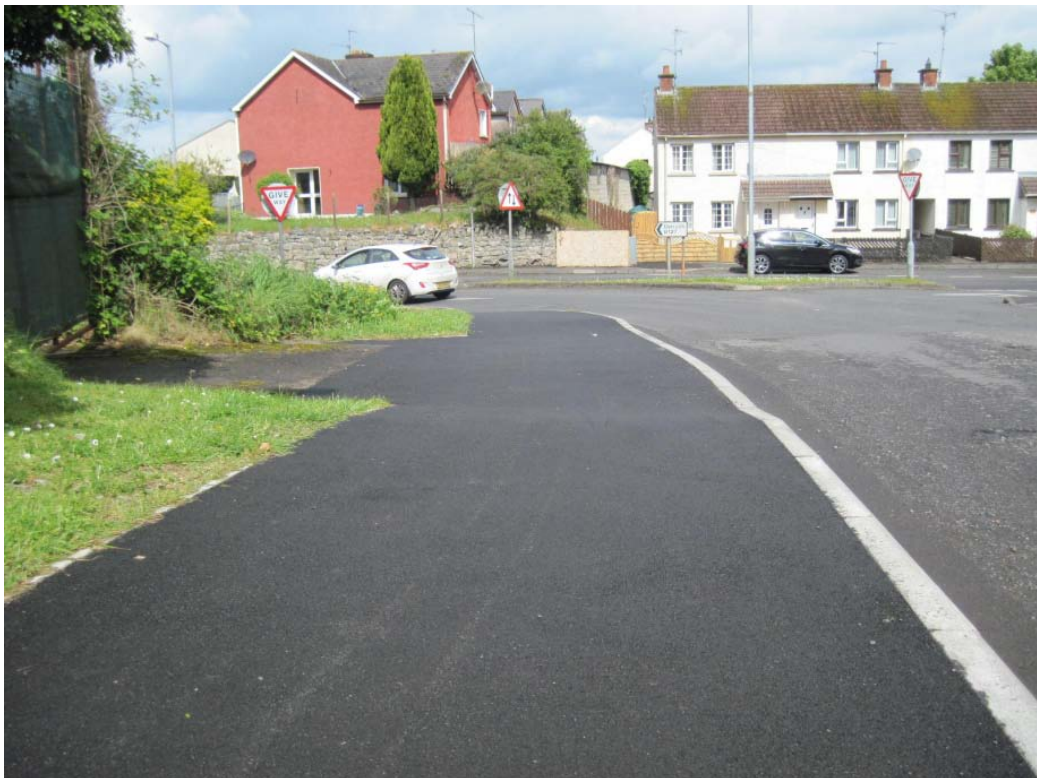
U6675 Church Lane Lisnaskea – New footway provision