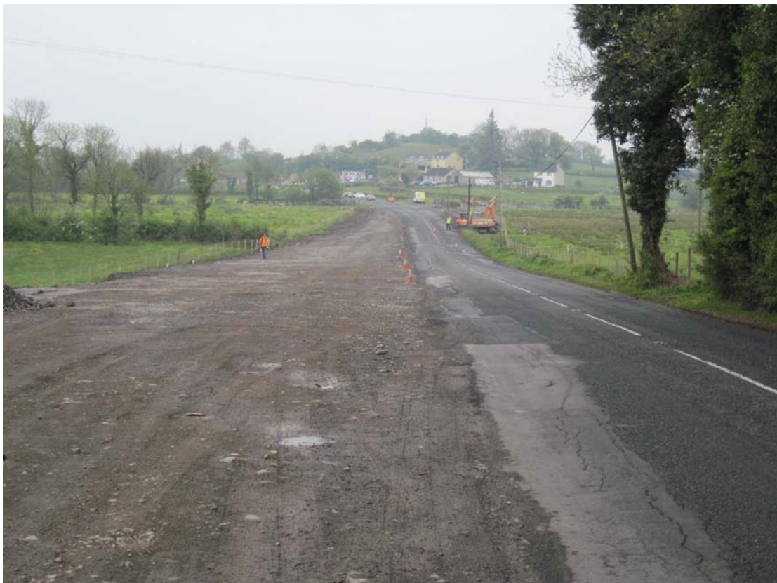
A509 Derrylin Road at Derryhawlaght – Phase 1; Site Clearance/Surcharging