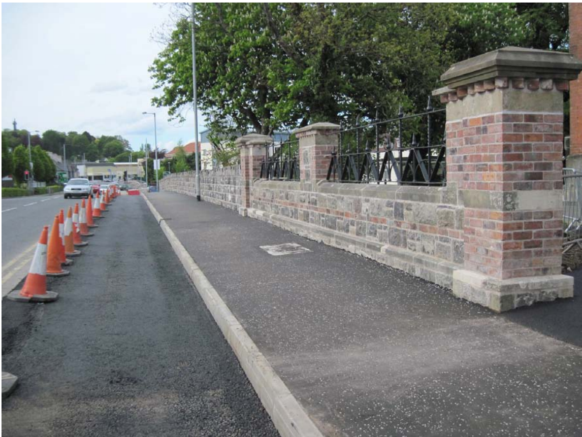
A4 Dublin Road, Enniskillen – Carriageway widening scheme