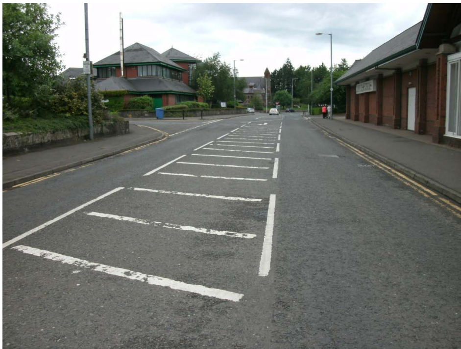
U3016 Irishtown Road, Omagh - Before