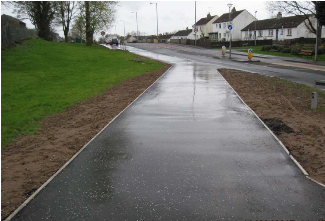
B46 Enniskillen Road, Ballinamallard – Provide new footway/cycleway