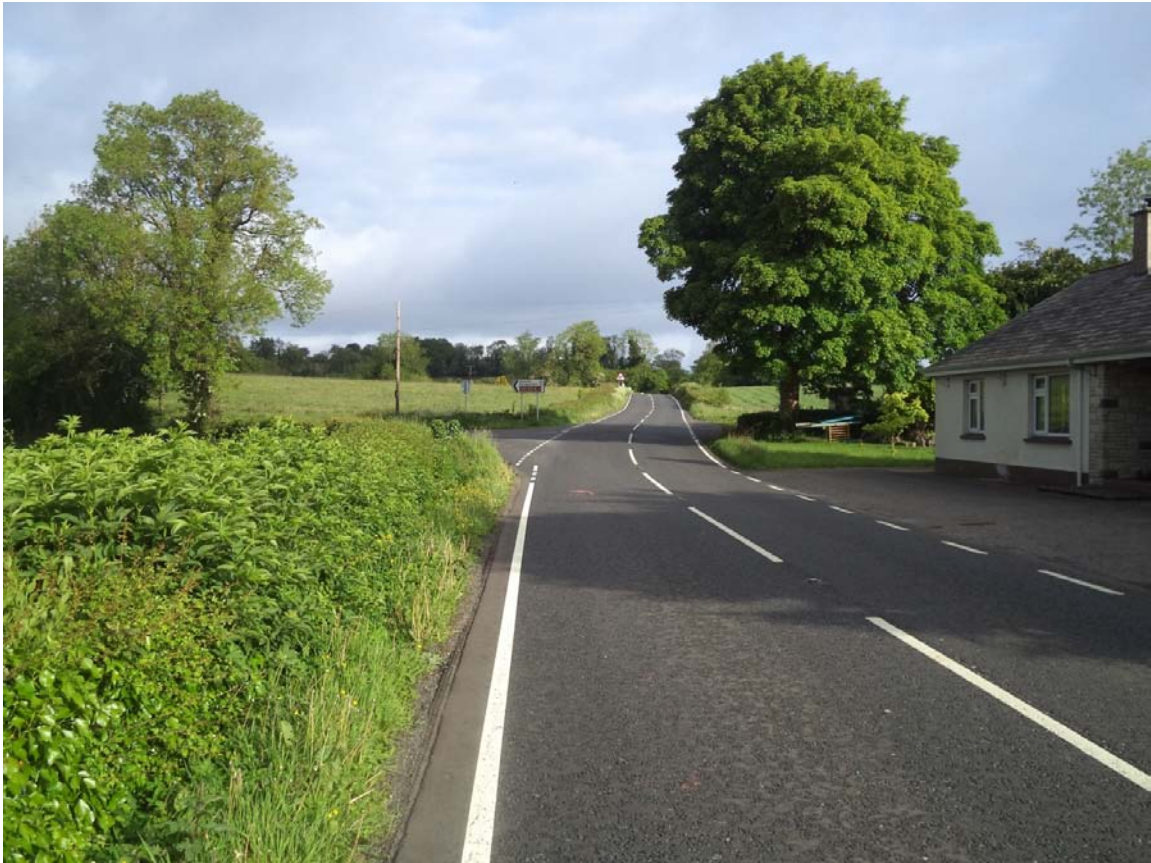
Resurfacing at A46 Loughshore Road at Blaney