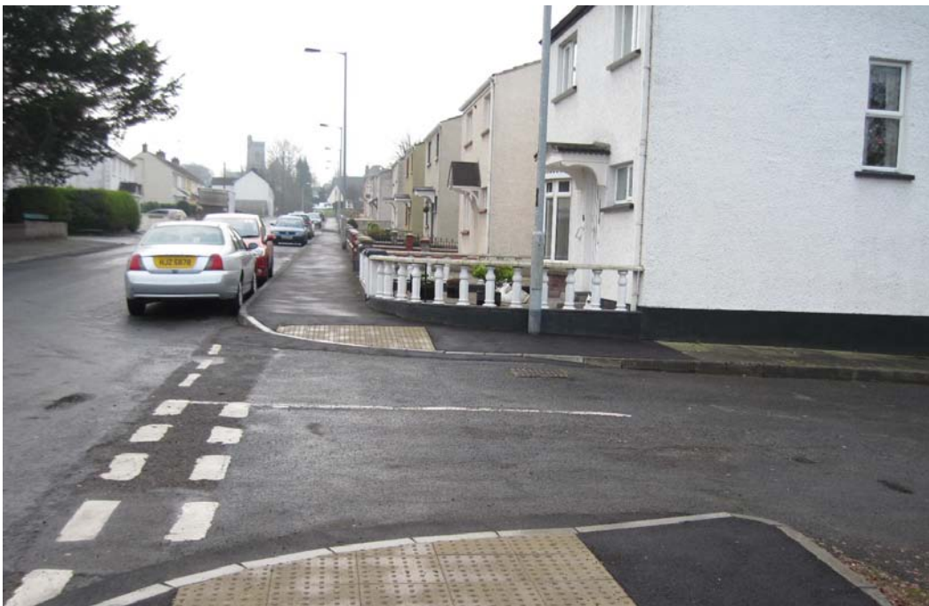
B127 New Bridge Road, Lisnaskea – Quality pedestrian route