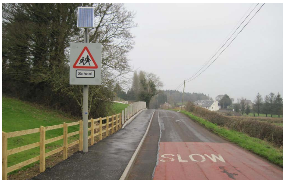
U9119 Landbrook Road, Newtownbutler – After footway provision