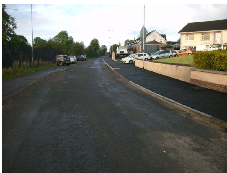
C629 Dervaghroy Road, Beragh - After