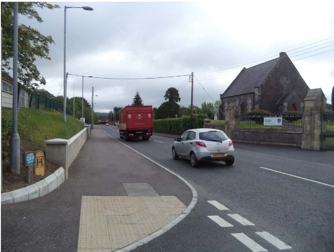
Resurfacing at A32 Tempo Road