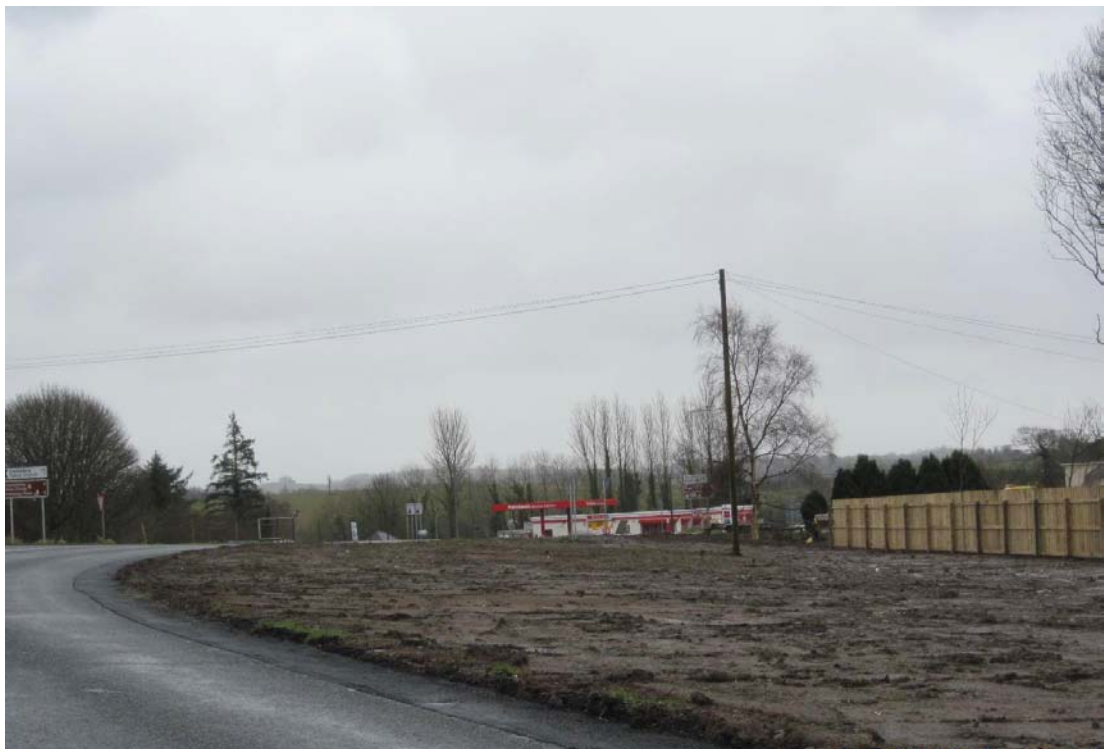
A35 Pettigo Road, Kesh – Sightline improvements at Palm Bush