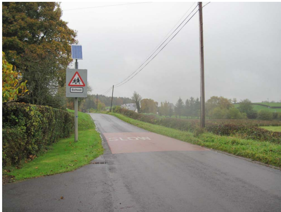
U9119 Landbrook Road, Newtownbutler – Before footway provision