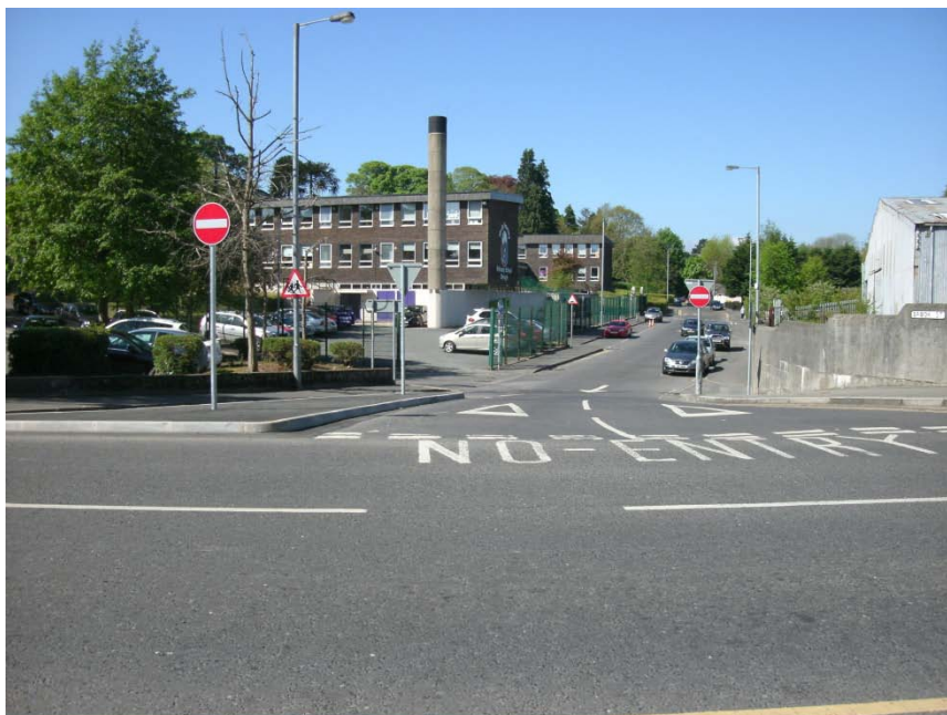
U3005 Brook Street, Omagh – After new one way system