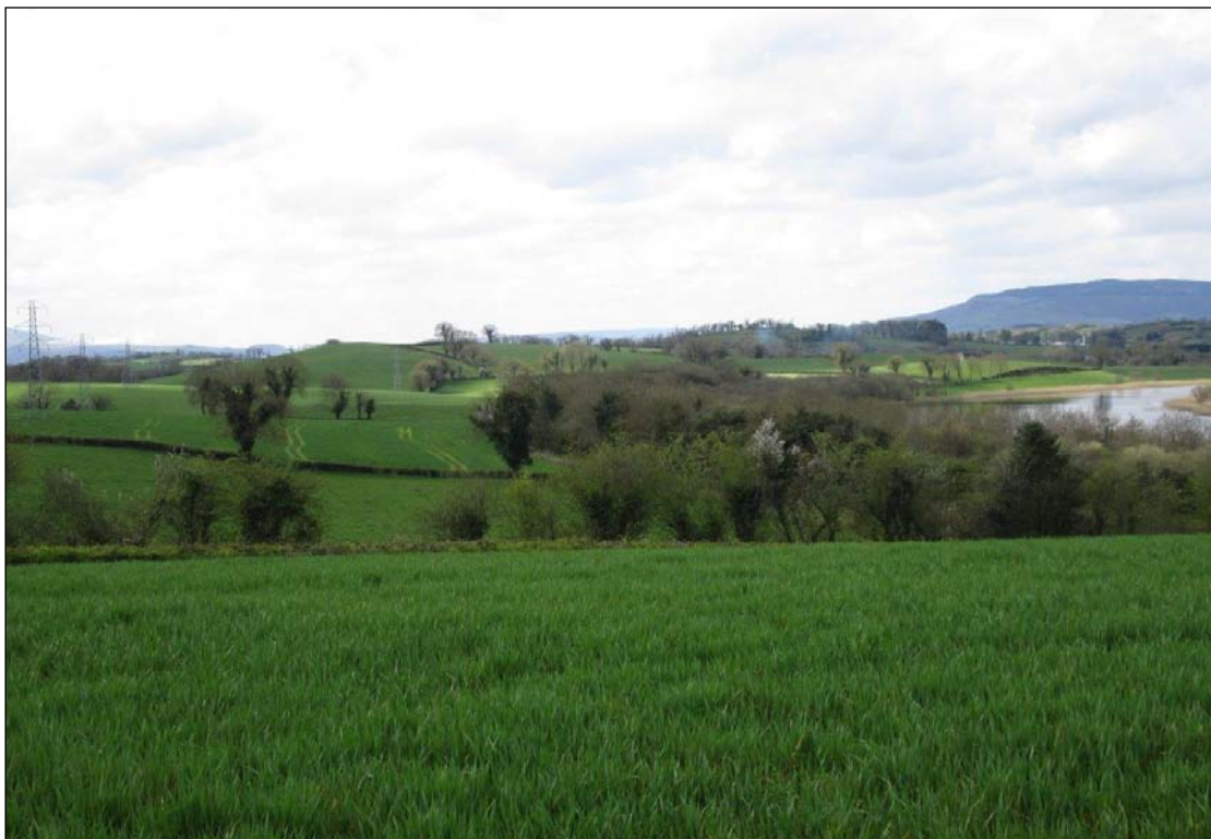
Emerging preferred Route Enniskillen Southern Bypass

Progression of the scheme to the Making of Orders will depend on the availability of funding.