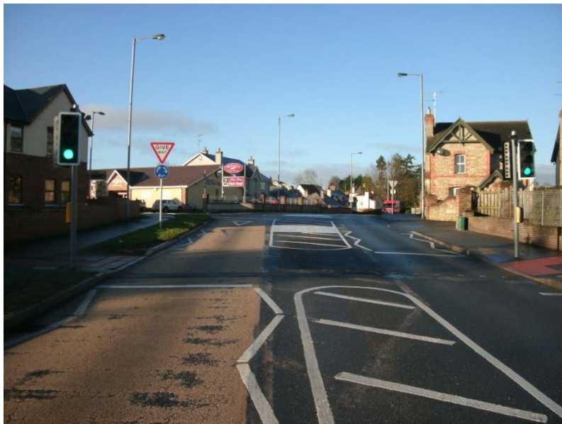
B4 Hospital Road, Omagh - New Puffin crossing