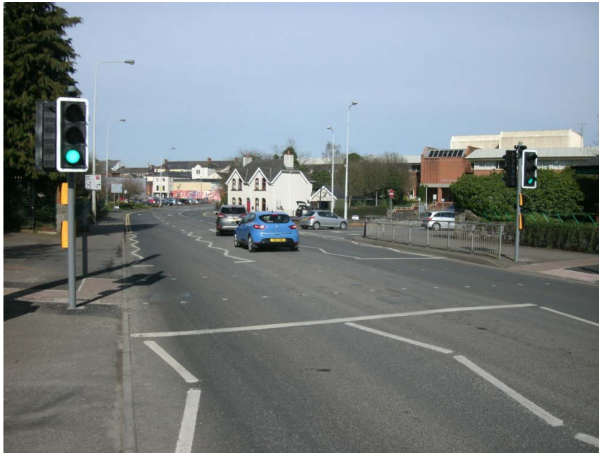
B48 Dublin Road, Omagh at Omagh Academy – Upgraded Toucan pedestrian /cycle crossing