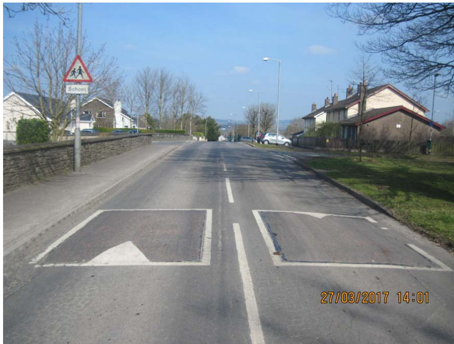
C408 Ardvarney Road, Ederney – Traffic calming

Provide two pairs of speed cushions and associated signs and road markings