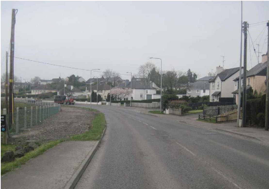
A4 Sligo Road, Enniskillen – forward sight distance improvement works at Rossorry Link Road