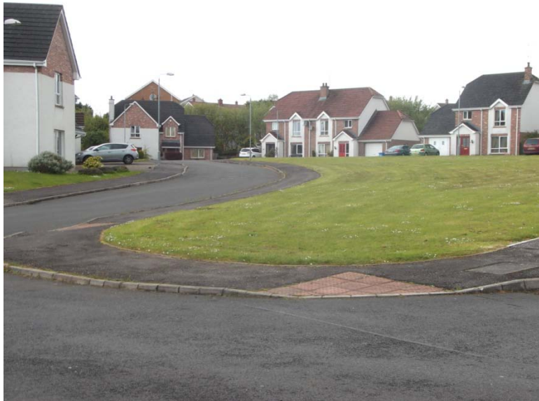
Recently adopted: Ashbourne Manor, Enniskillen