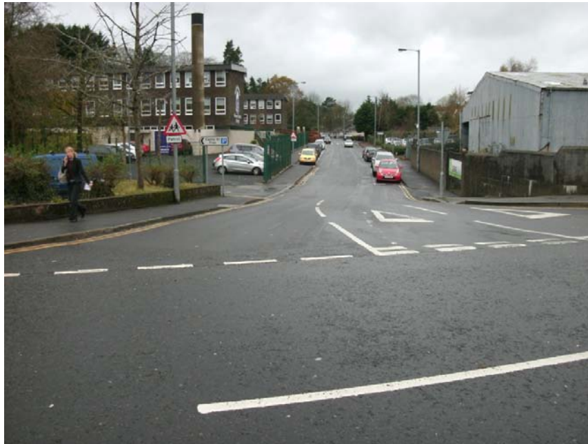
U3005 Brook Street, Omagh – Before new one way system