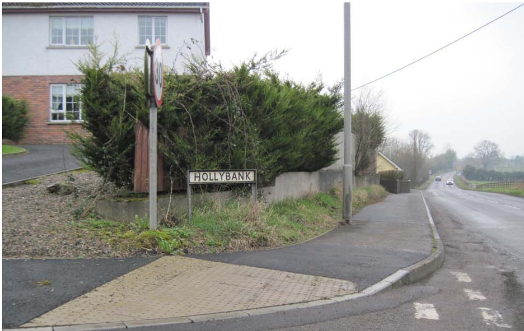
B127 New Bridge Road, Lisnaskea – New footway provision