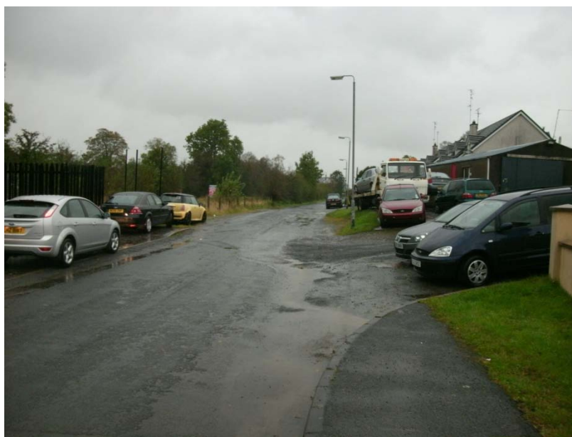
C629 Dervaghroy Road, Beragh - Before