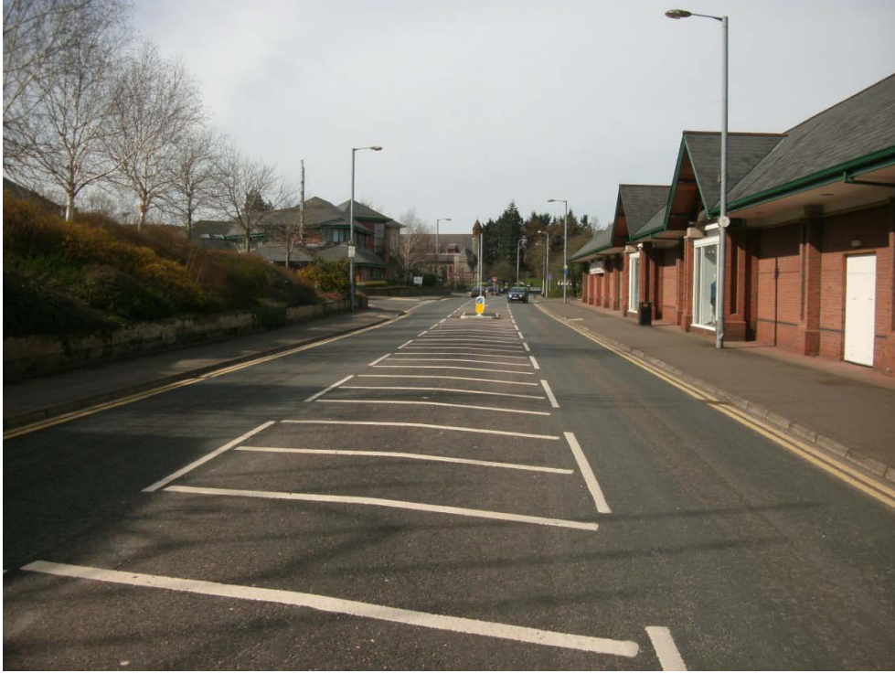
U3016 Irishtown Road, Omagh - After