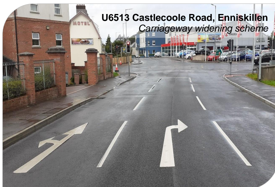
U6513 Castlecoole Road, Enniskillen Carriageway widening scheme