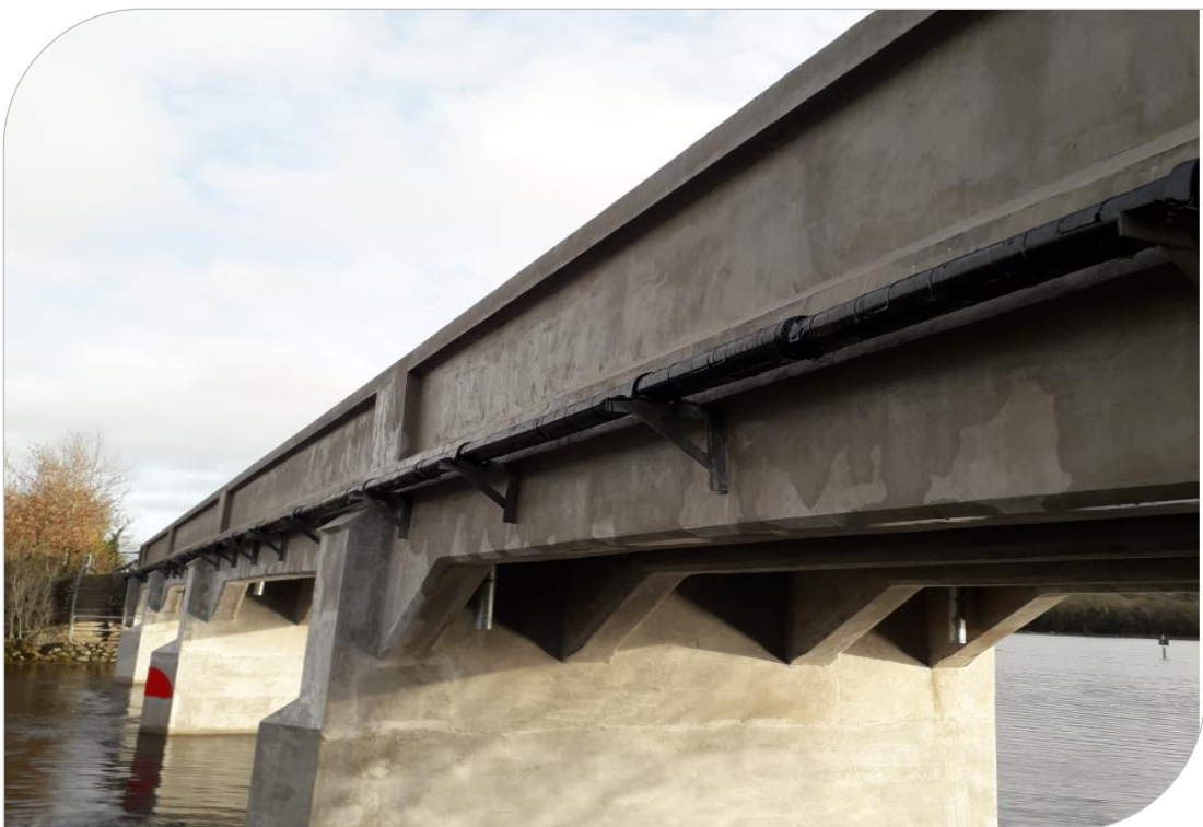
BR60726 Galloon Bridge, Newtownbutler