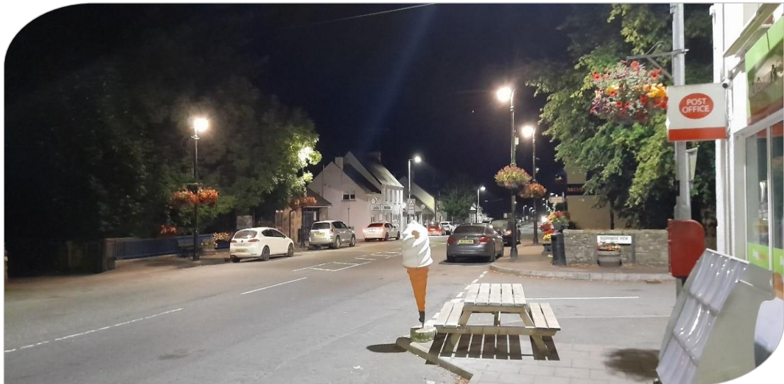
Street Lighting Renewal Scheme at Main Street, Gortin