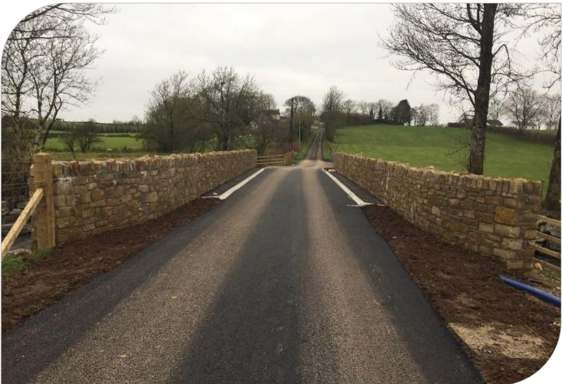
BR61256 Bracky Bridge, Carrickmore