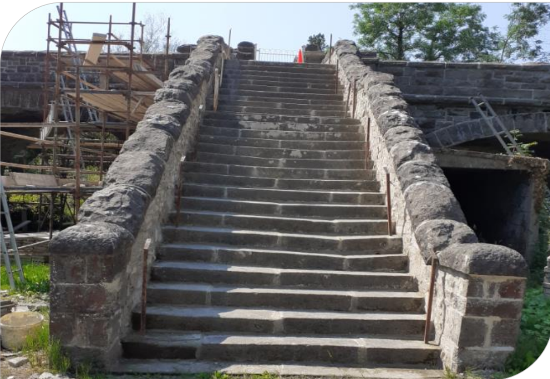
Bundoran Junction Bridge