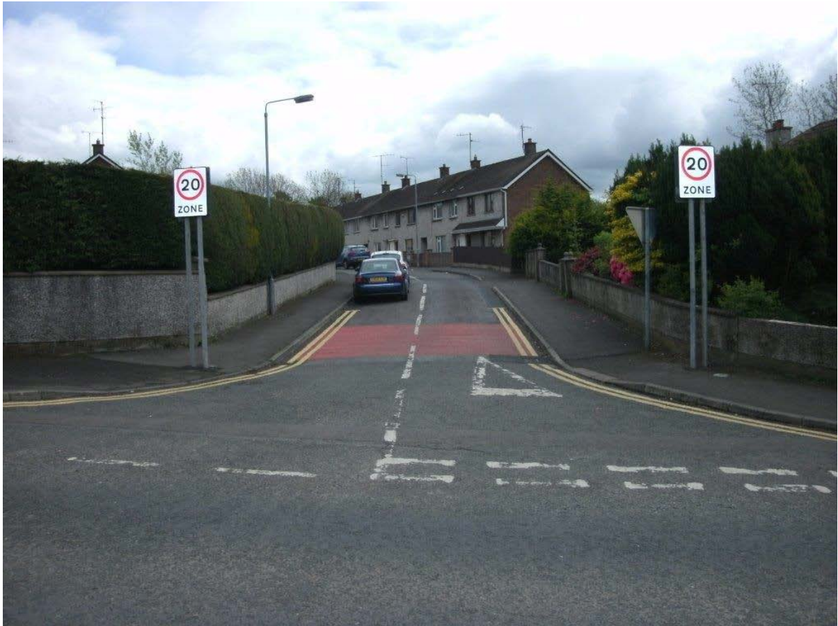
Centenary Park, Omagh