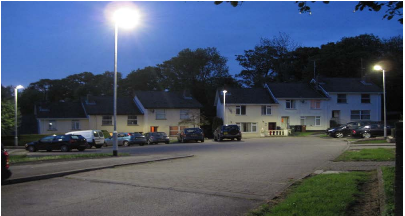
Cleenish Park, Enniskillen

Particular mention should be made of the work carried out on Gortin Road, Omagh & Cleenish Park, Enniskillen where an increase in funding near year end allowed commencement or completion of renewal schemes in these areas.