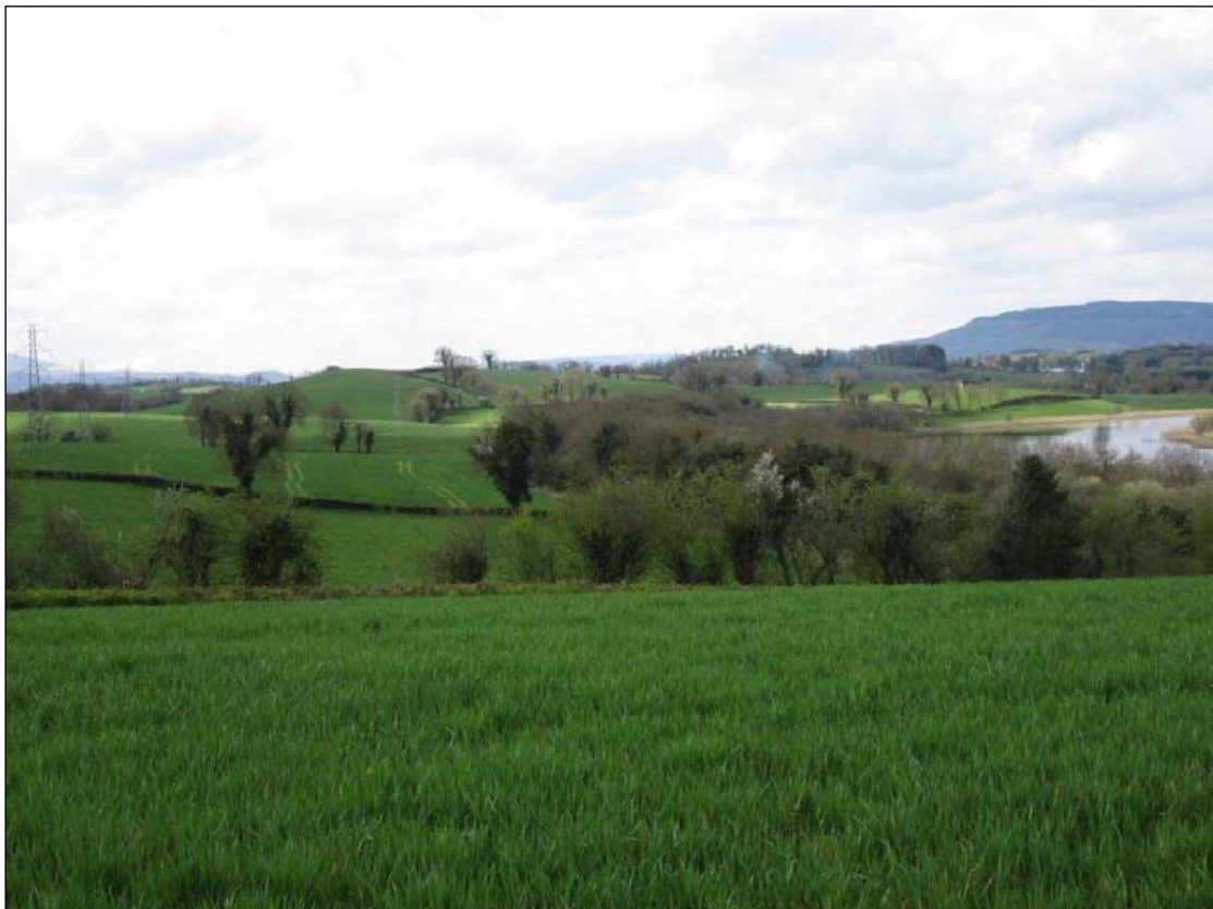
Emerging preferred Route Enniskillen Southern Bypass

Progression of the scheme to the Making of Orders and the associated Statutory Consultation process (which may include a Public Inquiry) will depend on the availability of funding.