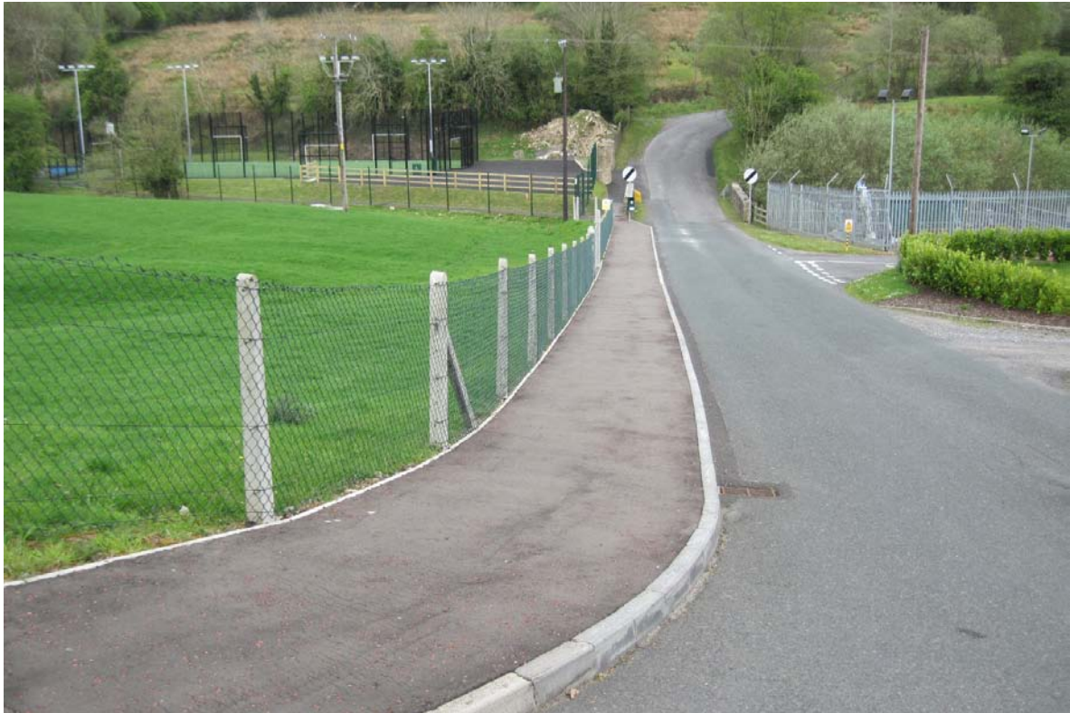
Kilsmullen Road, Lack – new footway provision