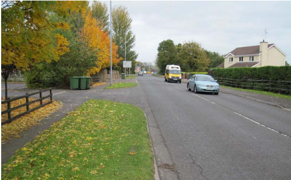
A32 Tempo Road, Enniskillen - Before