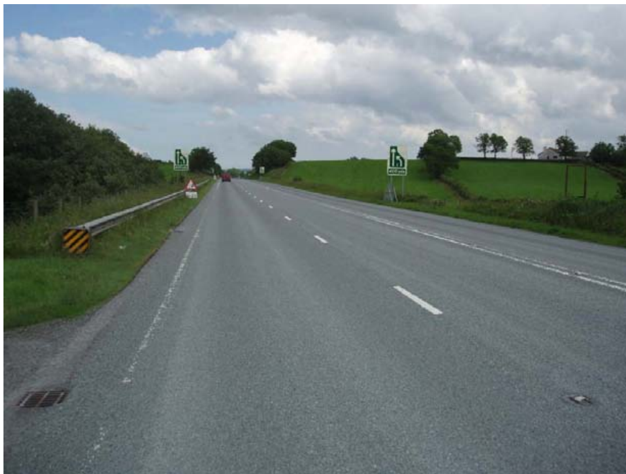
Surface dressing on A4 Belfast Road at Faughard

Last year 267.3 kms of road were surface dressed in the Fermanagh and Omagh area at a cost of £2.12 million.