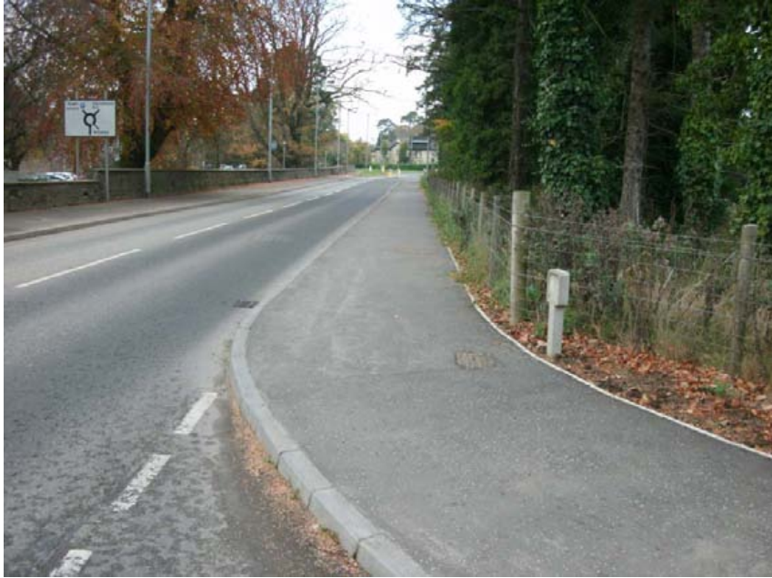
B158 Donaghanie Road, Omagh