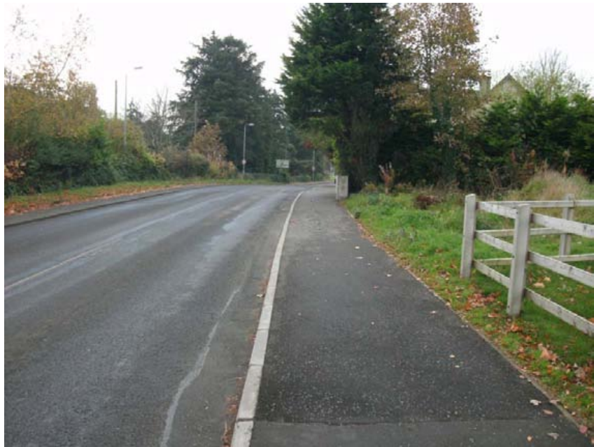
C627 Deverney Road, Omagh