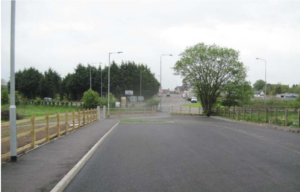
Gardiners Cross Road, Maguiresbridge – Park and Share provision