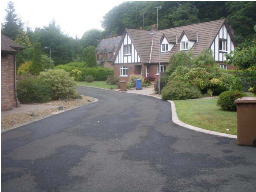
Recently adopted development at Hawthorne Grove, Omagh

We have been successful in adopting 8 private streets within developments and a total length of 3.78km has been added to the maintained network in the past year. These include: