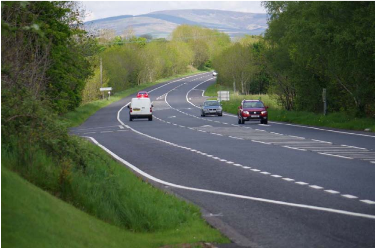
A32 Clanabogan Road