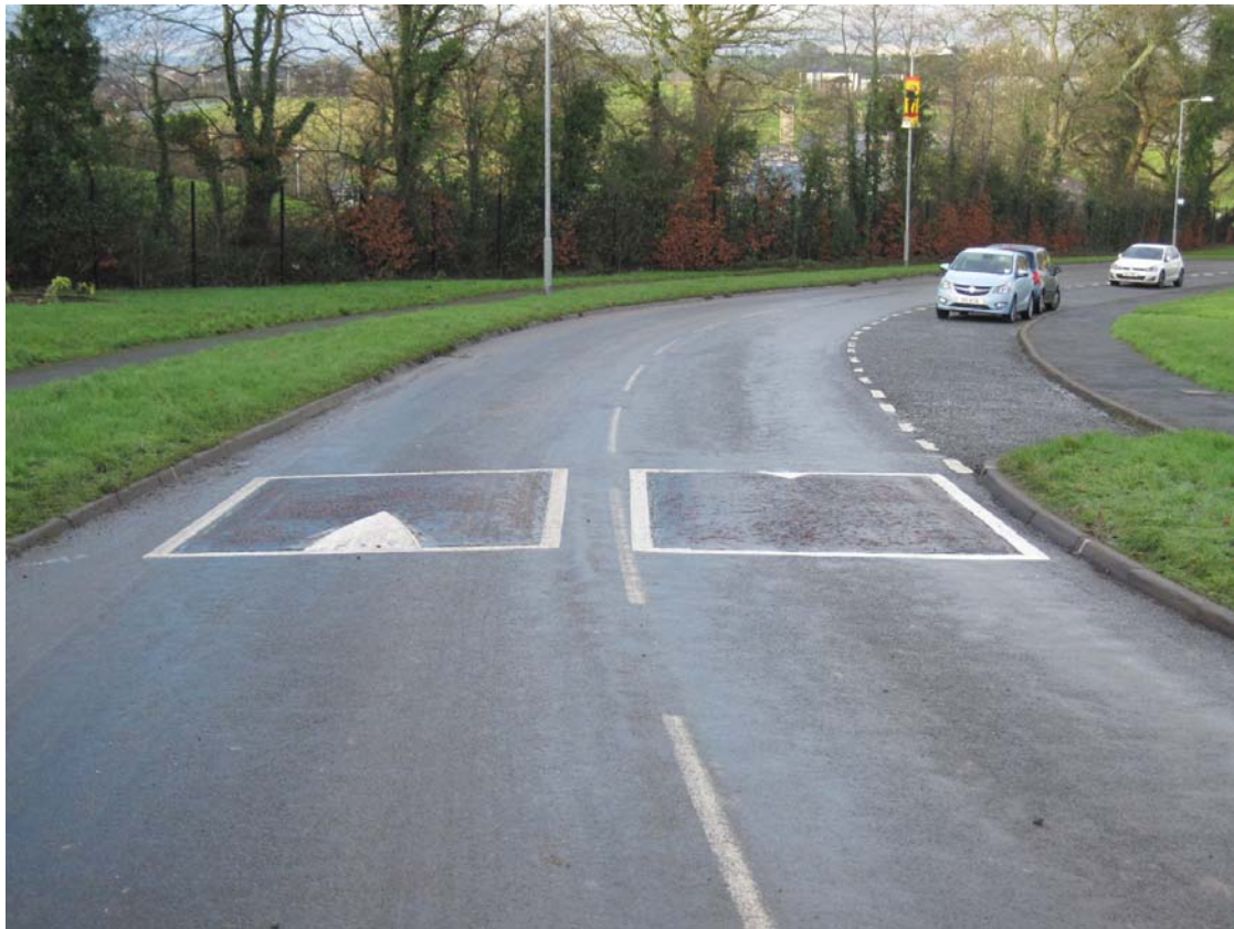
Loane Drive, Enniskillen – Traffic Calming provision