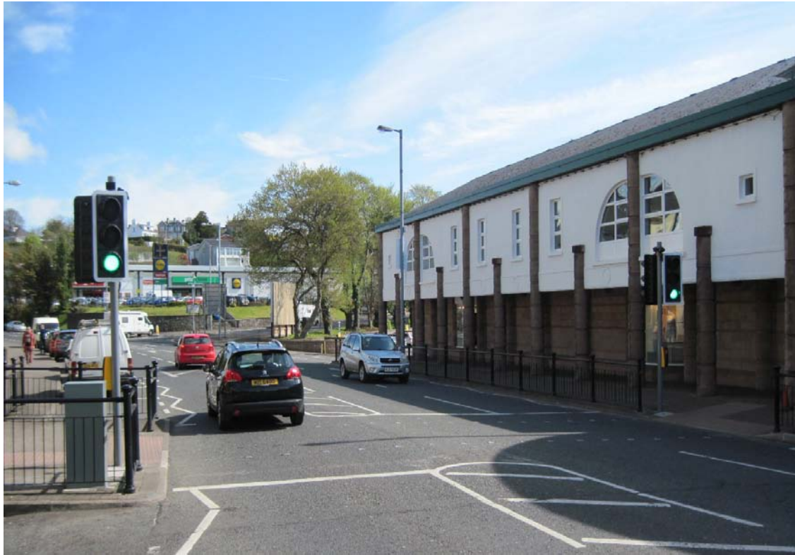
A32 Forthill Street, Enniskillen – Puffin crossing provided