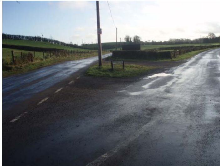
Newtownsaville Road/Killadroy Road, Eskra - before