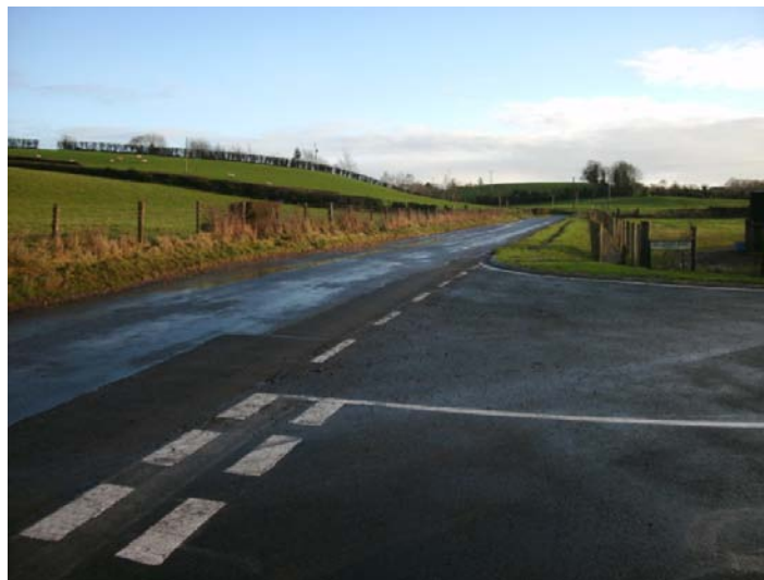
Newtownsaville Road/Killadroy Road, Eskra - after