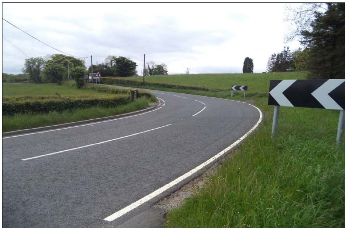
Resurfacing on A4 Sligo Road at 'Double Corners'