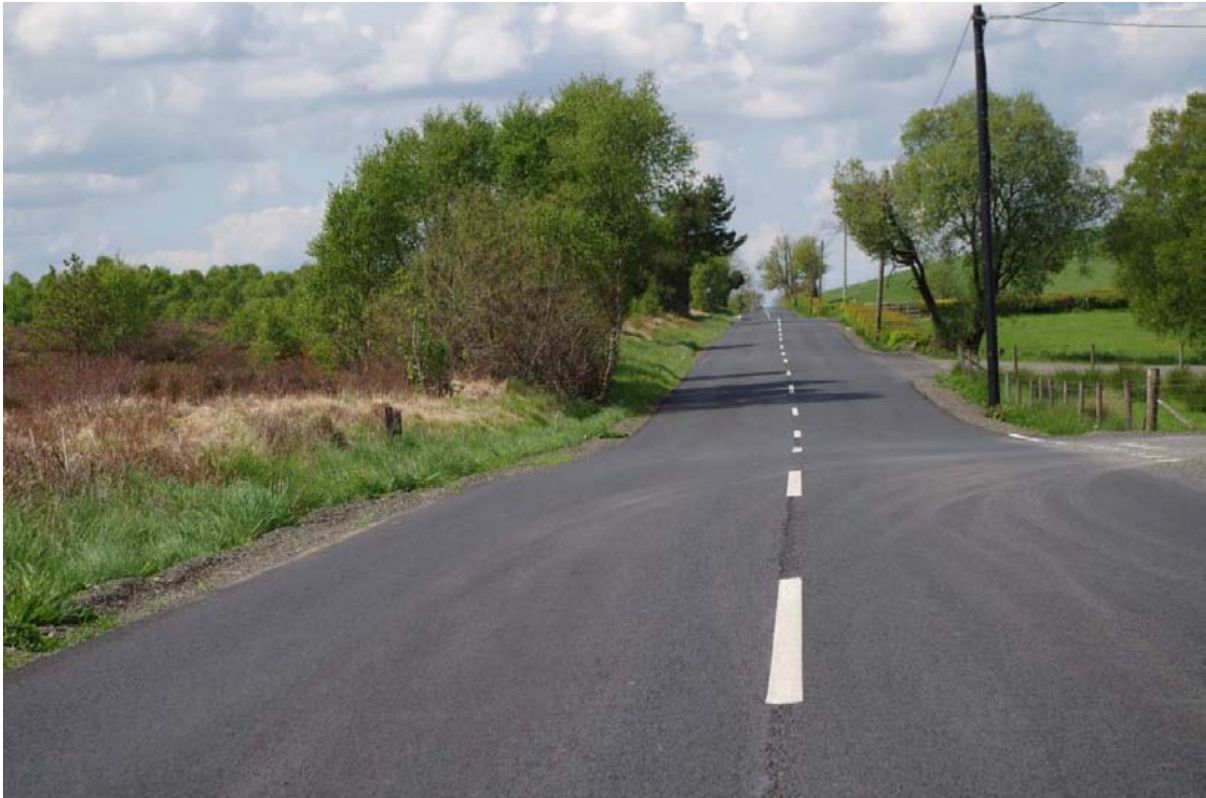
B158 Donaghanie Road