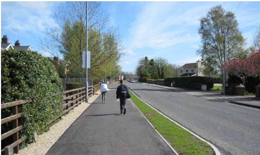
A32 Tempo Road, Enniskillen - After