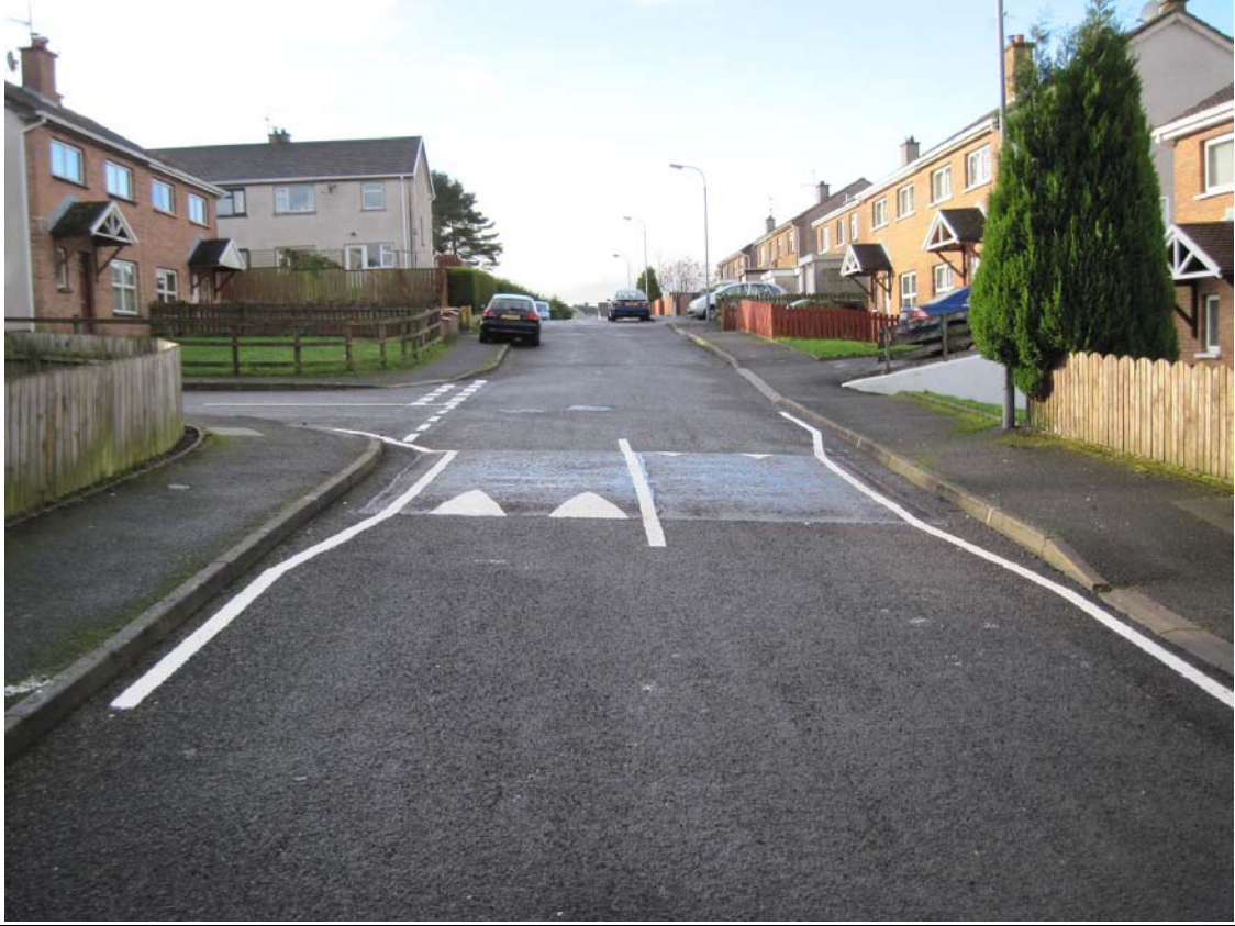
Glebe Park, Enniskillen – Traffic Calming provision