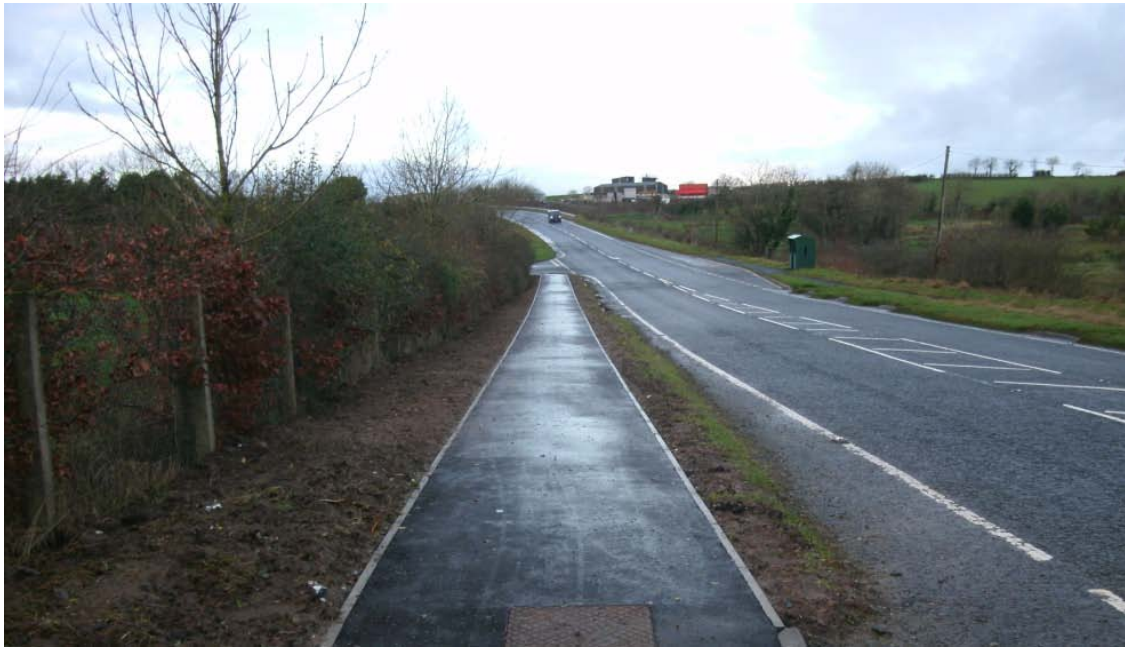
A32 Clanabogan Road, Omagh