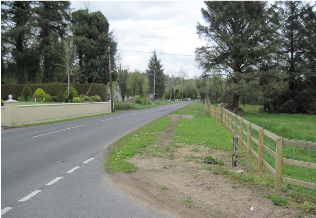
B36 Dernawilt Road/Aghadrumsee Road – Sightline improvement scheme