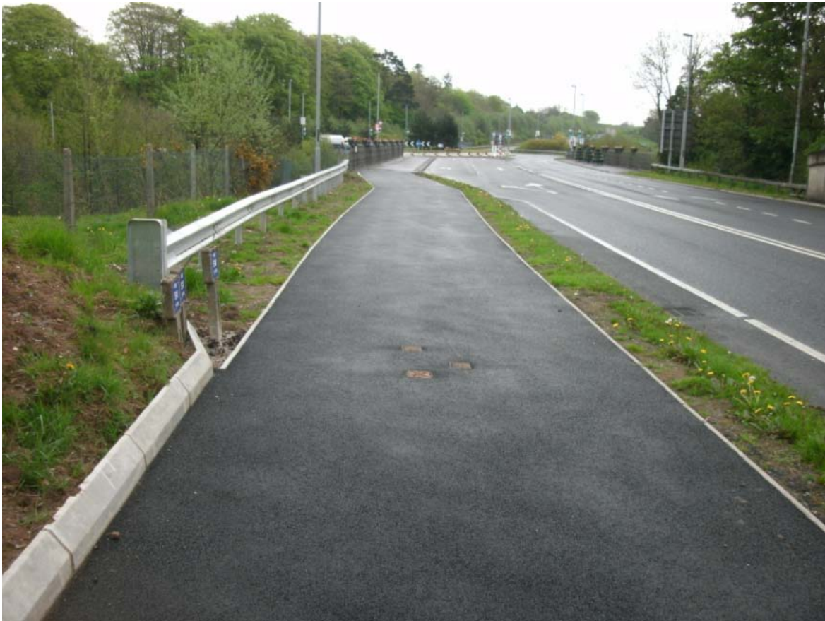
A5/A505 Dublin Road/Crevenagh Road