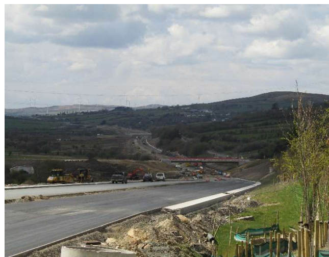
Construction of dual carriageway at Ballyhanedin