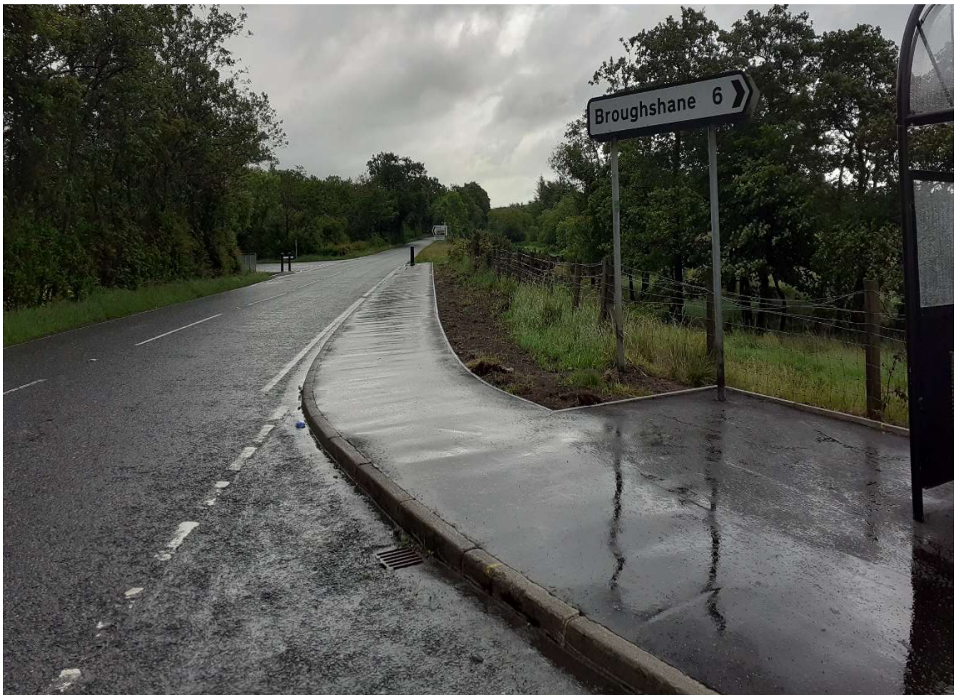
Completed Scheme – Glenravel Road.

The scheme is now complete and included the provision of approximately 50 metres of new footway construction, pedestrian guardrail, dropped kerb crossing points with tactile paving, pedestrian bollards and the relocation of the existing bus stop. The bus stop was relocated in conjunction with Mid and East Antrim Borough Council who provided the bus shelter and Translink who agreed to the position.