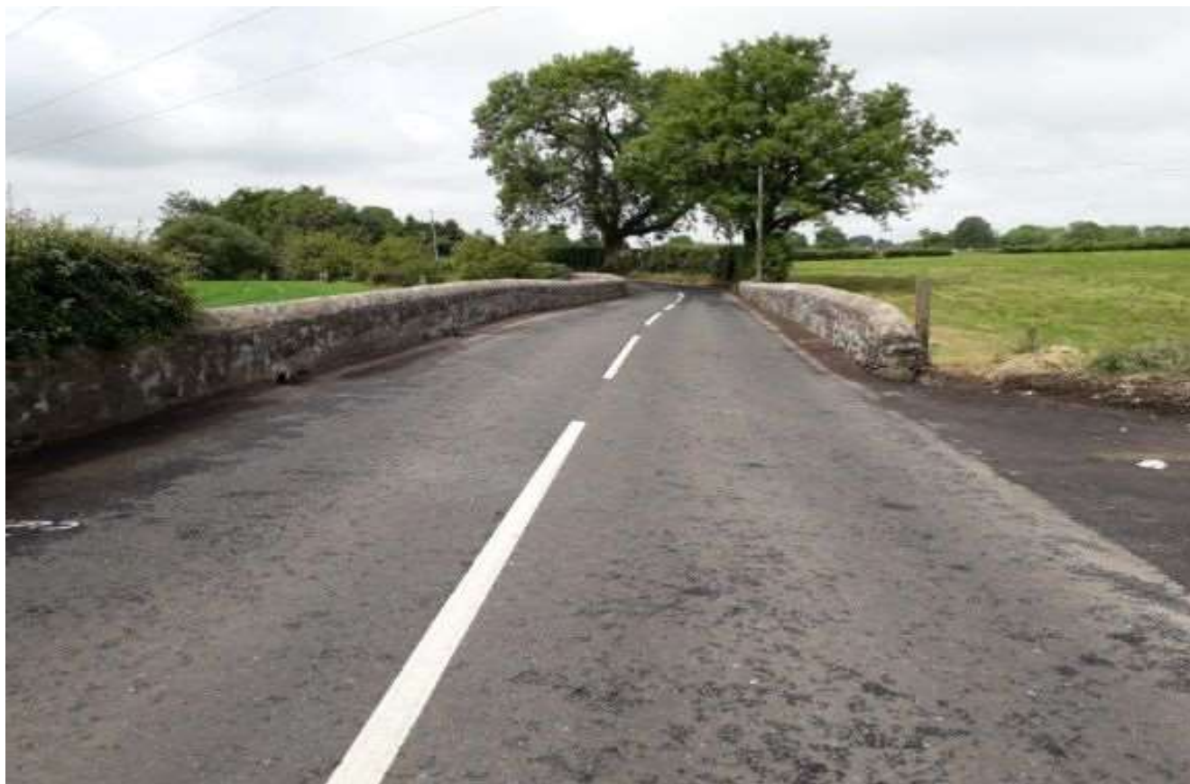
Completed Scheme – Liminary Bridge