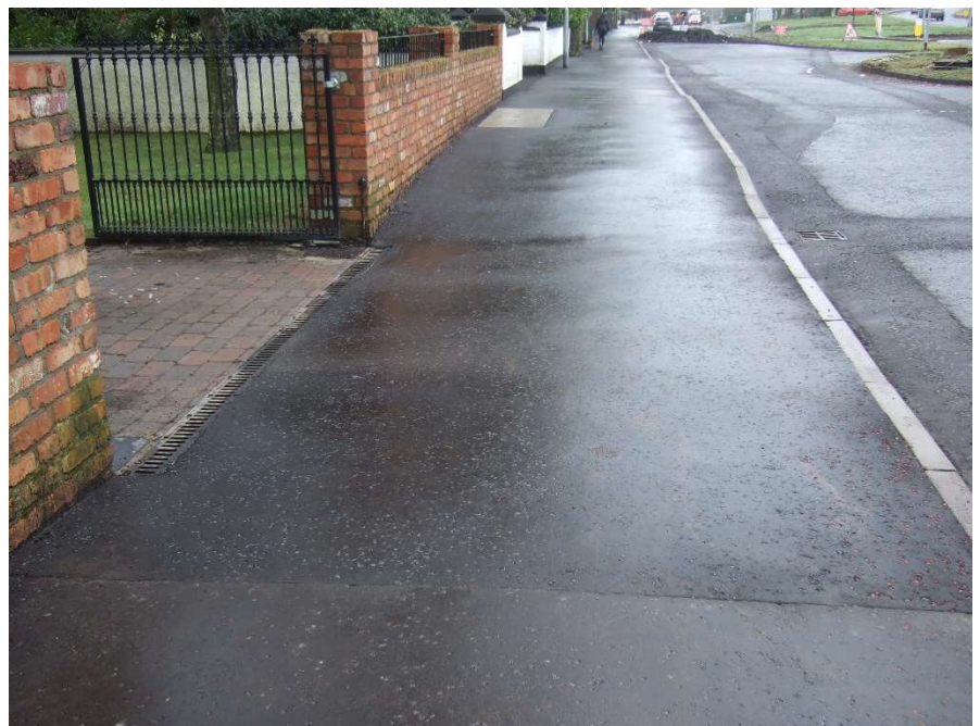
Completed scheme – Fry's Road