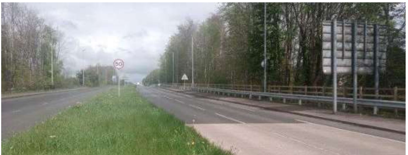
Completed VRS Upgrade Scheme - Raceview Road, Ballymena.

Total Completed Vehicle Restraint System Upgrade work at a cost of £246,524