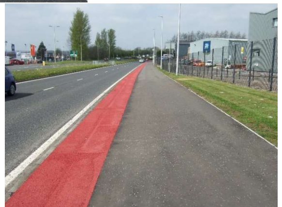
Completed Scheme – Larne Road Link, Ballymena.