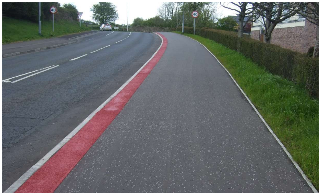
Completed scheme - Doury Road