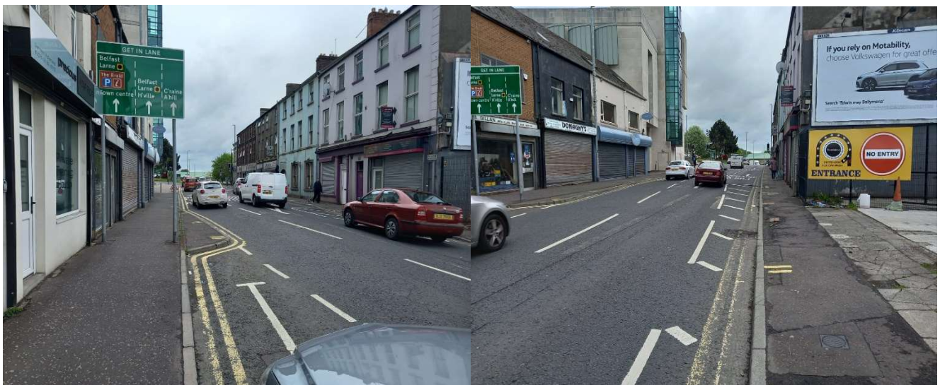
Re-designating the traffic lanes of the Galgorm Rd/Linenhall St./A26 Larne Rd Link Corridor. - Completed Scheme

The traffic signals at Pat's Brae and Bridge Street have also been synchronised with the other junctions to aid traffic progression through one of the town's busiest corridors.