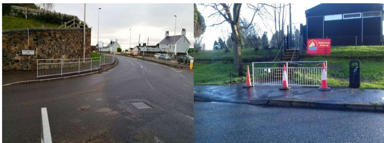
Completed Scheme - A2 Shore Road at Shorelands and Curran Road in Larne.

New pedestrian guardrail has been provided at the junction of A2 Shore Road and Shorelands in Jordanstown, and on Curran Road at Harbour Bears pre-school in Larne. These rails provide improved pedestrian safety at designated crossing points, busy road junctions and particularly vulnerable locations, such as schools and playgrounds.