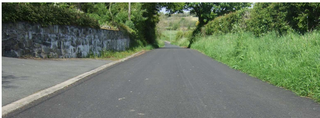
Completed Scheme – Upperstown Road