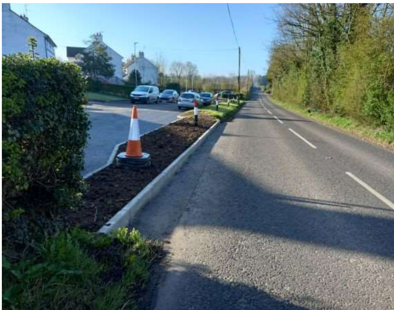
Completed Scheme - Mount Pleasant – Townhill Road, Portglenone.

Following a number of high profile collisions at the entrance to Mount Pleasant estate, off the Townhill Road in Portglenone, a collision remedial scheme has been implemented to improve traffic safety by formalising the entrance arrangement. This scheme utilises the Southern entrance, which has better sight lines when exiting the estate and improved forward visibility for traffic on Townhill Road.