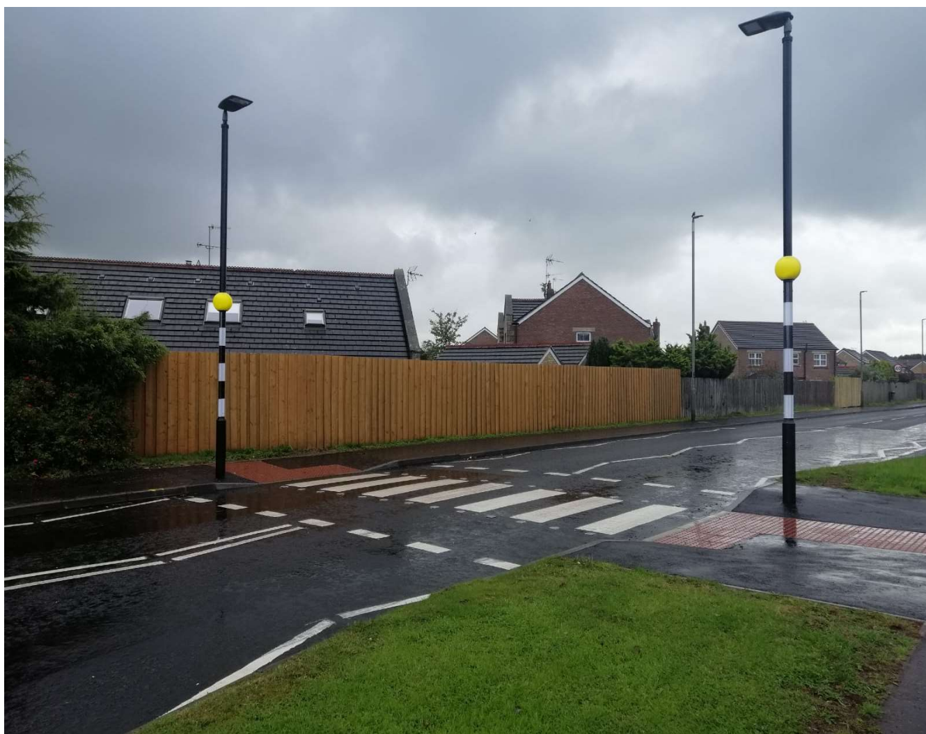
Completed Scheme - Zebra Crossing Tullygarley Road, Ballymena.

A zebra crossing has been provided on Tullygarley Road in Ballymena. The scheme includes the provision of pedestrian guardrail, LED street lighting and Belisha Beacons. This scheme will improve pedestrian safety for users accessing the shops, Tullygarley Community Centre and Mid and East Antrim Borough Council's newly constructed children's play park.