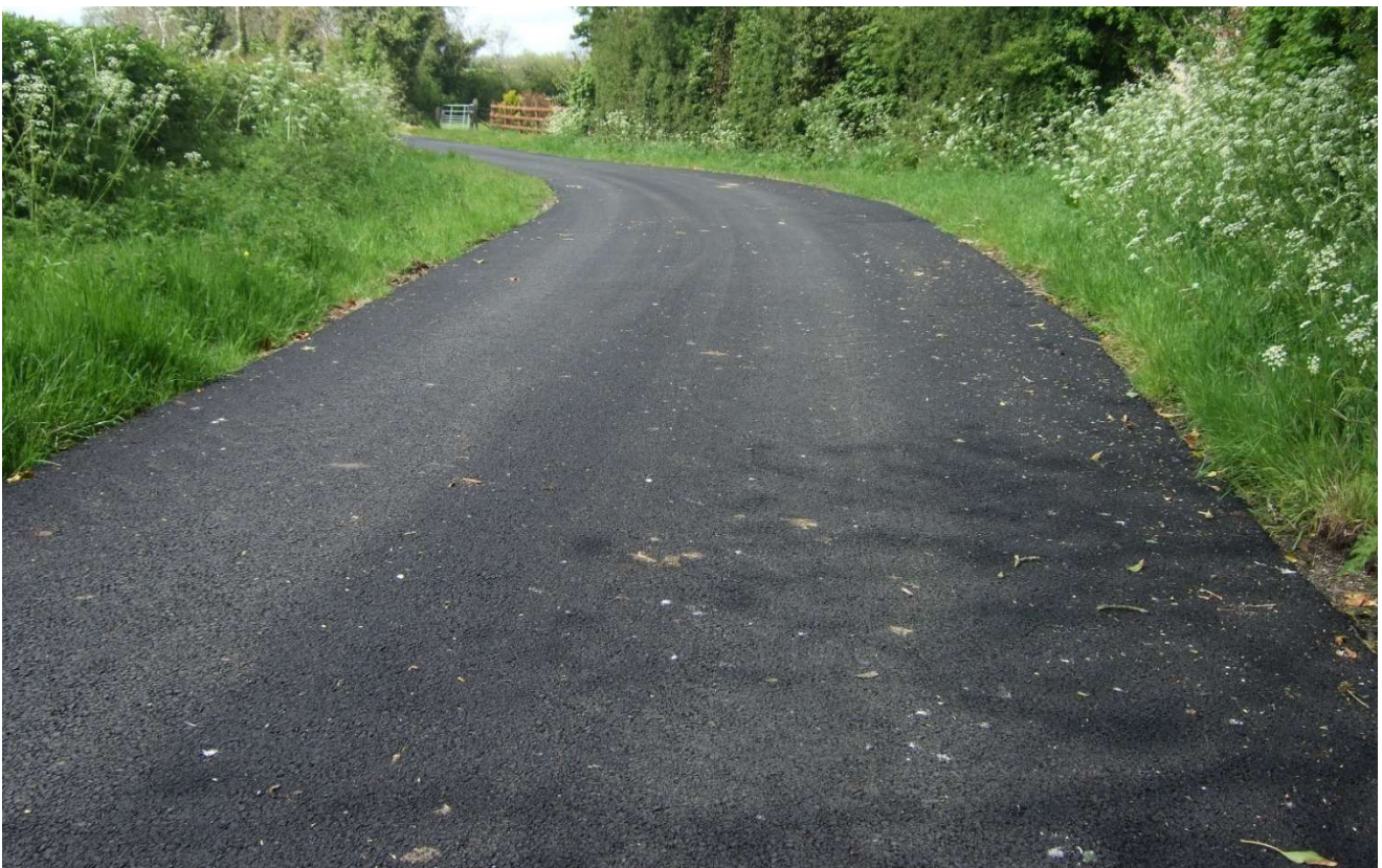
Completed Scheme – Andraid Road