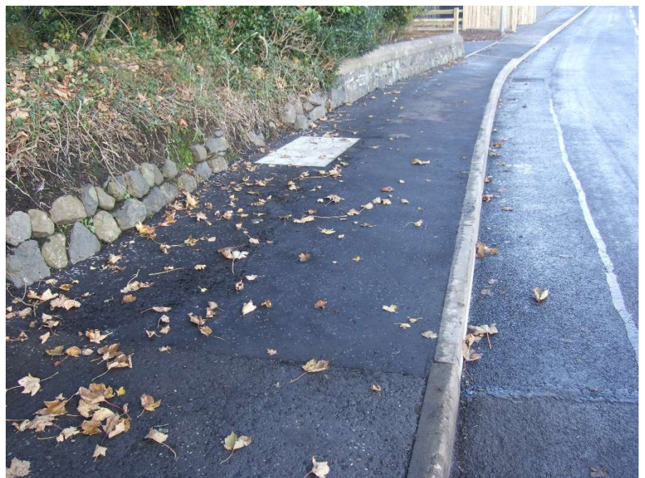
Completed scheme – Taylorstown Road