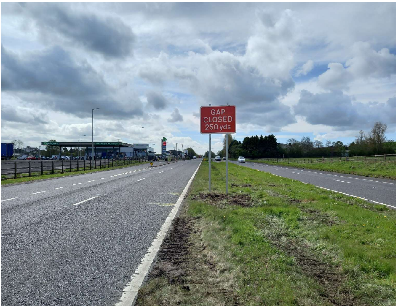
Completed Scheme - A26 central reservation closure – Applegreen, Glarryford.

Following a number of collisions, the crossover point to the southern side of the Apple Green Service Station on the A26 Crankill Road has been stopped up. This scheme has been implemented to improve road safety on one of the busiest roads in the council area, and had the full support of the PSNI and local residents.