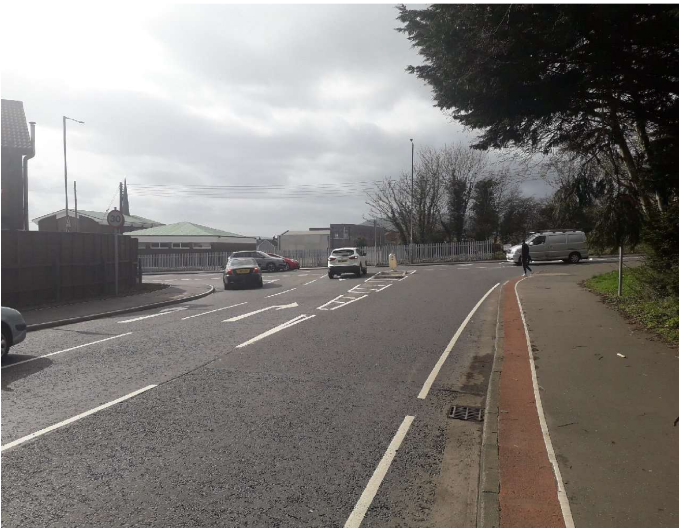
Completed Scheme - Dedicated Left Turn Lane. Prince Andrew Way, Carrickfergus.

A dedicated left turn lane has been provided at the junction of Prince Andrew Way and North Road in Carrickfergus. This scheme will reduce delays and improve traffic progression especially at school times.