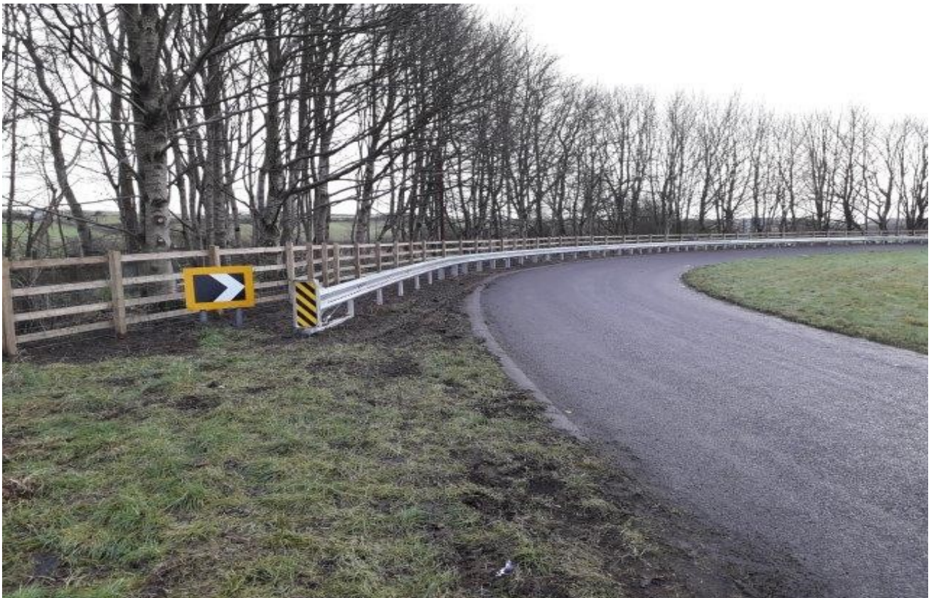
Completed Scheme at Old Ballymoney Road

Maintenance of Structures work completed at a total cost of £12,688