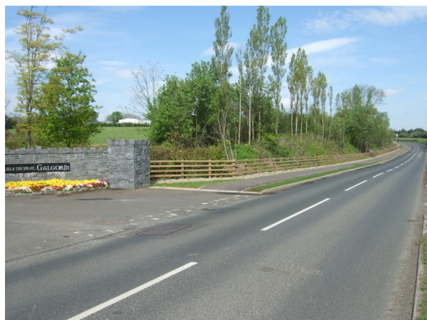
Fenaghy Road - Completed Scheme