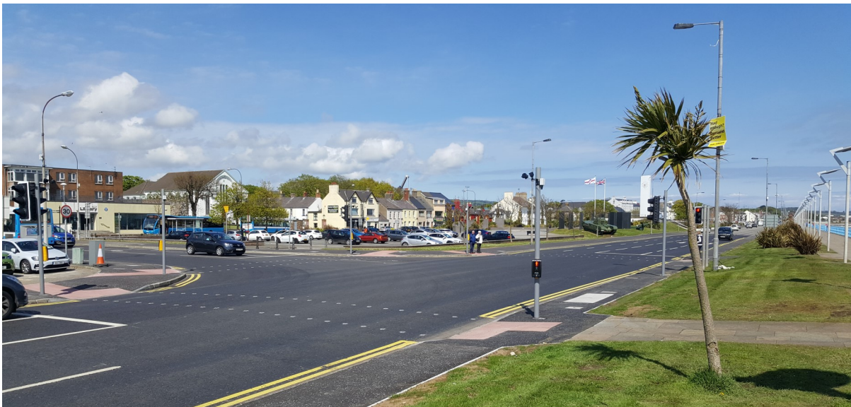
Completed upgrade the traffic signals at Marine Highway/Joymount junction

There is also pedestrian detection at the kerb side to allow the Puffin to cancel the crossing demand should the button be pushed and the pedestrians move away. This allows for a more efficient operation of the signals for both pedestrian and vehicles.