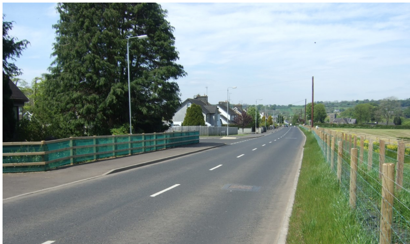
Rathkeel Road - Completed Scheme

The scheme provides a footway from Buckna Road for approximately 450m to the south east towards the 30mph limit. The works also incorporated improvements for traffic emerging from Buckna Road onto Rathkeel Road, as well as street lighting improvements. Land was acquired opposite the houses to provide space along the front of residential properties to facilitate construction of the new footway. The scheme was completed early in 2019. This stretch of the Rathkeel Road was also resurfaced to complement the delivery of the footway scheme.