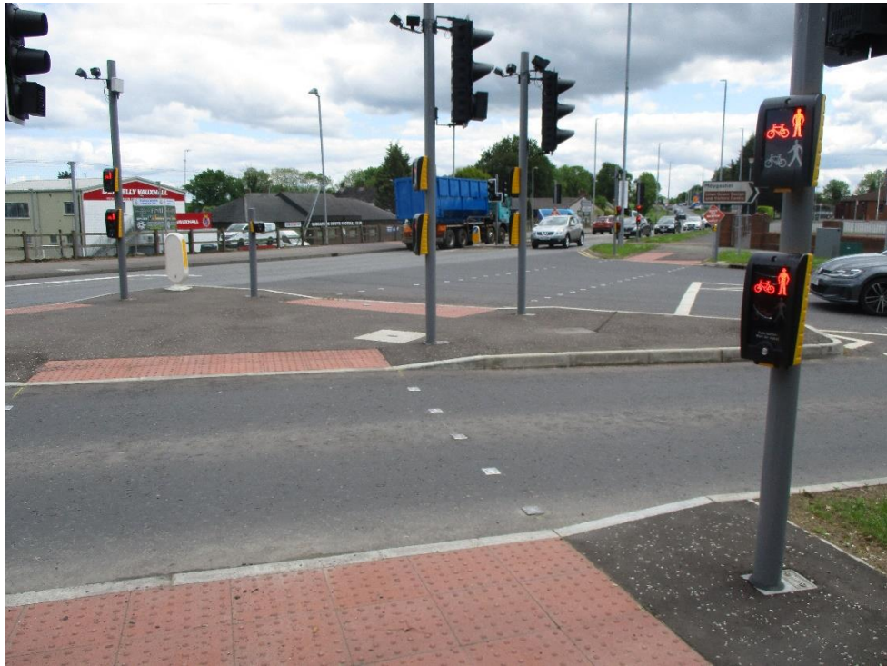
Traffic signal upgrade with Toucan crossing points on A29 Moy Road, Moygashel