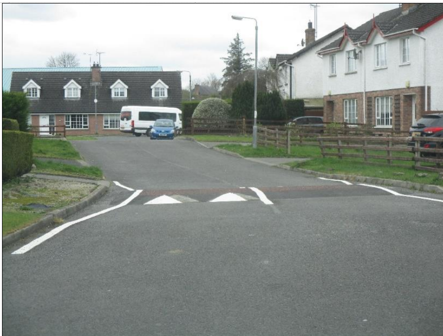
Traffic calming measures on U7102 Ferndale, Clogher