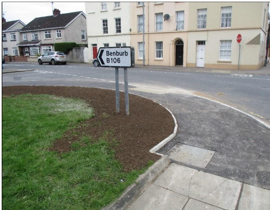
Footway extension with tactile crossing facility at The Diamond, Moy