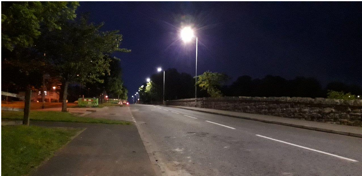
Cemetery Road, Cookstown

Additional funding near year end enabled us to commence completion of Fivmiletown renewal scheme.