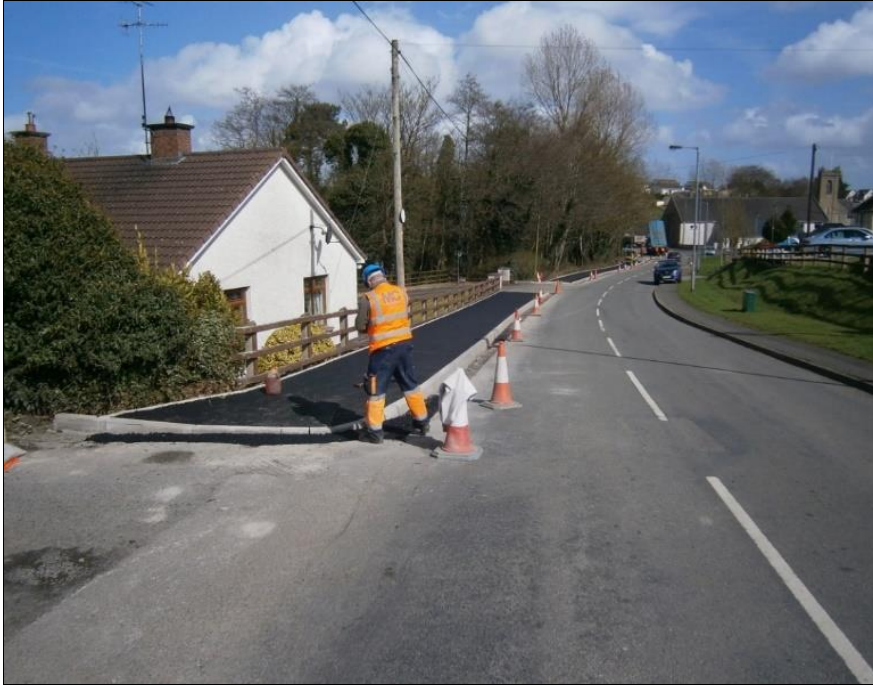
Footway extension with tactile crossing facility on Annaginnny Road, Newmills