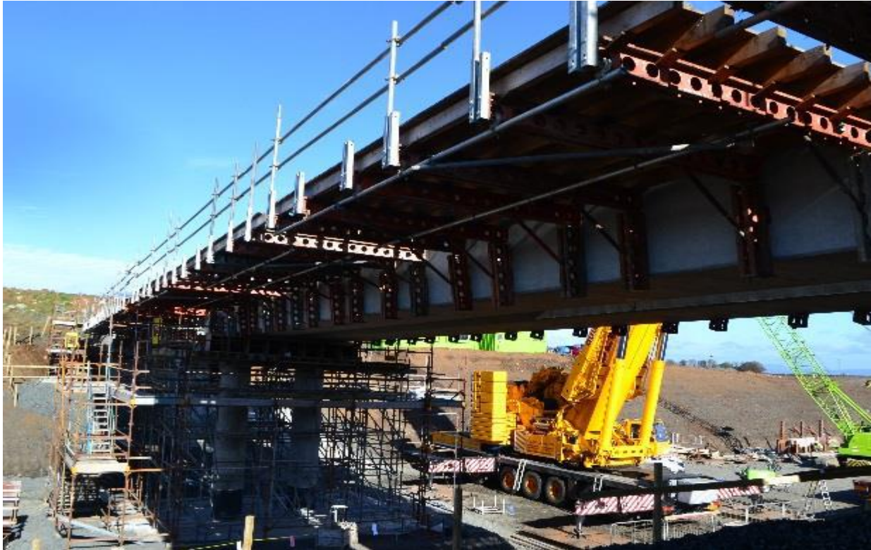
Construction of an accommodation bridge

The scheme represents an investment of £185m, and it remains on programme for the Randalstown to Toome section to open in mid-2019 and the Toome to Castledawson section in 2021.