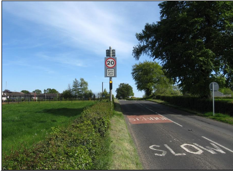
Woods PS trial part time 20mph