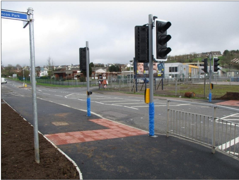
Toucan crossing and footway widening on A45 Oaks Road, Dungannon