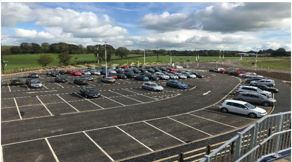
Drumderg Park & Ride complete