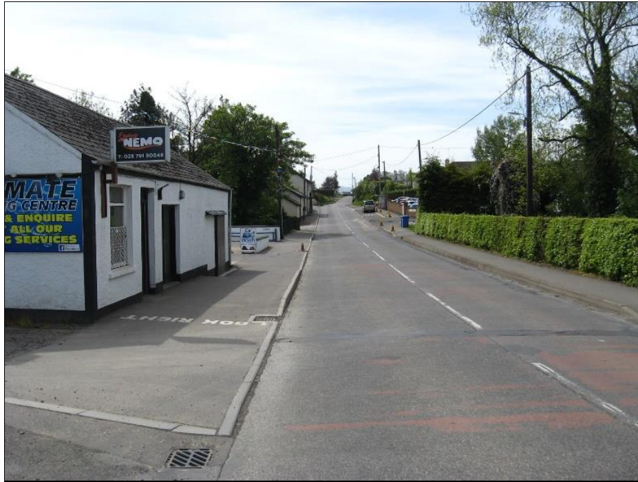
Footway provision - Mayogall Road, Gulladuff