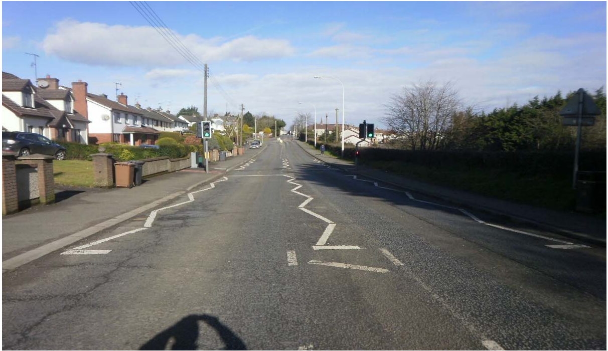
Puffin Crossing on B162 Ballyronan Rd Magherafelt