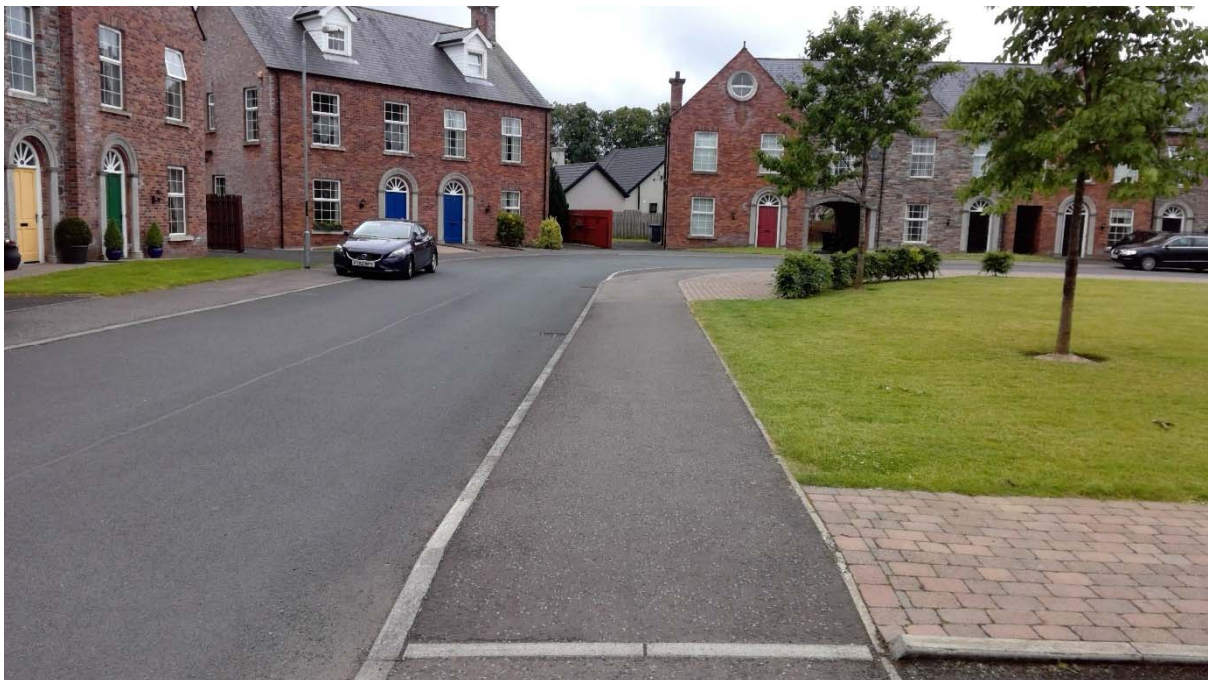
Recently adopted: Brough Village