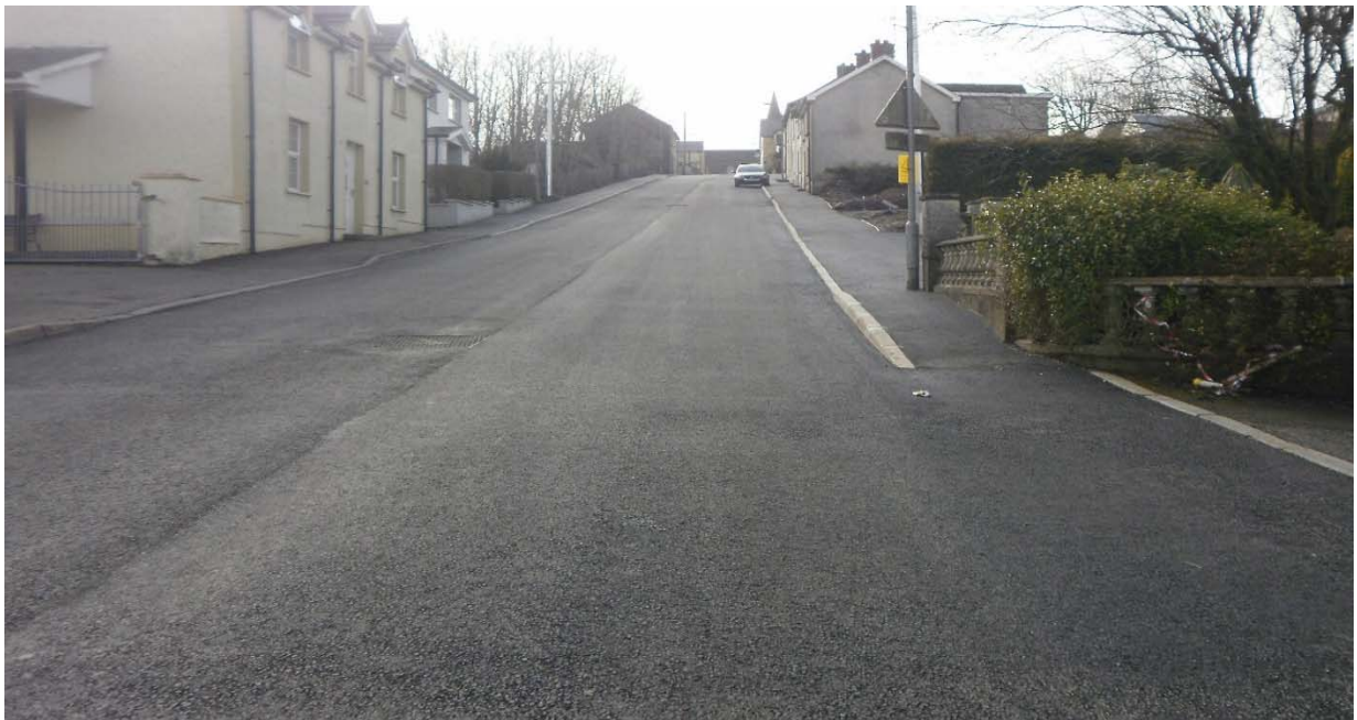
New footway on U0808 North Street, Pomeroy