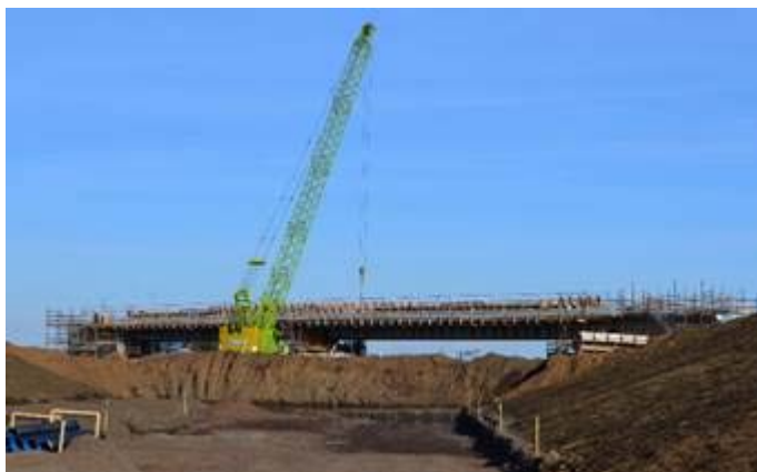
Construction of Derrygowan Bridge

In June 2017 major works began on site with earthworks, drainage, fencing and a number of structures now well advanced. A number of the major junction bridges are progressing with the aim of opening the first section of the scheme between Toome and Randalstown in mid-2019. Completion of the section between Castledawson and Toome is anticipated in mid-2021.