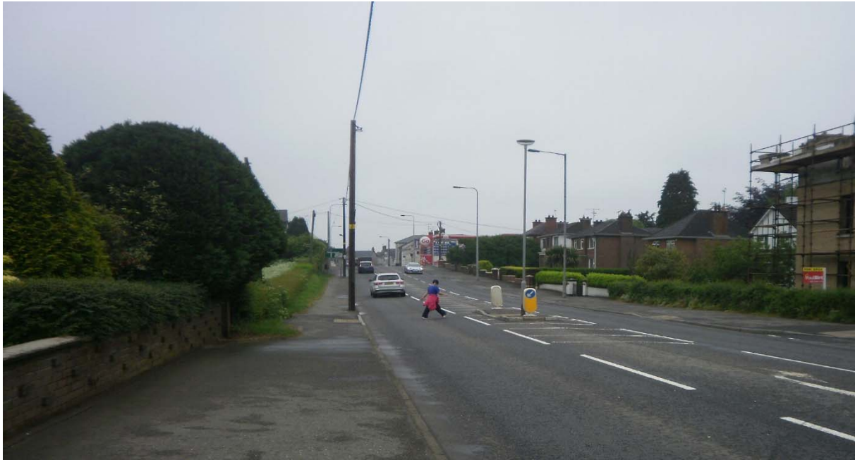
New Pedestrian Island on A29 Moneymore Road, Cookstown