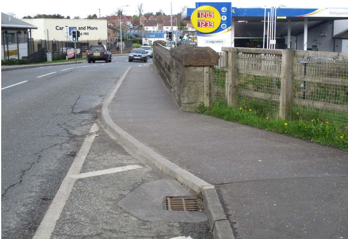
New footway link on A45 Ballygawley Rd Dungannon