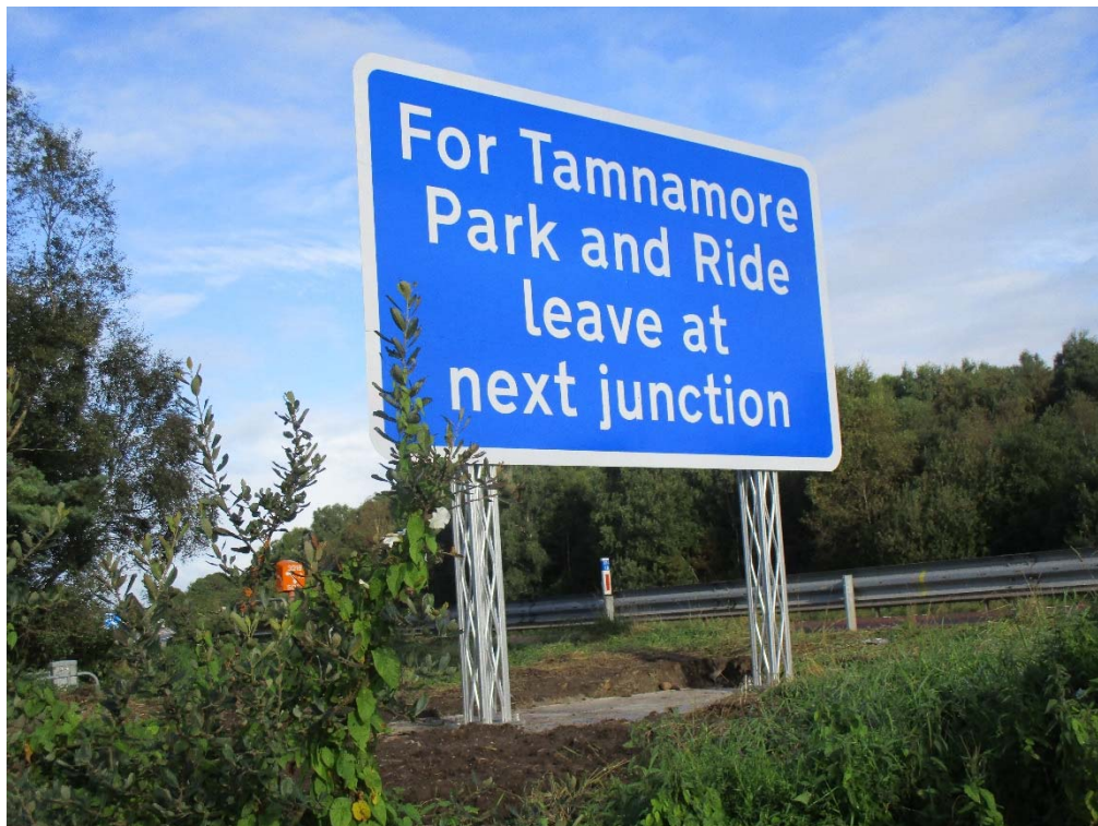
Advance directional signage on M1 approaching Tamnamore Roundabout