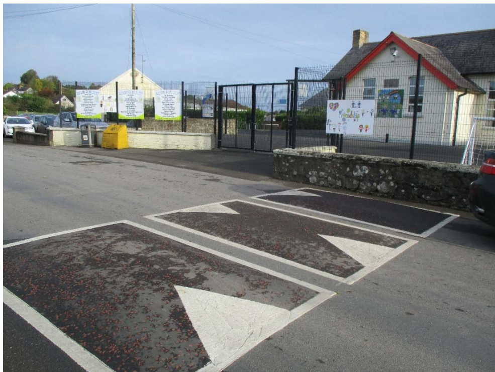
Traffic calming measures on C646 Killyliss Road Eglish