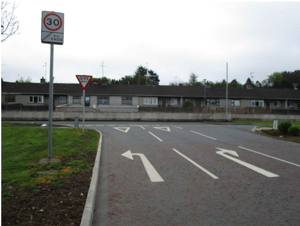
U7506 Lisnahull Rd/B43 Newell Rd – junction widening with pedestrian tactile crossing