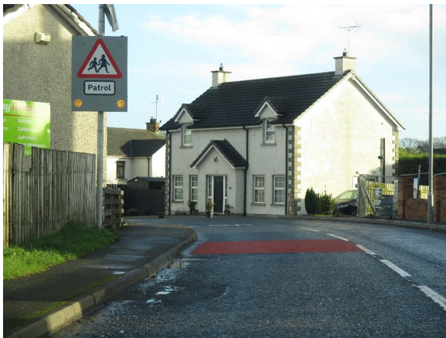
Killyman Safer Routes to School sign with associated coloured road marking