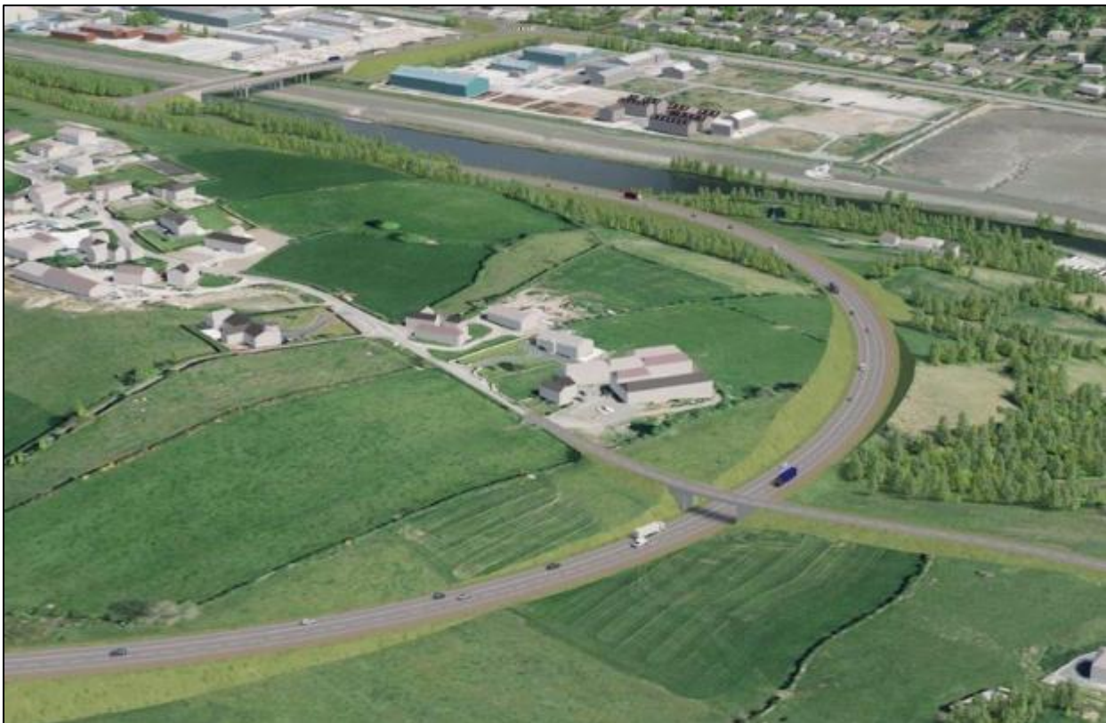
A view of the proposed Newry Southern Relief Road at Flagstaff Road

https://www.infrastructure-ni.gov.uk/articles/newry-southern-relief-road-overview