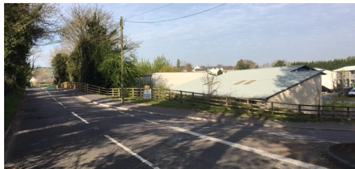
After provision of the new footway