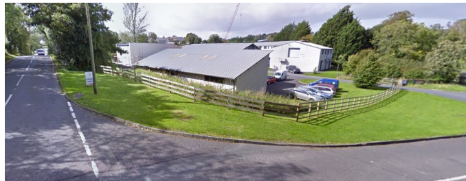
Before the works