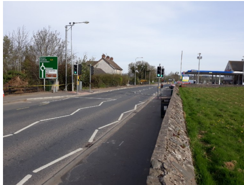
Main Street, Clough