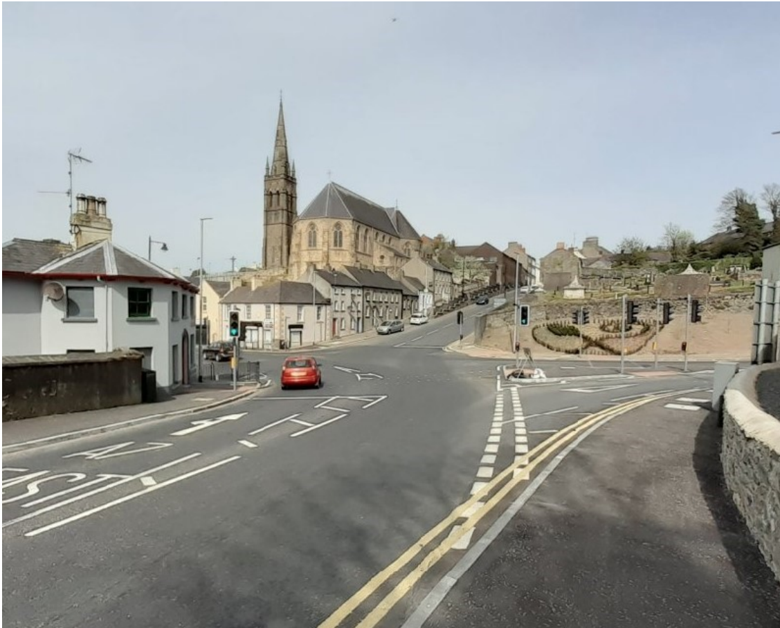
Collins Corner, Downpatrick