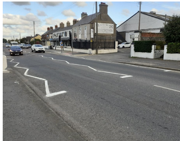
A2 Dundrum Road, Newcastle