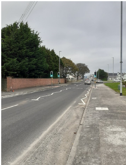
A50 Castlewellan Road. Newcastle

The crossing on Castlewellan Road, adjacent to Dunwellan Park was relocated to the north of the junction, with a new linking footway to the new PUFFIN crossing on Dundrum Road.