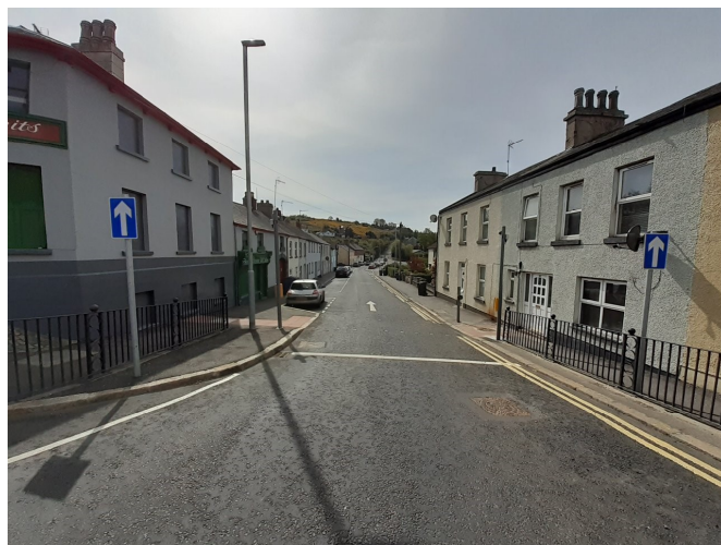
Stream Street - one way traffic system