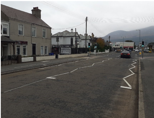
A2 Dundrum Road, Newcastle