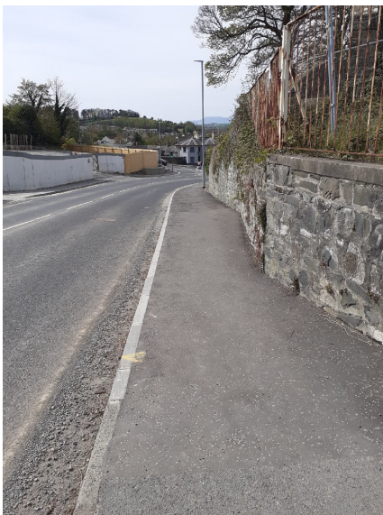
Killough Road, Footway