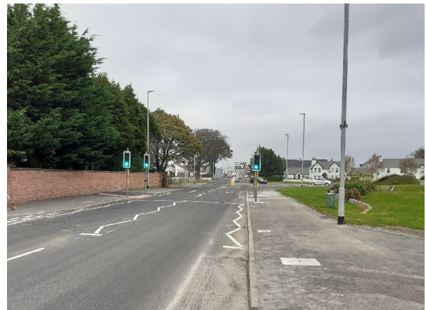
A50 Castlewellan Road Newcastle

PUFFIN CROSSINGS are relatively new in Northern Ireland and further information on their use is available at NI Direct website at: www.nidirect.gov.uk/articles/puffin-crossing