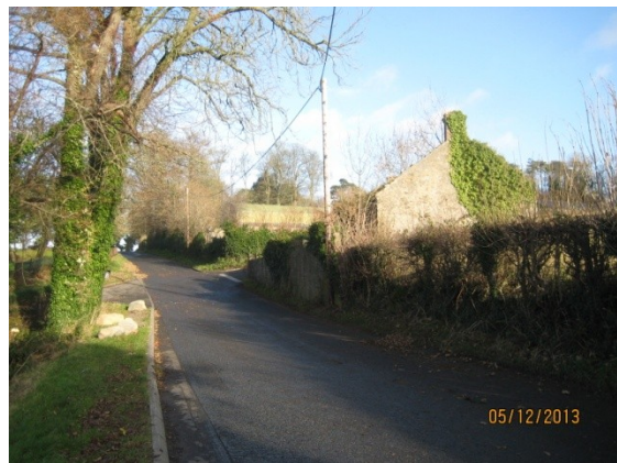
Junction prior to road works