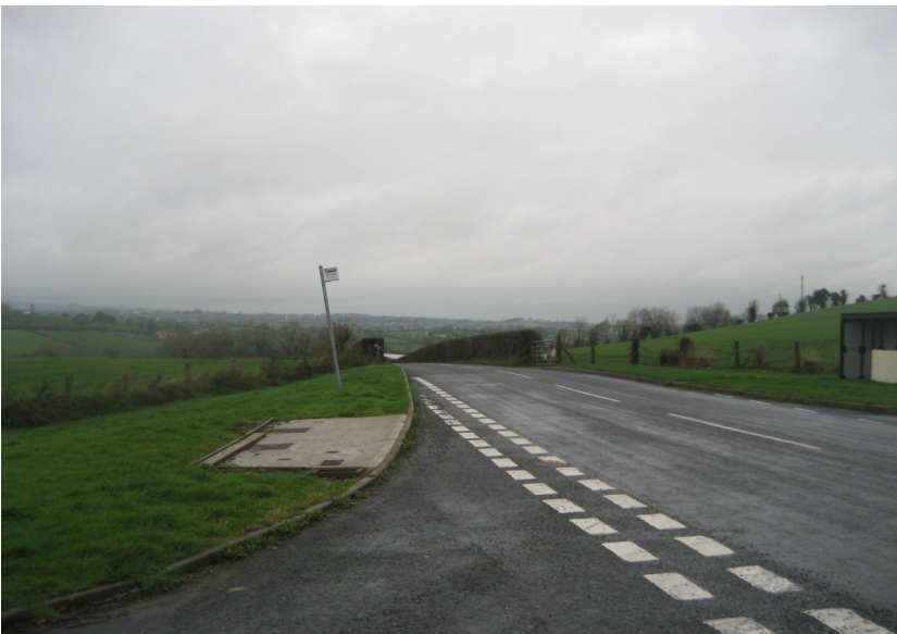
Before the scheme

This scheme to provide improved visibility by removing the crest at this junction and improvements to the junction radii and localised carriageway widening is now completed.