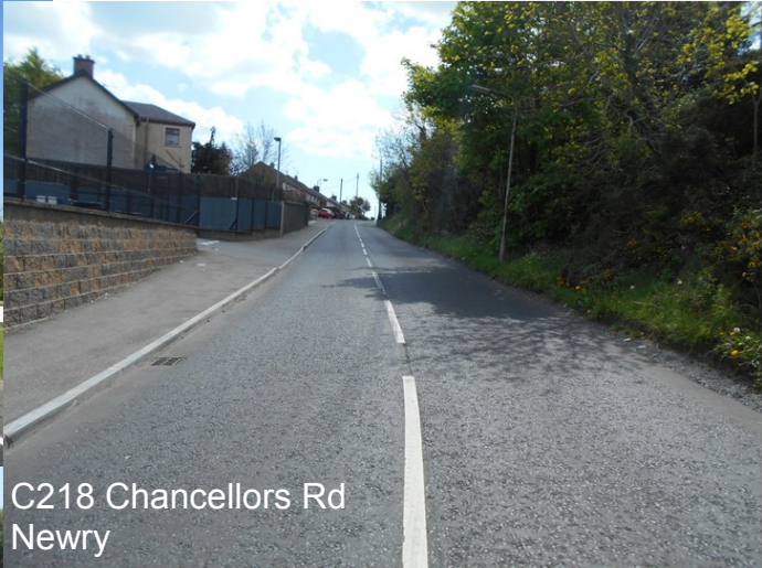
C218 Chancellors Rd Newry