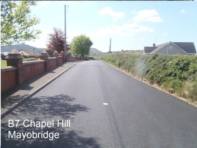
B7 Chapel Hill Mayobridge