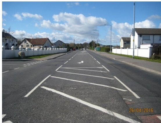
Before the scheme