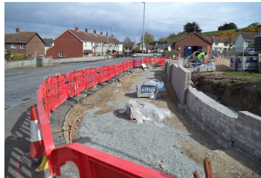
Work ongoing April 2017