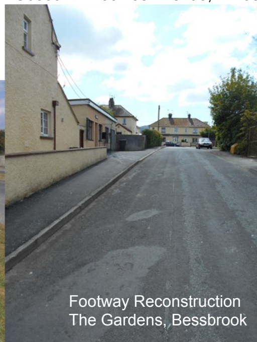
Footway Reconstruction The Gardens, Bessbrook