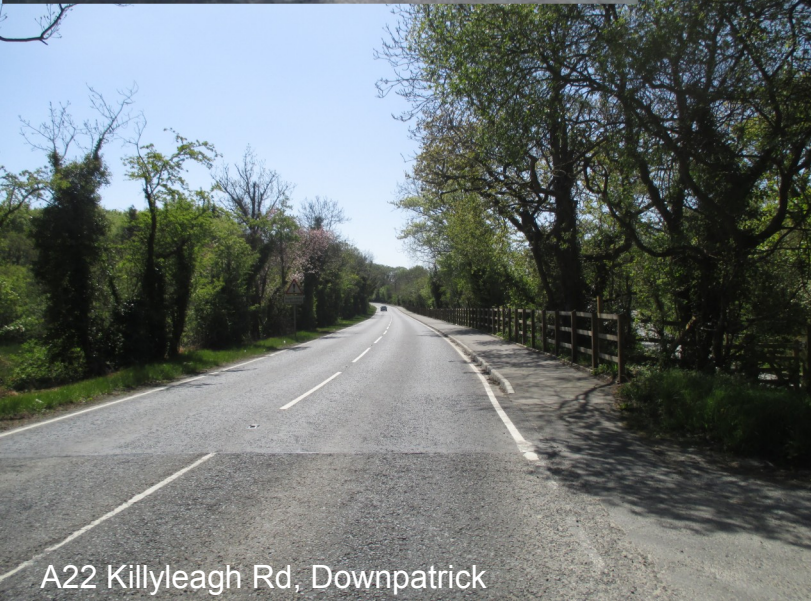
A22 Killyleagh Rd, Downpatrick

Some examples of completed Asphalt Works