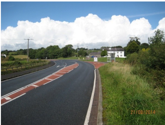
Before the scheme

This scheme provided a 260 metre infill footway link to improve accessibility and road safety for pedestrians along a stretch of the main A24, between Curry's Corner and Rice's Corner and was completed in November 2016