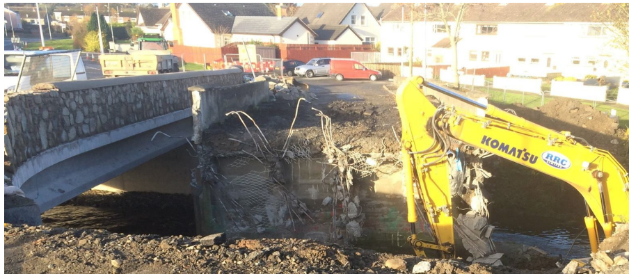
The old Bridge being demolished (the new bridge is on the left)

Other structures strengthened during the period -