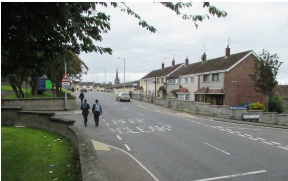
Before the scheme

This scheme, to improve traffic progression, has spanned the 16/17 and 17/18 financial years. The scheme will provide road widening with formalized ‘on-street parking areas’ for local residents on both sides of the street . Traffic calming measures, in the form of road humps are also being provided along Fountain Street and in Kennedy Square. Work is scheduled to be completed by June 2017.