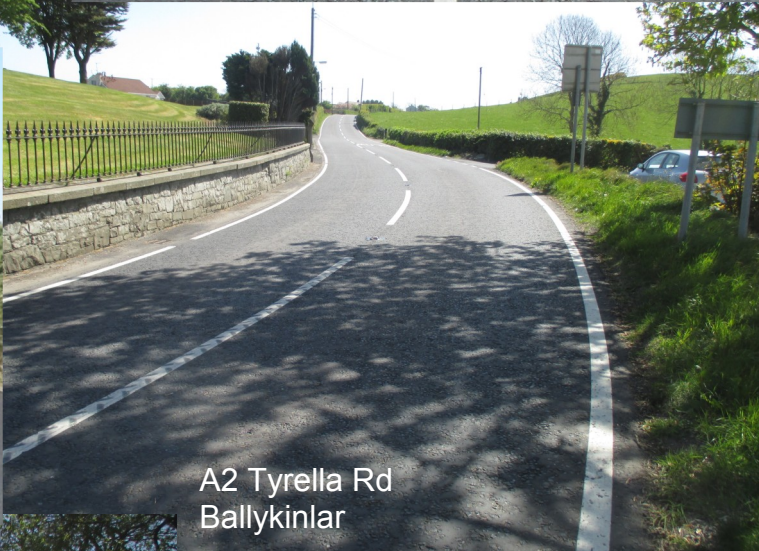
A2 Tyrella Rd Ballykinlar