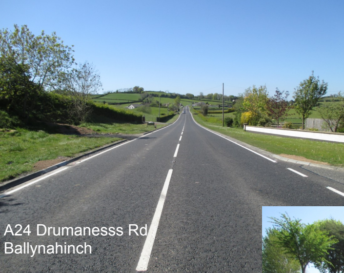
A24 Drumaness Rd Ballynahinch