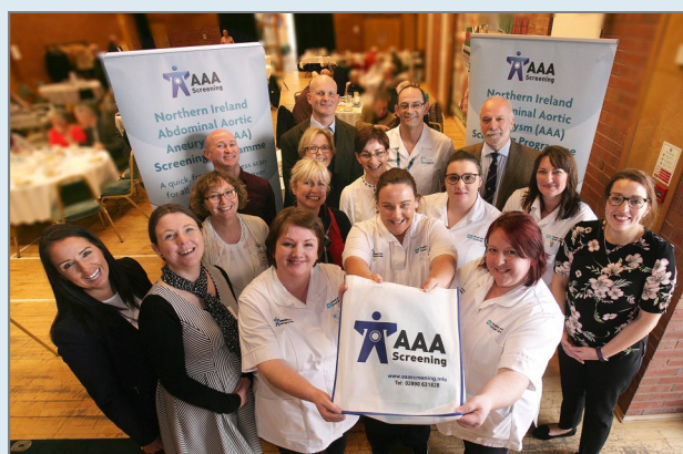
Programme Team members at the 2018 Service User Event