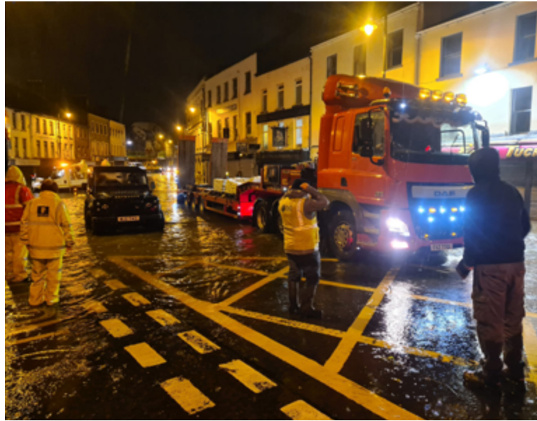
Above & below: Recent flooding in Newry

A video on the RCRG 10-year anniversary is available here: Regional Community Resilience Group | Department for Infrastructure (infrastructure-ni.gov.uk)