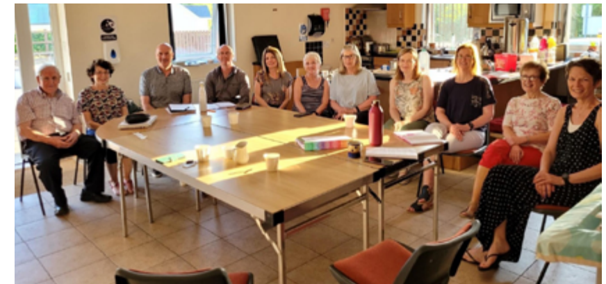
Attendees at the Boho and Eglinton Community resilience meeting

This communication helps to build relationships with affected communities and plays a key part in helping to ensure that they have adequate planning and preparations in place to cope with any future severe weather events.