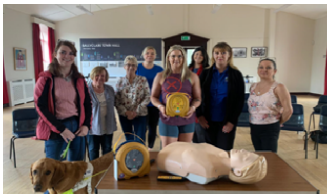
Antrim and Newtownabbey Borough residents recently attended training programme at Ballyclare Town Hall

Trained nurses delivered the 3-hour accredited course which teaches the responsibilities of a first responder, CPR, and use of an AED.