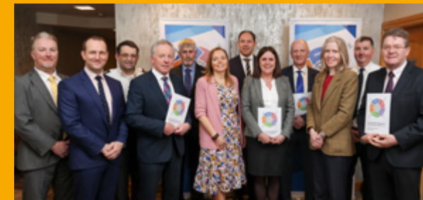
Some members of the Cross Border Emergency Management Group who took part in an exercise in 2022.

The group has recently published their Operational Plan stating their priorities for the period 2022-2025, finalised a Cross Border Notification Protocol and hosted over 100 relevant stakeholders at the Cross Border exercise based on a wildfire event.