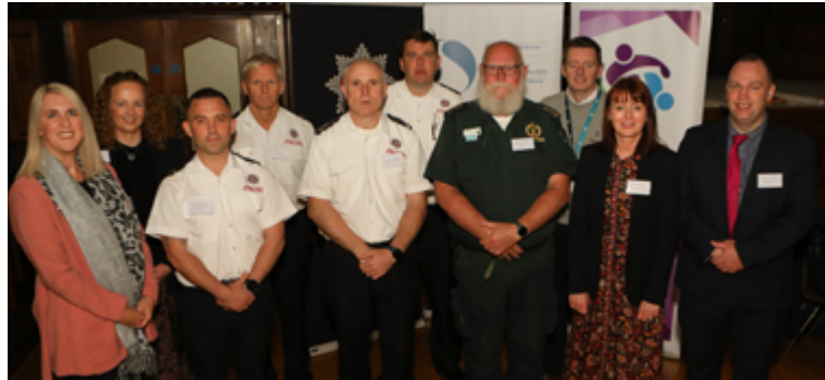
Representatives from the NEPG partner organisations who participated on the panel.

The workshop provided the attendees with an overview of the support structures in place, advice and assistance on how to prepare and