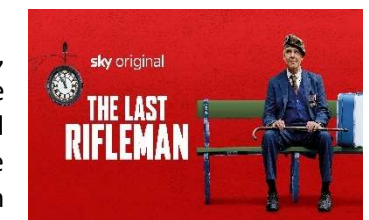
The Last Rifleman