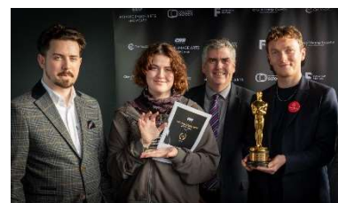
Moving Image Arts 2023 Showcase

Northern Ireland Screen works in partnership with the Council for the Curriculum, Examinations and Assessment (CCEA) and Northern Ireland's three Creative Learning Centres on the continuing development of Moving Image Arts (MIA), the only A-Level and GCSE in the UK in digital filmmaking. Northern Ireland Screen sees MIA as the most significant first building block or entry point to the screen industries. CCEA celebrated the 20 th anniversary of the subject as part of the Moving Image Arts Showcase in November 2023 with over 600 of Northern Ireland's most creative young filmmakers and animators brought together to see their work on the big screen at cinemas in Belfast and Derry.