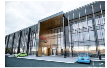
Belfast Harbour Studios