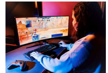
The Pixel Mill