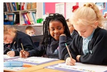
Primary School Stor builder session

The Into Film Programme, free to all schools and other youth settings in Northern Ireland, seeks to fully realise the educational, cultural, and social power of film in children and young people's development. Into Film's new streaming platform, alongside physical and digital teaching resources such as Story Builder increases the emphasis on all school engagement. Enhanced funding from the Department for Communities ensures additional support for schools operating in areas of disadvantage in the provision of film-based education and beyond incorporating games, interactive content and screen-based storytelling. Alongside rich online content for young audiences, this provides 5-19 year olds with inspiring opportunities to learn about and develop a passion right across the screen sectors.