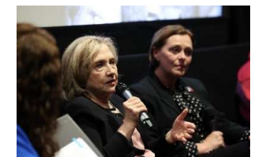
'Lyra' – Hillary Clinton event