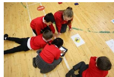
Nerve Centre Primary Coding Partnership

Northern Ireland Screen works in partnership with Northern Ireland's three Creative Learning Centres (CLCs); the Nerve Centre in Derry/Londonderry, Nerve Belfast and the Education Authority's AmmA Centre in Armagh. These centres offer a range of integrated creative digital technology skills programmes for teachers, youth and community leaders and young people to build sustainability in schools and the youth sector. By empowering teachers, the CLCs are encouraging a step change into life-long learning across our schools, youth, and community organisations with the new creative learning approaches of the digital age. A key element of the service provides professional learning programmes for teachers and youth leaders.