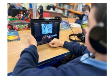
Drumglass Archive Educational Project