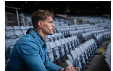
Andrew Trimble: For Ulster and Ireland