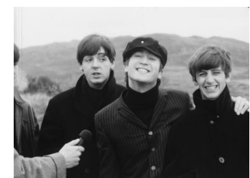
Digital Film Archive clip of The Beatles