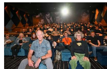
Screening at Belfast Film Festival