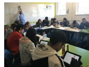
Nerve Centre Belfast

Northern Ireland Screen works in partnership with Northern Ireland's three Creative Learning Centres (CLCs); the Nerve Centre in Derry/Londonderry, Nerve Belfast and the Education Authority's AmmA Centre in Armagh. These centres offer a range of integrated creative digital technology skills programmes for teachers, youth and community leaders and young people to build sustainability in schools and the youth sector. By empowering teachers, the CLCs are encouraging a step change into life-long learning across our schools, youth, and community organisations with the new creative learning approaches of the digital age. A key element of the service provides professional learning programmes for teachers and youth leaders. Need for such services has never been so prevalent as during the coronavirus pandemic when using digital technology to deliver lessons remotely became essential.