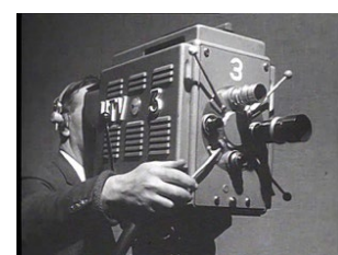
UTV cameraman (c1959)

Containing digitised moving image content that spans from 1897 to the present day, Northern Ireland Screen's Digital Film Archive (DFA) is a free public access resource available online – digitalfilmarchive.net – and at a variety of locations across Northern Ireland. Recognised by the BFI as a 'Significant Screen Heritage Collection', the DFA has been greatly expanded through the support of the BFI's Heritage 2022 Videotape Digitisation scheme and the Broadcast Authority of Ireland's Archiving Scheme 2.