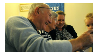
Outreach session Sir Samuel Kelly Care Home (2020)

Northern Ireland Screen provides themed presentations based on the content of the Digital Film Archive (DFA) to a variety of audiences, including community groups and charities, historical societies and schools. All activity is delivered free of charge and tailored to meet the needs and interests of the specific audience.