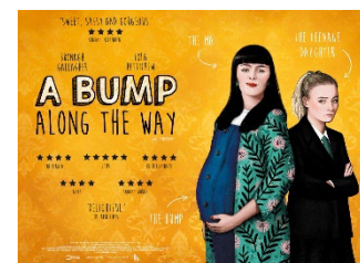
A Bump Along the Way

Development activity is a programme of script development seminars, practical production workshops and access to a professional development executive service across film, television and digital content. The intention is to maximise the prospect of local IP creators reaching their full potential. Our partnership development with the BFI will continue in line with the BFI's new strategy BFI2022. Where possible activities are delivered online.