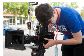
Student on ScreenWorks Camera Department Programme

Delivering on our strategic objective to strengthen the pathways into the screen industries, Northern Ireland Screen has prioritised the need for young people, schools, youth groups, teachers and parents from all social backgrounds to better understand the career opportunities in the screen industries and the pathways to those careers. ScreenWorks and the Screen Academies programmes will continue in 2021/22 in providing young people in Northern Ireland aged 14-19, hands-on, practical work experience, featuring craft and technical roles across all five screen industries, as well as considering any in demand and emerging roles.