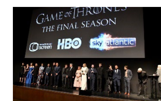
Game of Thrones Premiere

Northern Ireland Screen markets Northern Ireland as a centre for independent film, television and games production to the global screen industries; communicates its success stories; provides practical and financial support for distribution, sales, marketing and PR to the sector. Support for attendance at industry markets, festivals and conferences will continue to be limited during 2021-22.