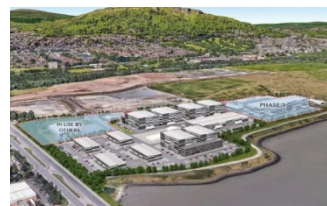
Belfast Harbour Studios

Belfast Harbour Studios, developed by the Belfast Harbour Commission, became available in April 2017. This 'best in class' studio facility complements the film studio infrastructure already developed at Titanic Studios. Northern Ireland Screen markets these film studios and seeks to utilise them to maximum benefit for Northern Ireland. Belfast Harbour Commission has received planning permission for Phase 2 and Loop Studios is nearing completion.