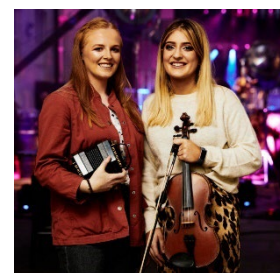
Trad ar Fad

The Irish Language Broadcast Fund (ILBF) fosters the Irish speaking independent production sector in Northern Ireland and serves an audience keen to view locally produced Irish language programming for BBC NI, TG4 and RTÉ as well as other digital platforms. The ILBF also funds a range of training initiatives in television and radio production for Irish speakers working in the sector in Northern Ireland. During 21-22, the ILBF is scheduled to be expanded to reflect the commitments in New Decade New Approach.