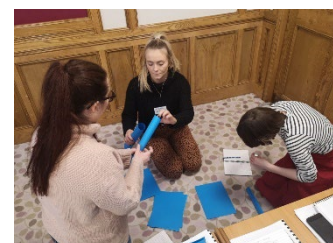
Aim High 5

This Strategy places an even greater focus on skills development and how to facilitate clearer pathways both into the screen industries and through the ranks of the screen industries. Skills development married with production activity yields the best results. Promotion of support for CPD has been increased and, where possible, online training has been carried out.