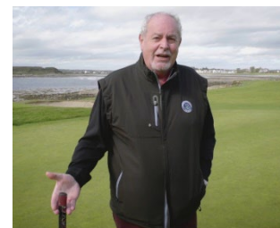
Links to the past

The aim of the Ulster-Scots Broadcast Fund (USBF) is to ensure that the heritage, culture and language of Ulster-Scots are expressed through moving image for a Northern Ireland audience. The USBF is also open to supporting radio and interactive content and funds a trainee scheme designed to attract new researchers or aspiring assistant producers who are passionate and knowledgeable about Ulster-Scots. During 2021-22, the USBF is scheduled to be expanded to reflect the commitments in New Deal New Approach.