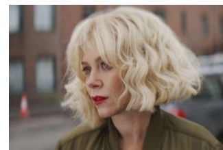
Marcella series 3 filmed in Northern Ireland for ITV and Netflix

The Northern Ireland Screen Fund is both a development investment fund and a production investment fund and is Northern Ireland Screen's primary tool in accelerating the development of the screen production sector. It is targeted at 6 Sectors; Large-Scale Production, Animation, Television Drama, Factual/Entertainment Television, Interactive/Games and Independent Film. It remains unchanged for the last year of the current strategy in 21-22.