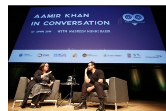
Amir Khan at the Belfast Film Festival

Northern Ireland Screen provides core funding to the key film festivals in the region: Belfast Film Festival; Docs Ireland Festival; Cinemagic Film Festival; Foyle Film Festival and Northern Ireland's only cultural cinema, the Queen's Film Theatre (QFT). It is anticipated that the activities of these organisations will continue to be negatively impacted on for most of 21-22. However, as with Belfast Film Festival, virtual editions of these festivals and institutions can be successful as a bridge to future growth.