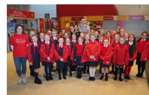
Holy Cross Girls Primary School attending the BAFTA Kids: Behind the Scenes event

The Into Film Programme, free to all schools, colleges, and other youth settings in Northern Ireland, seeks to fully realise the educational, cultural, and social power of film in children and young people's development. An enhanced funding package from the Department for Communities ensures additional support for schools operating in areas of disadvantage, securing the long-standing collaboration of Into Film, Nerve Centre and Cinemagic in the provision of film-based education. More than 70% of Northern Ireland schools engage with our programme of Into Film Clubs, special cinema screenings, and resources and training to support classroom teaching. Alongside rich online content for young audiences, this provides 5–19-year-olds with inspiring opportunities to learn about and with film and develop a passion for cinema.