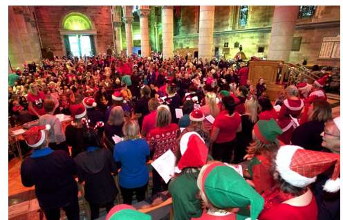
Singing with Santa Event Dec 2019