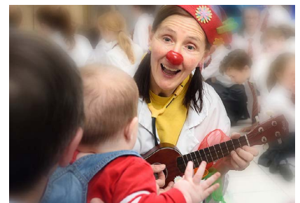
Arts Care Clowndoctor at the Children's Hospital