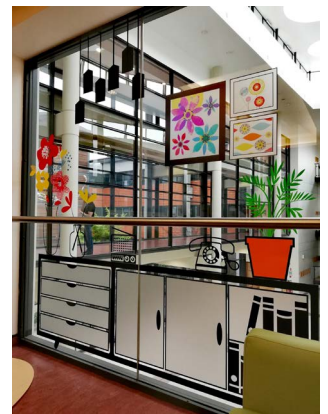
View from the Snug to the Atrium