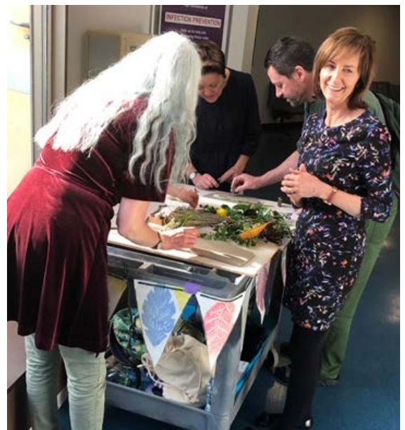
Art Trolley Activity, BCH Foyer