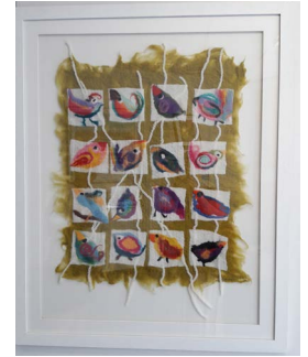
Work from Imagine That!