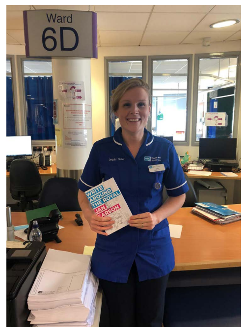
Books arrive at Ward 6D