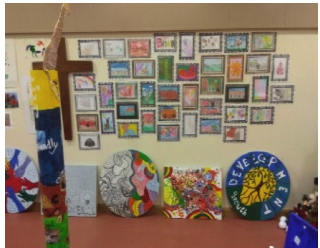
Arts Care Arts Awards 2019