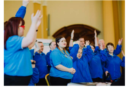
Equal Notes Choir

Arts Care NI run additional regional programmes which involve Belfast Trust – Clown Doctors and Cartwheel for Children and Young People, Twilight Project for Looked After Children and Here and Now Older Peoples Festival. For further information see www.artscare.co.uk