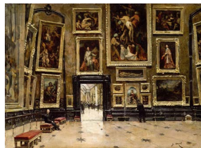
Salon Carré 'at the Louvre Paris (inspiration)