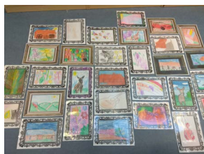
"You've Been Framed" (our interpretation)