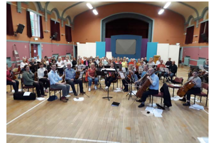
Staff Orchestra and Choir in Rehearsal May 2019