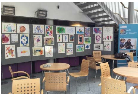
Exhibition at the Arches WTC

'What a fabulous launch event.... I could feel the excitement building in me as I walked down the stairs and the music wound its way up to me. It was great to show off the great artistic talent of so many children with ASD in the midst of Autism Awareness month.'