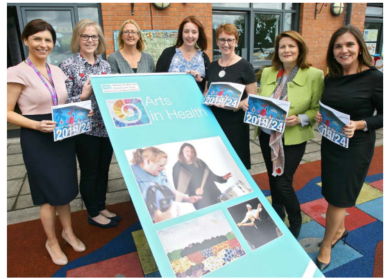
Launch of Arts in Health: The Next Chapter 2019-24 at Shankill Sure Start, May 2019