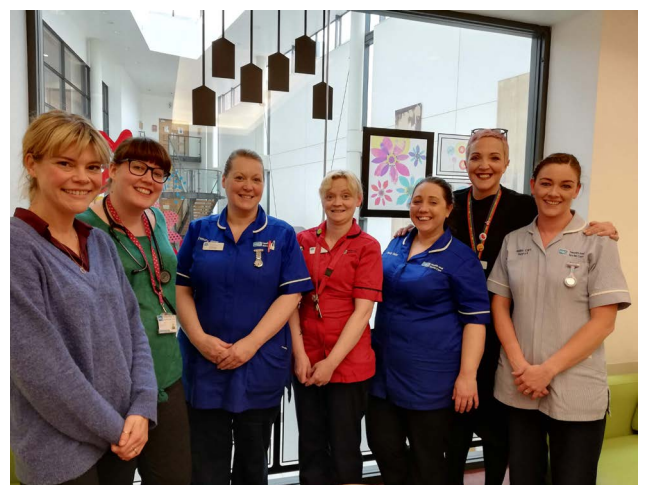
Staff celebrate the launch of the Snug, Ward C, Mater Hospital