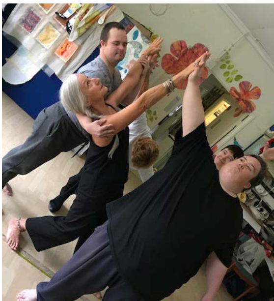
Arts Care Orbit Dance prepare for the Spring Festival

‘My husband has been telling me all about what’s been going on each day, it’s given him a real lift and a sense of normality.’ Family reflection