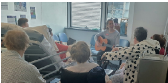
Mind Body Music at RVH