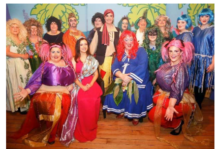
Arts Care Musgrave Park, Sinbad Panto Cast 2019