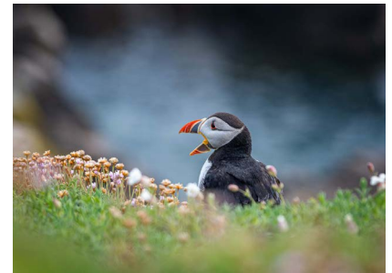
The Calling by Steven Pratt, BPIC