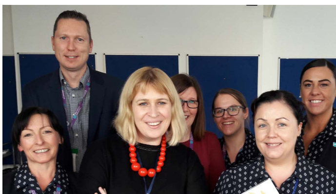
Staff Workshop at RBHSC