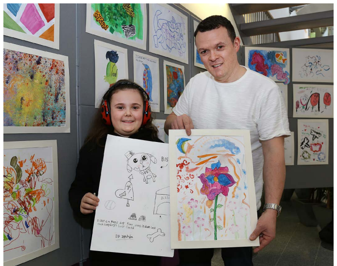
Proud artist at the Exhibition Launch