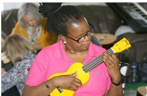
Sing for Health Staff workshops, May 2019