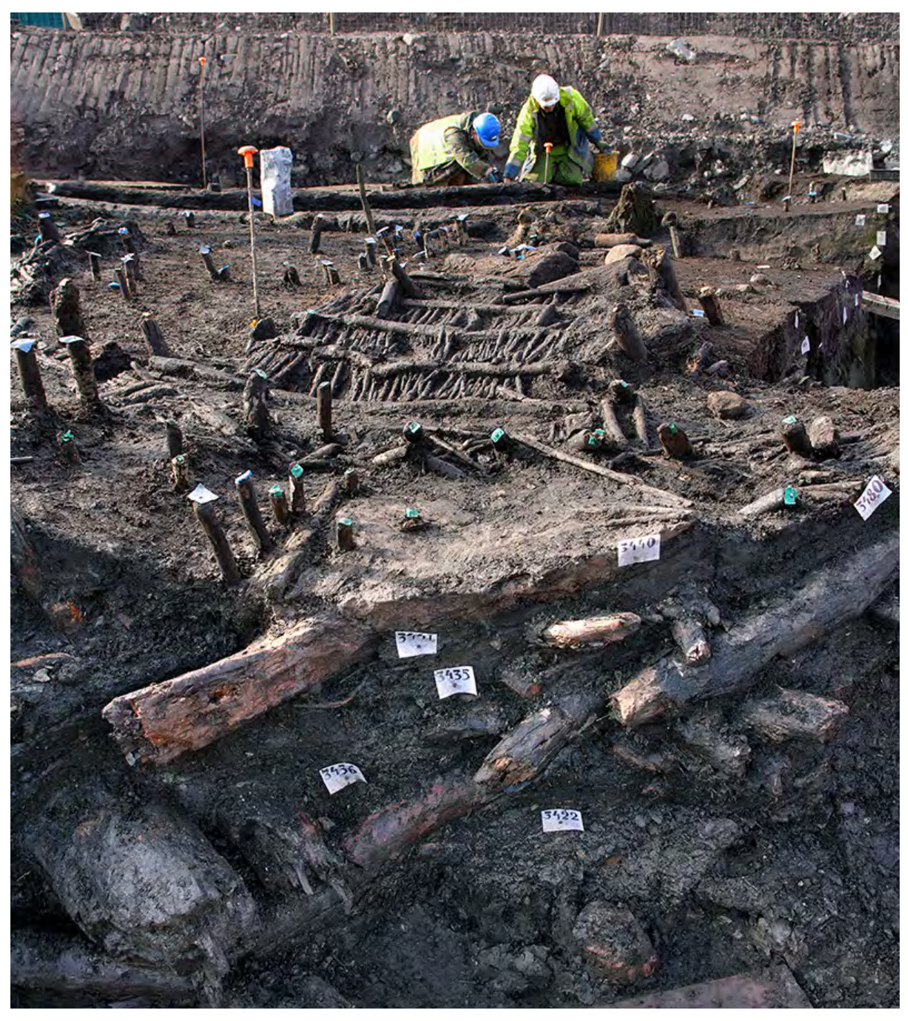
Excavation at early Christian crannog, Drumclay

The above headings are not exhaustive, and are provided as guidance in the assessment of 'significance'. Many of the named heritage interests will apply to the assessment of the significance of statutorily protected heritage assets. Criteria for their designation is however derived from legislation.