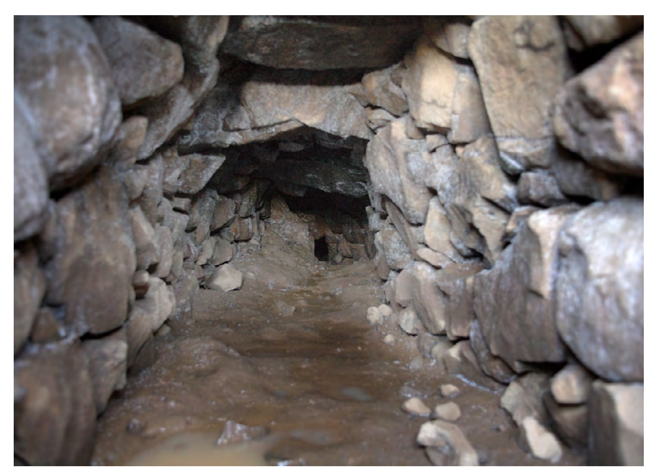
Excavation of part of the souterrain at Bushmills distillery (Clogher Anderson ANT 007-021)

These are explained in more detail within the 'Understanding Significance' section later.