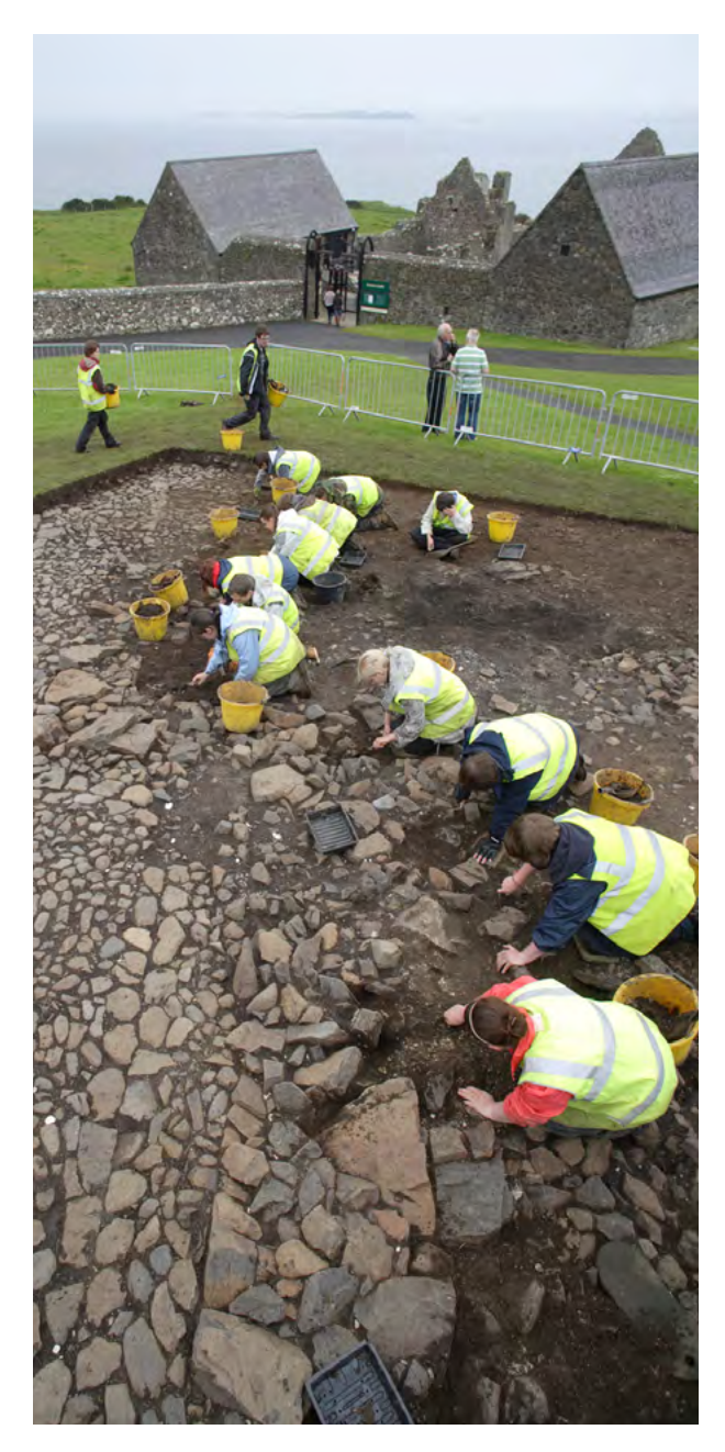
Excavation project at Dunluce

'We have a responsibility to present and future generations to protect and enhance our environment and to conserve the rich diversity that our natural and built heritage possesses.'