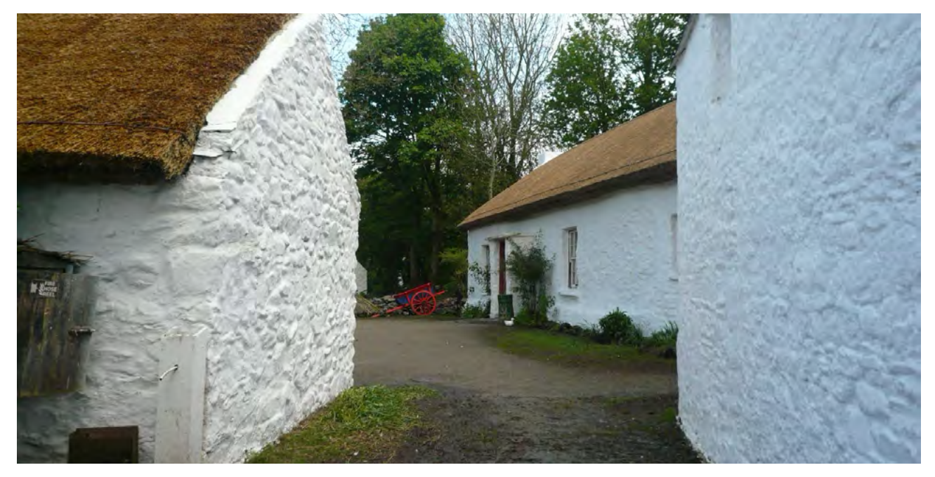
Vernacular grouping, Thomas Mellon Homestead, Omagh