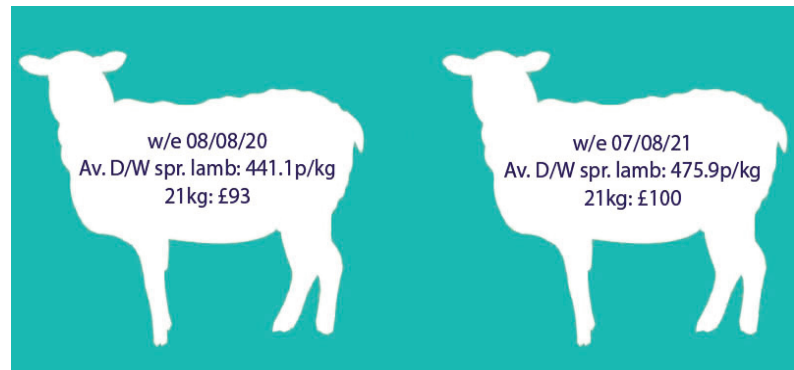
Figure 2. Deadweight lamb price in NI during the week ending 07 August and the corresponding period last year.

ROI continues to act as an important outlet for locally produced lambs with 4,935 lambs exported for direct slaughter to processing plants in the