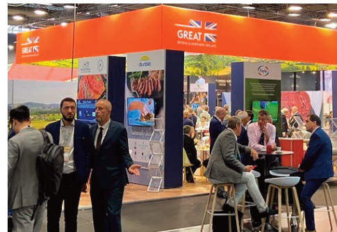
Image 1: Quality Meat from GB & NI showcase in the Meat Hall at the SIAL Paris 2022 Global Food Fair

protein sources as an alternative to meat and dairy products. Ian Stevenson again: "The ingress made by these businesses within the meat sector has been very small up to this point, less than 0.5% of the global meat protein market. The work done by meat promotion bodies around the world in promoting the sustainability of animal-based farming systems has been immense. "Much of this has centred on the key nutritional benefits delivered by animal protein within a balanced diet. However, this momentum must be built upon for the future. "The main reason people choose to eat plant-based meat alternatives is to feel healthier so it is clear that health remains a key driver of consumer behaviour, but sustainability, ethics and satisfaction are important considerations."