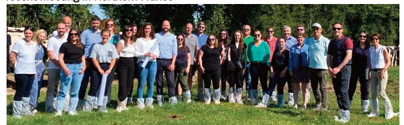
Image 2: ERBS members on a visit to view and discuss sustainability improvement actions being deployed on a dairy, beef, and arable farm during a recent meeting in Northern France

the work that has been undertaken in driving a pan-European response to the Common Agricultural Policy's new 'Green Deal'.