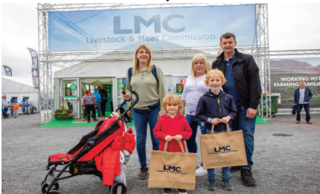
Image 1: A family pictured looking very content after visiting the LMC stand at Balmoral show last year!

"These objectives have been a priority in developing the exhibition that encapsulates our presence at Balmoral 2022," he said.