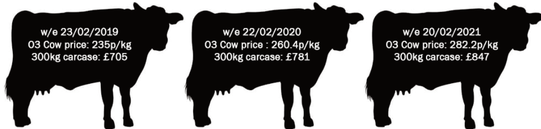
Figure 2: O3 grading cow prices during the w/e 20 February 2021 and the corresponding weeks in 2020 and 2019.

Meanwhile the cow trade in the Republic of Ireland has come under pressure in recent weeks and remains well behind the price paid in Northern Ireland. Last week the equivalent O3 cow price in Ireland was 257.8p/kg which is 24.4p/kg less than the price paid in Northern Ireland. This equates to a £73 differential on a 300kg O3 grading cow.