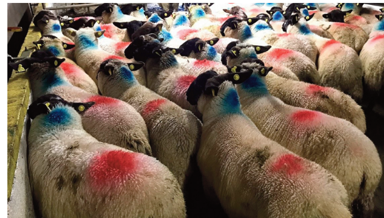
Image 1: Reports have indicated tighter supplies of hoggets for slaughter in NI

ROI remains an important outlet for the NI sheep sector. Reports have indicated a tightening in hogget availability in ROI with demand currently running ahead of supplies. This has created a firm demand for domestically produced sheep in ROI as well as imported hoggets sourced in NI.