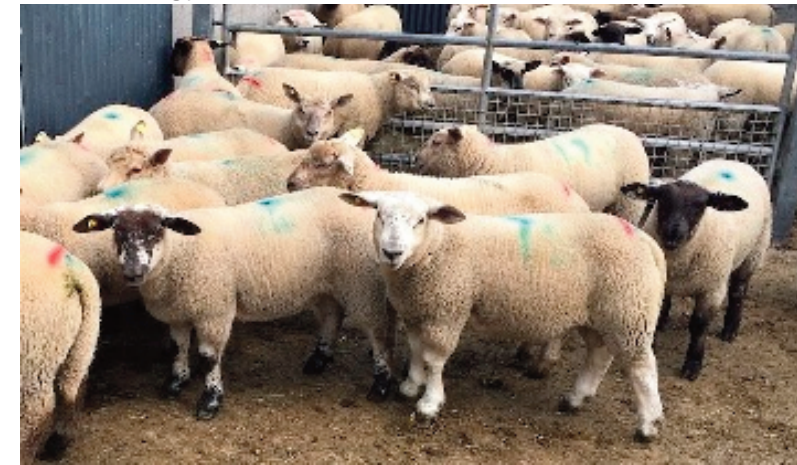
Image 1: Lamb supplies for processing and export for direct slaughter have increased strongly in recent weeks in line with normal seasonal trends.

Producers are encouraged to present lambs for slaughter that meet current market specifications as these will provide the greatest returns to both the producer and the processor. Current market specifications are for E, U and R grading lambs up to 21kg with a fat class of 2 or 3 and that have FQ status.