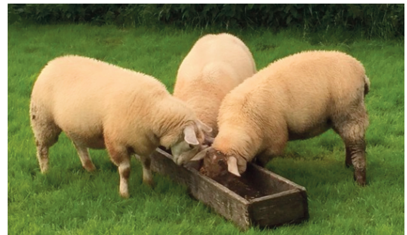
Image 1: Tighter hogget/lamb supplies and an uplift in demand due to Ramadan have contributed to an improvement in the deadweight trade for sheep.

Also as outlined above any products placed in storage under the Private Storage Aid scheme will come back onto the market between three and five months later. This could potentially have a detrimental impact on the deadweight trade further down the line if it creates an imbalance between supply and demand.