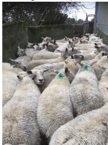
Figure 1: In spec hoggets meet the widest range of retailer specifications

Local processors are still keen to source hoggets that meet current market specifications. Producers should aim to present hoggets for slaughter that fulfil specification requirements to help maximise returns.