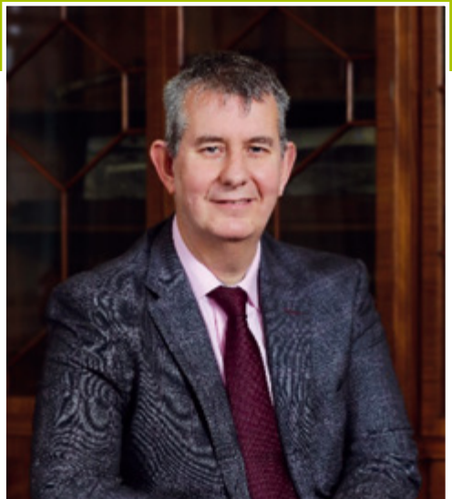
Edwin Poots MLA

I am therefore very pleased to publish this strategy, which will guide how we optimise our use of science to help deliver Departmental and Programme for Government (PfG) objectives, contribute to the furthering of international commitments and to achieve DAERA's vision for sustainability at the heart of a living, working, active landscape, valued by everyone.