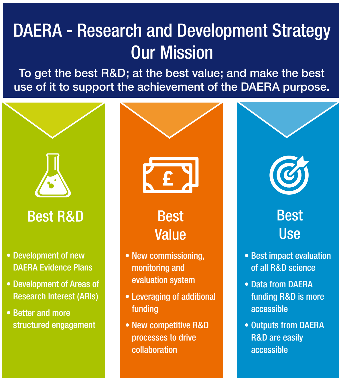
Figure 3 - Key actions to achieve Best R&D, Best value and Best use Goals

10.1 The essential components needed to improve R&D and achieve the goals outlined in Section 7 have been considered. These are shown in: